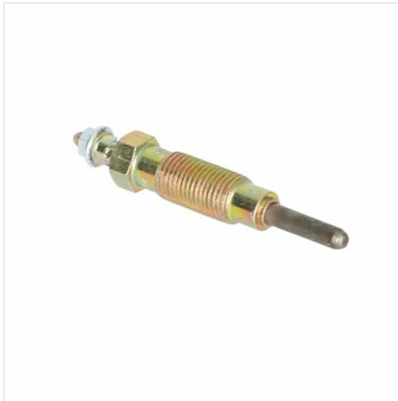
Figure 3.1: The threaded end of the glow plug, which must be carefully installed into the engine block.