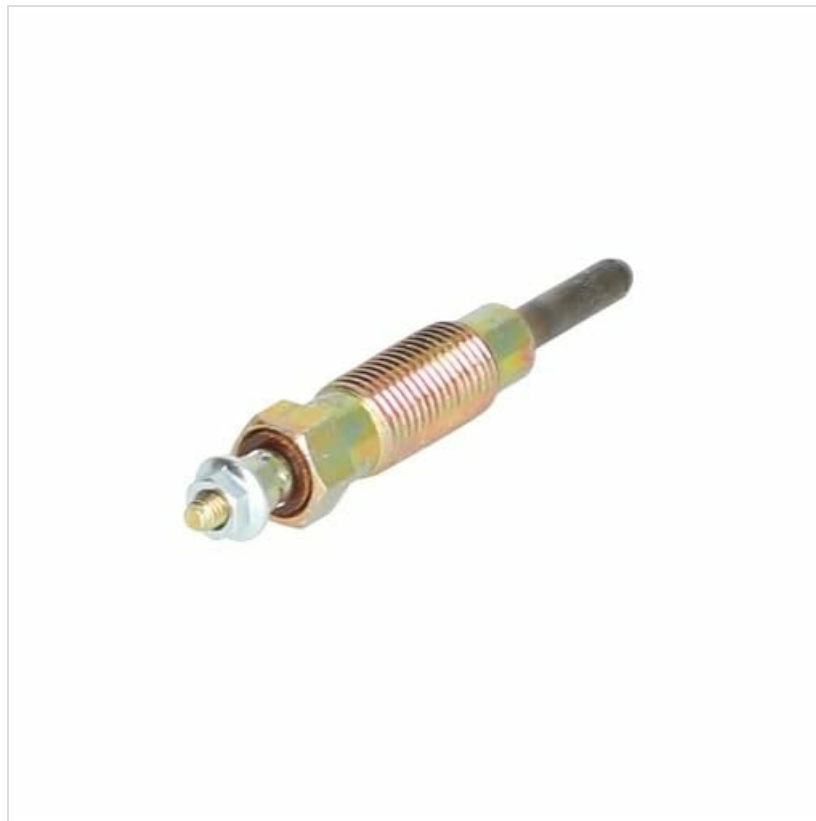
Figure 2.1: The Parts ASAP Glow Plug, a critical component for diesel engine cold starts.