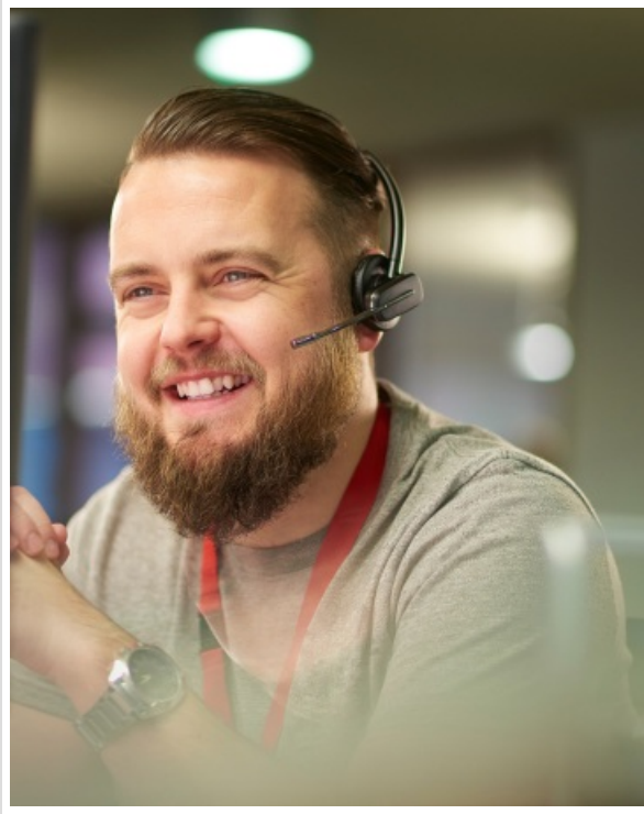
Figure 9.1: Our dedicated support team is ready to assist you.