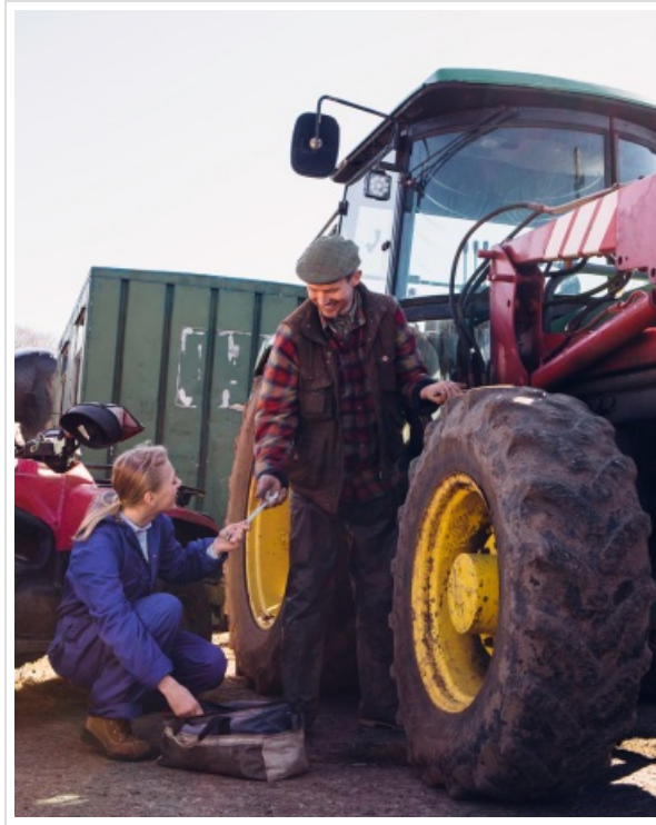
Figure 5.1: Regular maintenance and inspection of all tractor components are vital for longevity.

Glow plugs should be replaced as a set, even if only one is found to be faulty. This ensures consistent performance across all cylinders and prevents premature failure of other older glow plugs. Follow the installation steps outlined in Section 3 for replacement.