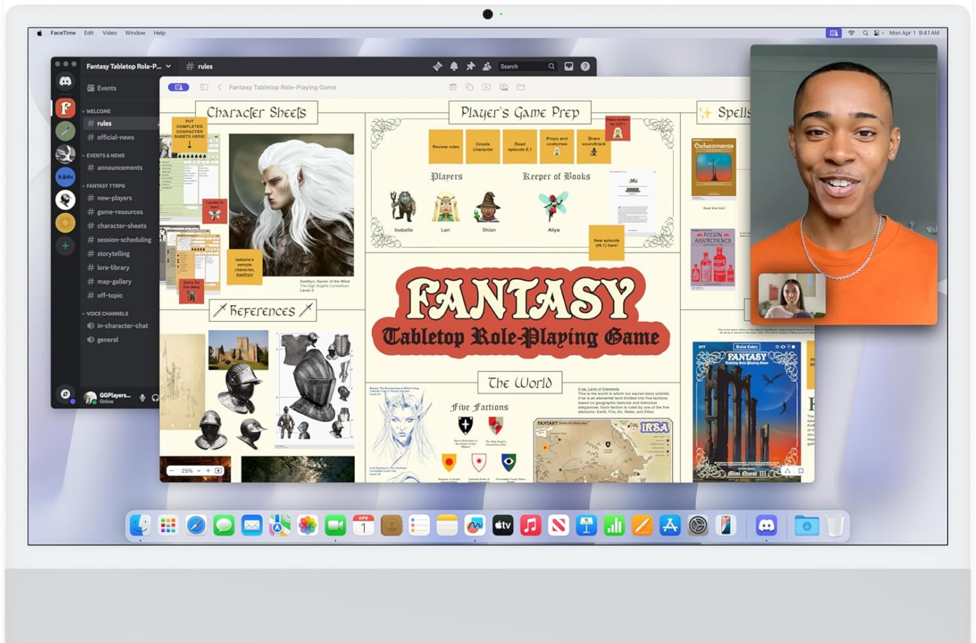
Image: An iMac screen showing a complex graphic design or gaming interface, illustrating the powerful performance enabled by the M4 chip.