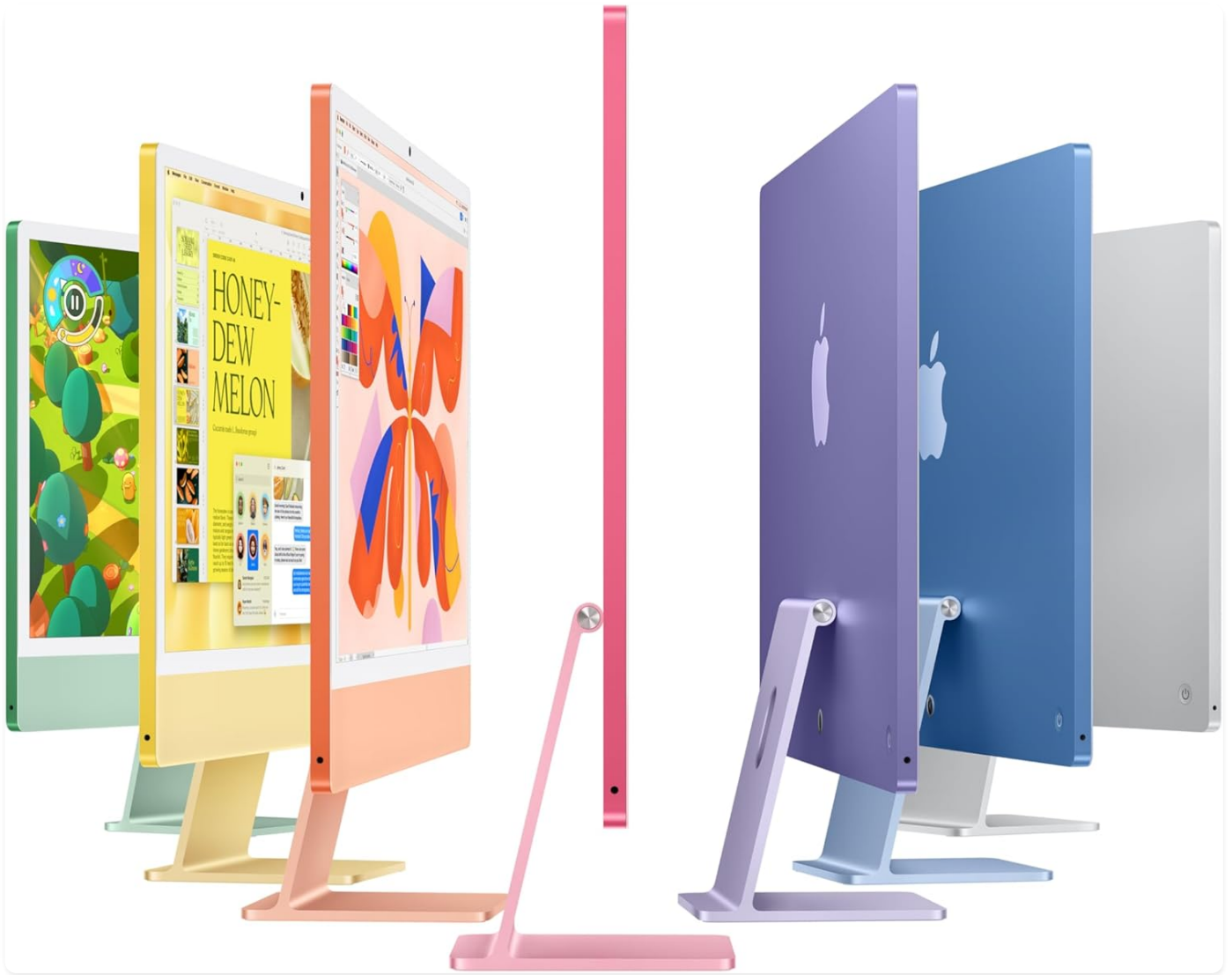
Image: A lineup of Apple iMacs in various colors (green, yellow, pink, purple, blue, silver), viewed from the side to highlight their thin design.