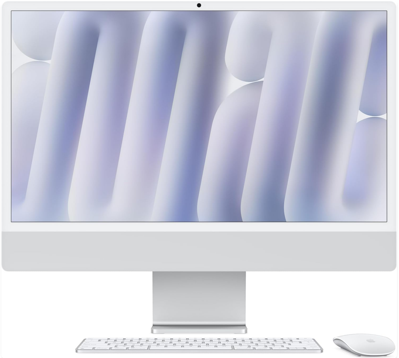
Image: A silver Apple 2024 iMac, showing the display, stand, and the included Magic Keyboard and Magic Mouse.

5. Positioning: Adjust the display angle for comfortable viewing. Ensure adequate ventilation around the iMac.