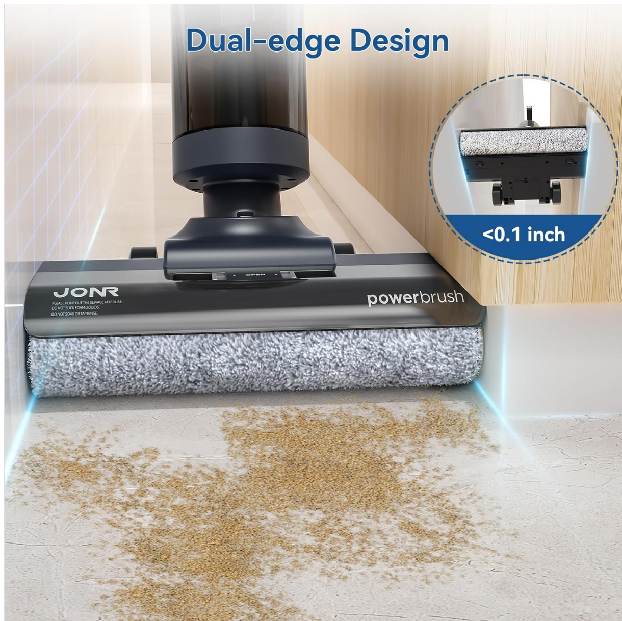
Figure 2: Dual-edge design in action. The image shows the JONR ED12 Pro vacuum mop with the roller brush cleaning dirt near a wall, highlighting its ability to reach edges with a clearance of less than 0.1 inch.