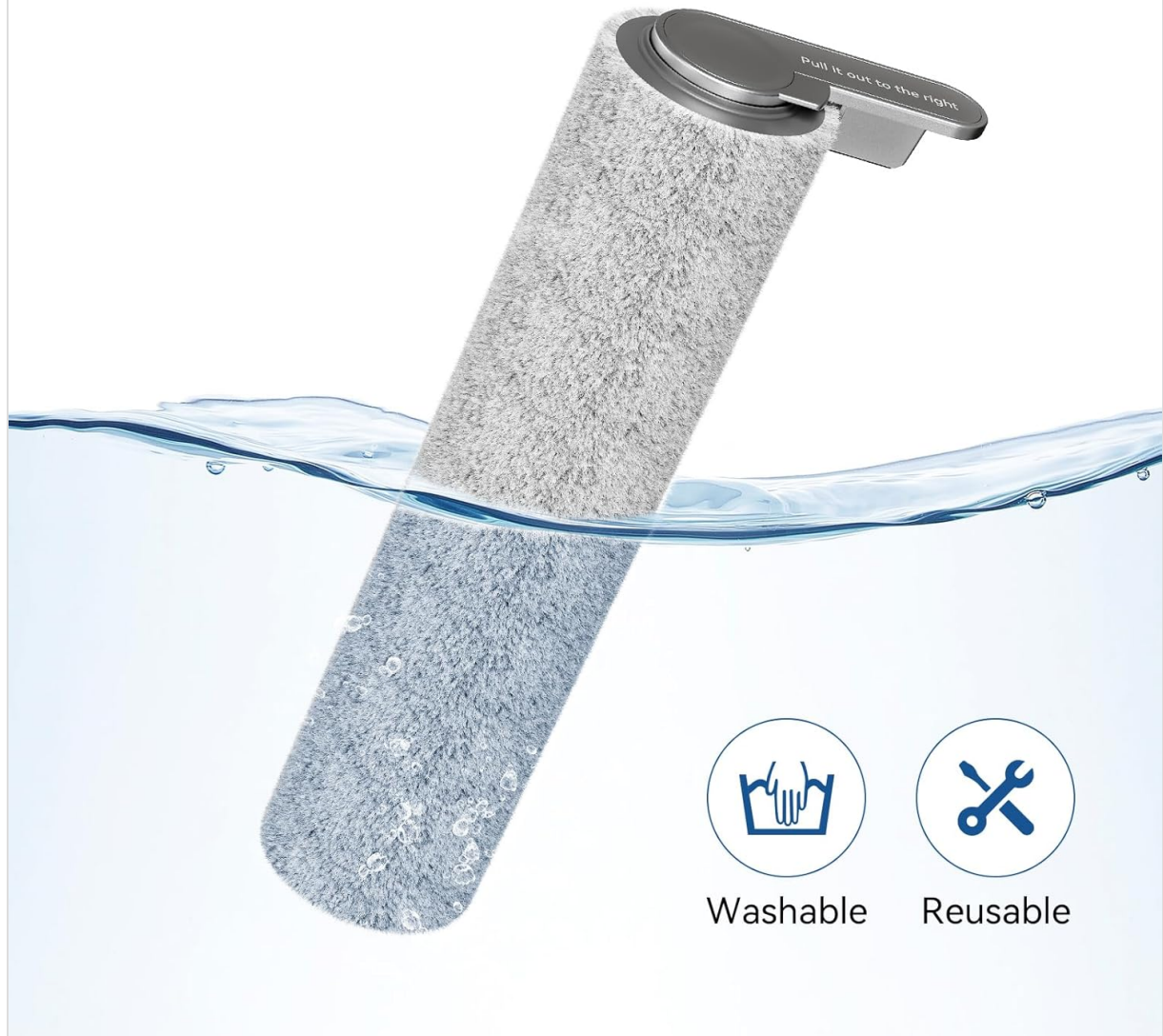
Figure 3: Maintenance guidelines. This image shows the roller brush partially submerged in water, with icons indicating "Washable" and "Reusable," and text recommending a "Replacement Cycle: 3-4 Months."