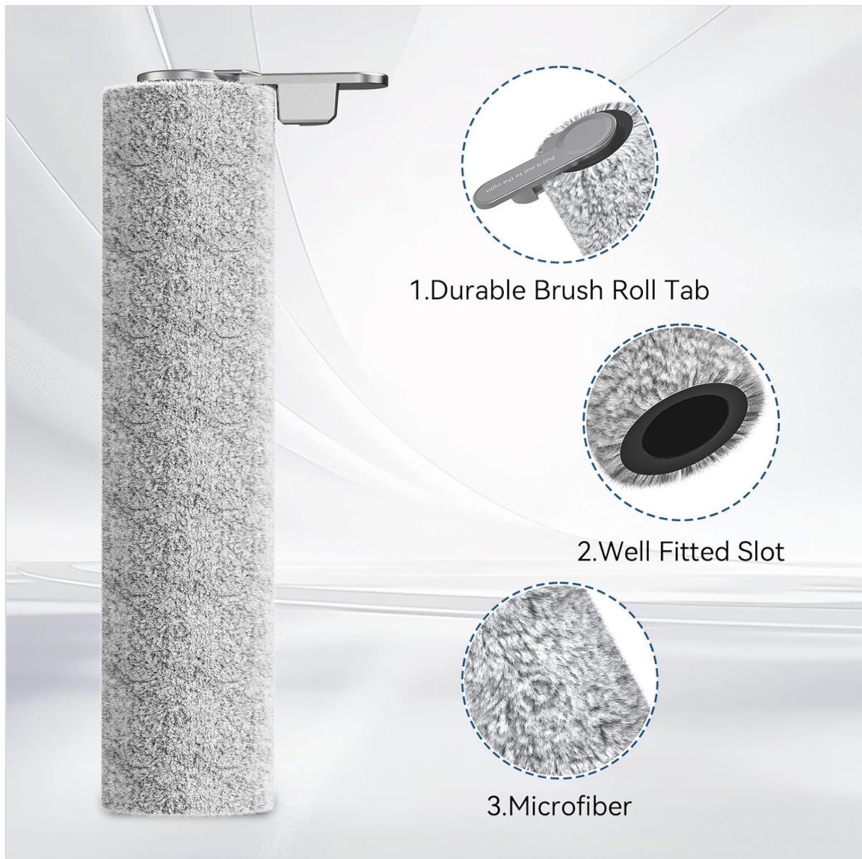
Figure 4: Brush construction details. The image highlights three key features: a durable brush roll tab, a well-fitted slot for secure installation, and the high-quality microfiber material of the brush.