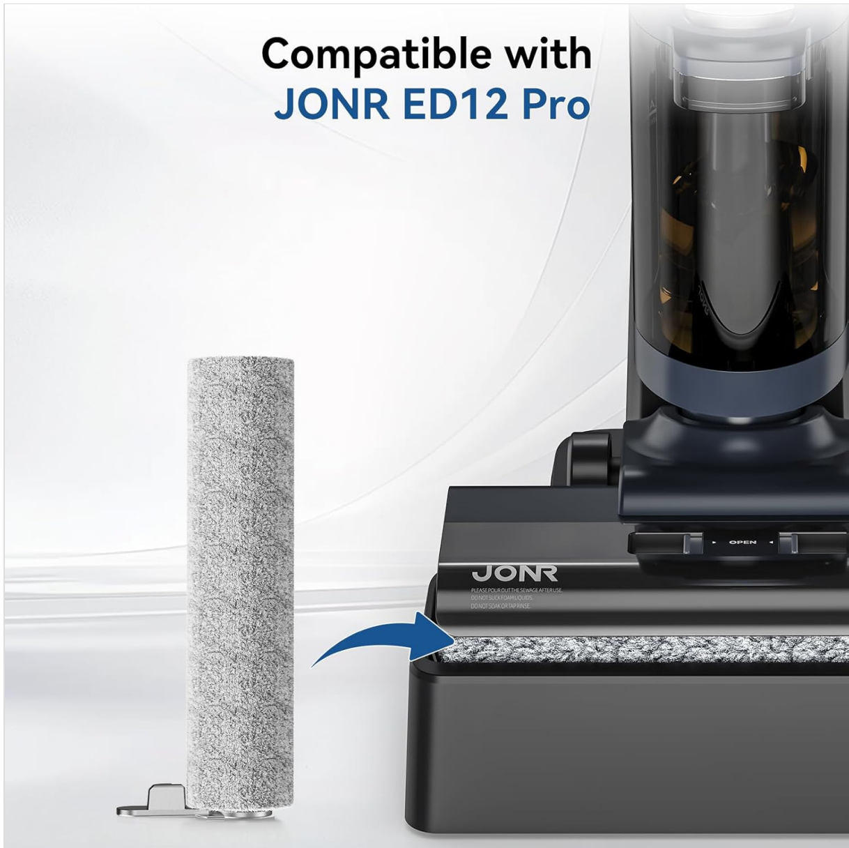
Figure 1: Installation of the JONR ED12 PRO Replacement Roller Brush. The image displays the roller brush being slid into the brush compartment of the JONR ED12 Pro vacuum mop, with an arrow indicating the direction of insertion.