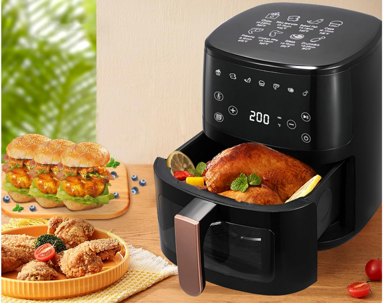
Figure 2: Illustration of the DiDimo Air Fryer's multi-functional capabilities.

Air Fry | Air Broil | Roast | Bake | Reheat | and Dehydrate