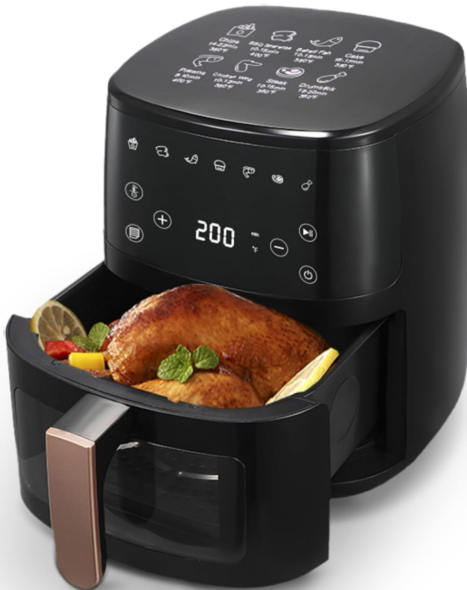
Figure 1: DiDimo Air Fryer with basket pulled out, showing a roasted chicken.