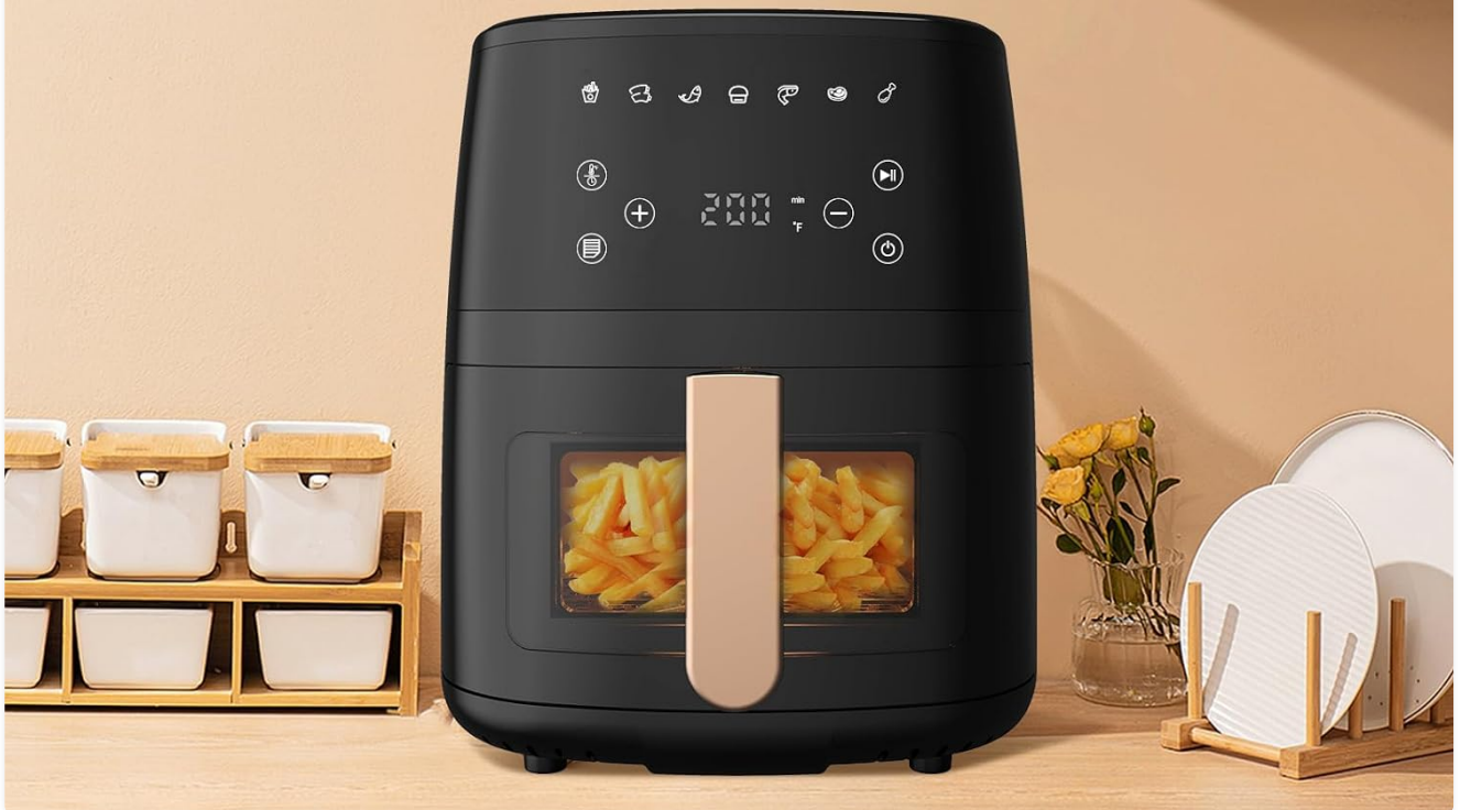
Figure 3: The compact design of the DiDimo Air Fryer, suitable for small spaces.