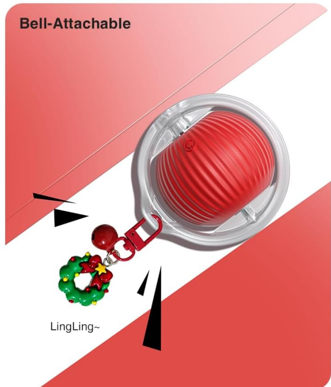
Image 3.1: Details on charging the device via USB-C, indicating 0.5 hours charge time for 1.5 hours playtime. Also highlights the durable silicone material and the attachable bell feature.