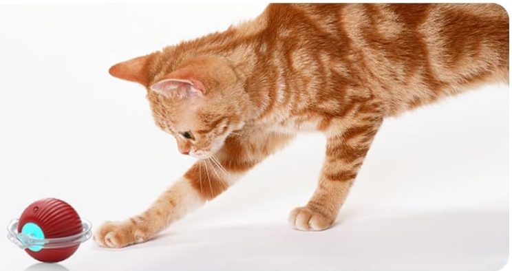
Image 4.1: Illustration of the three interaction modes: Fast Mode with blue light for active cats, Slow Mode with purple light for timid cats, and Interactive Mode with yellow light for curious cats.