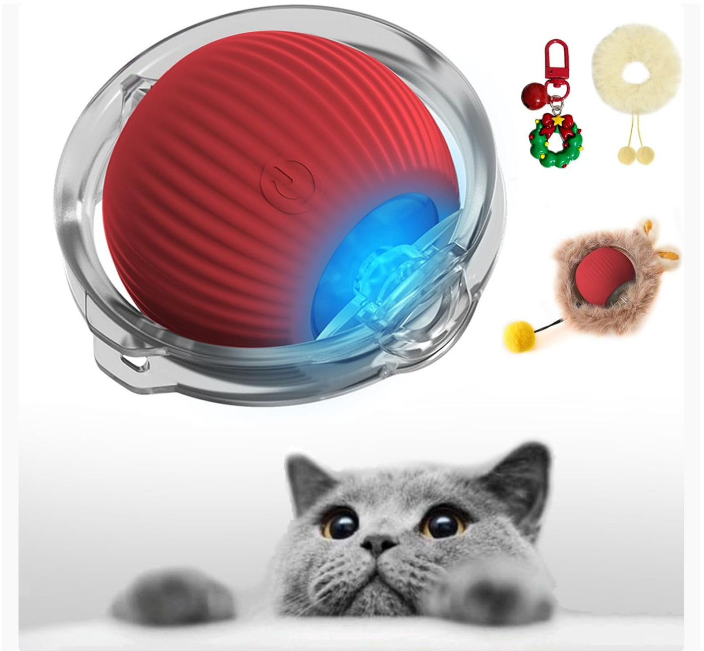
Image 1.1: The Pawlytek Smart Interactive Cat Toy Ball, featuring its red color and transparent outer shell, with a curious cat observing it.