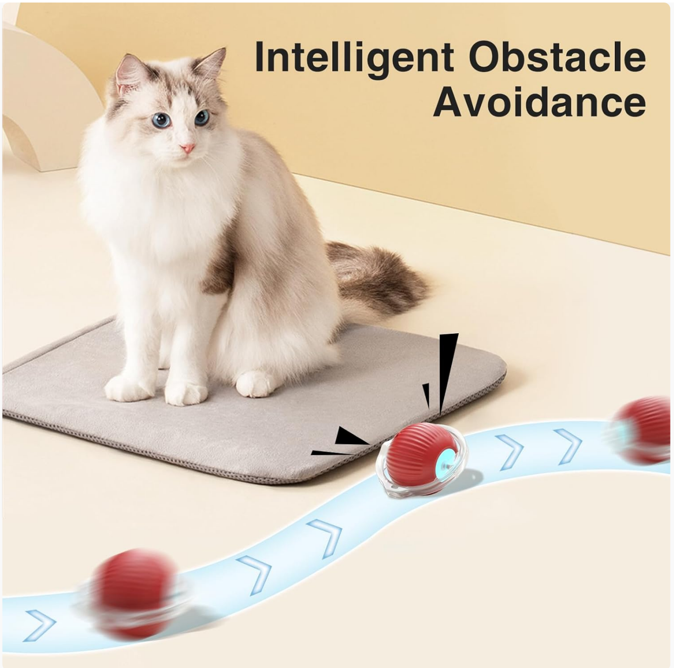
Image 4.2: A cat observes the toy ball as it demonstrates its intelligent obstacle avoidance capabilities, moving around objects on the floor.