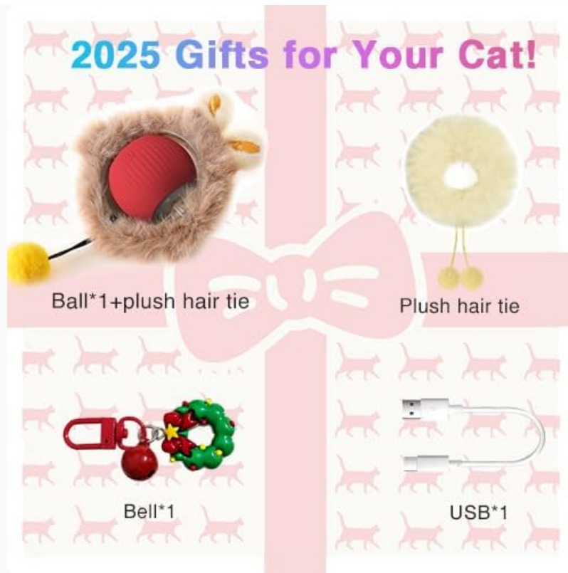
Image 2.1: Visual representation of the items included in the package: the main toy ball, a USB cable, a bell accessory, and two plush hair ties.