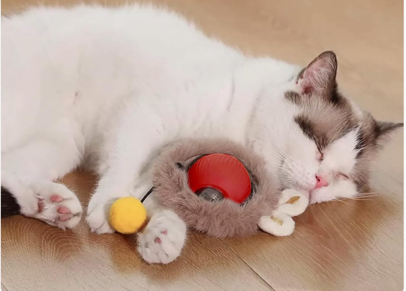
Image 4.3: A cat resting near the toy ball, symbolizing the 'Play Rest Balance' feature where the toy pauses after 5 minutes and reactivates with touch.

Each mode will enter rest mode after running for 5 minutes and will reactivate upon touch