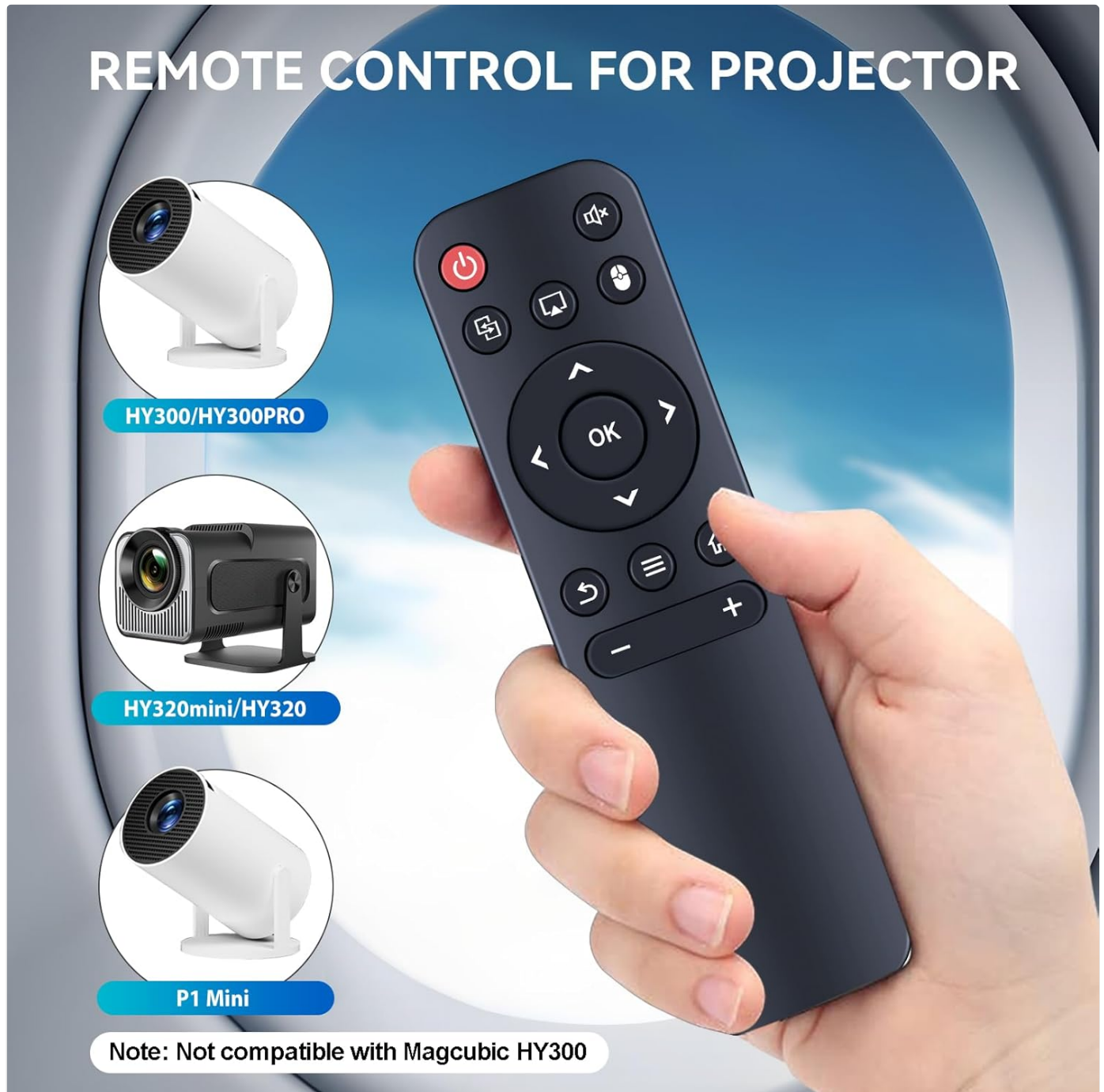
Image: The remote control displayed alongside images of compatible projectors, including HY300/HY300Pro, HY320mini/HY320, and P1 Mini, with a clear note about Magcubic HY300 incompatibility.

Important Note: This remote control is not compatible with the Magcubic HY300 projector or other brands of mini projectors not listed above. Please verify your projector model before use.