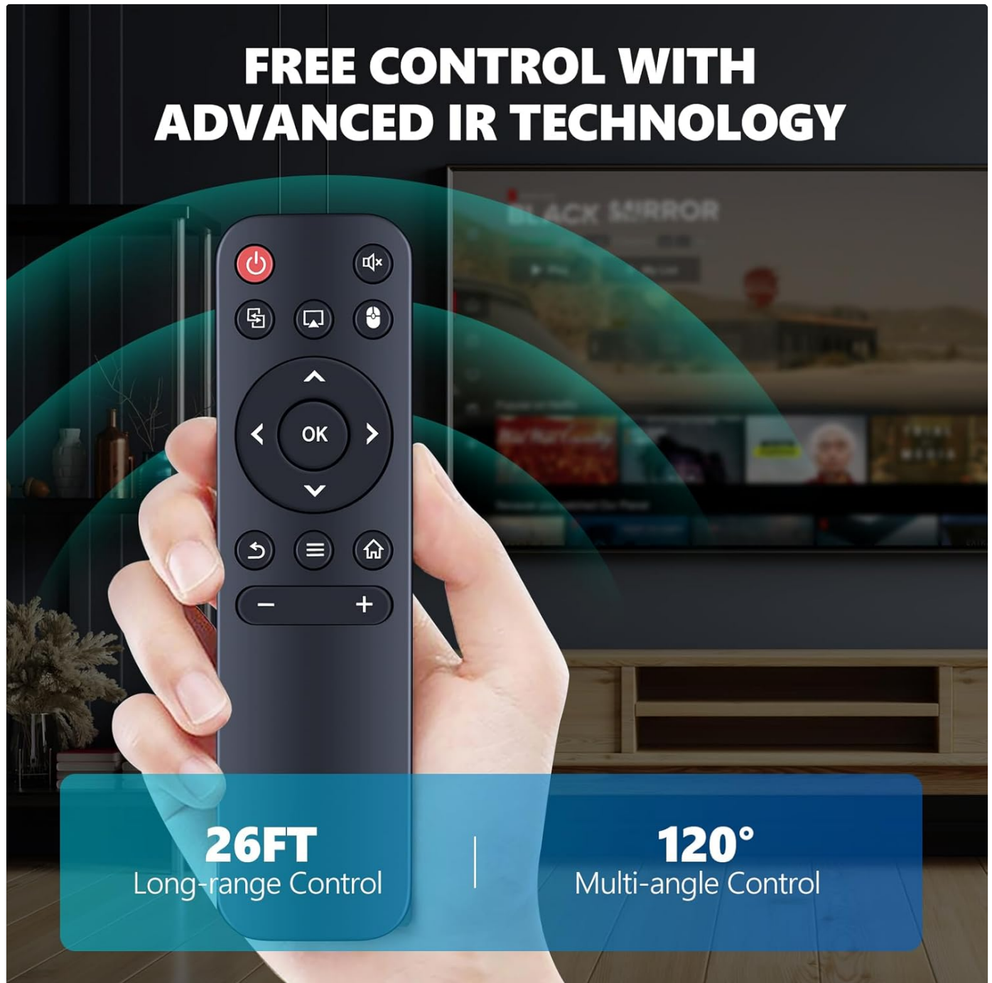
Image: The remote control emitting signal waves, illustrating its 26-foot long-range and 120-degree multi-angle control capabilities.