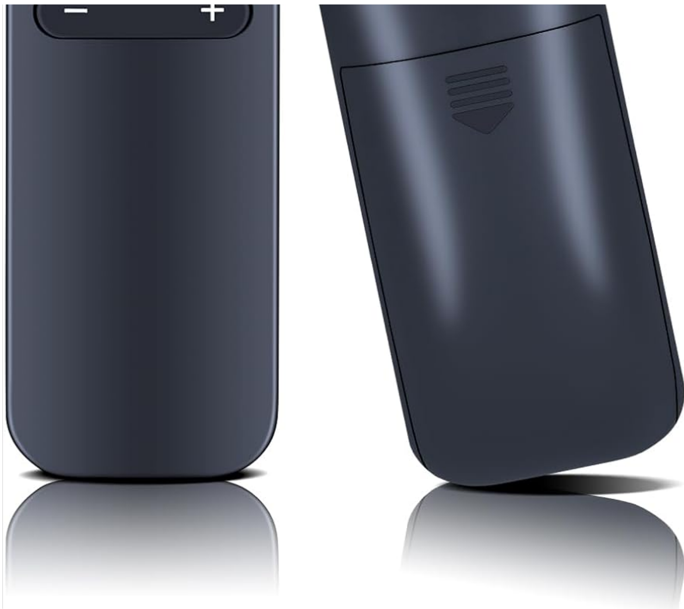
Image: Front and back view of the PZL Replacement Remote Control. The remote is black with clearly labeled buttons on the front and a smooth, ergonomic design on the back.