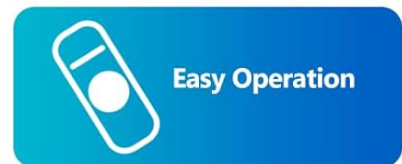
Image: The remote control with text indicating 'No Setup or Pairing Required' and icons for 'Upgraded Chip', 'No Programming Required', and 'Easy Operation'.