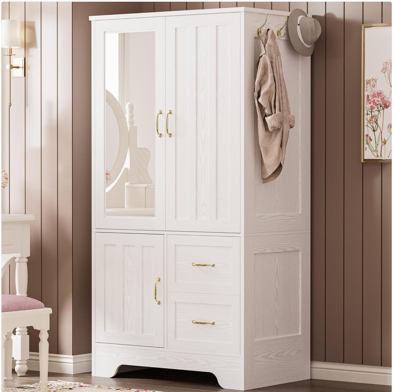
Figure 1.1: Front view of the LIKIMIO Wardrobe Closet, showcasing its white finish, mirror, doors, and drawers.