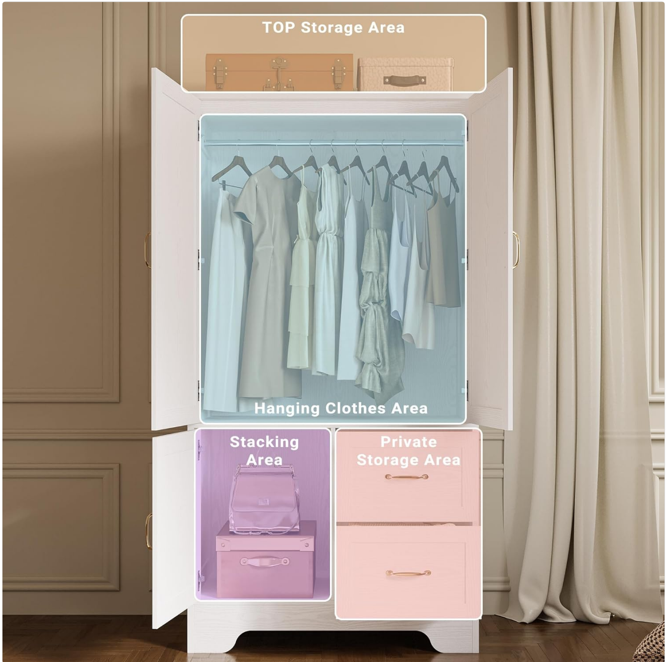
Figure 4.1: Internal view of the wardrobe showing designated areas for hanging clothes, stacking items, and private storage in drawers.

The wardrobe features a dedicated hanging area with a sturdy rod for dresses, coats, and other hanging garments. Below, you'll find a stacking area for folded clothes or storage boxes, and two private storage drawers for smaller items or personal belongings.