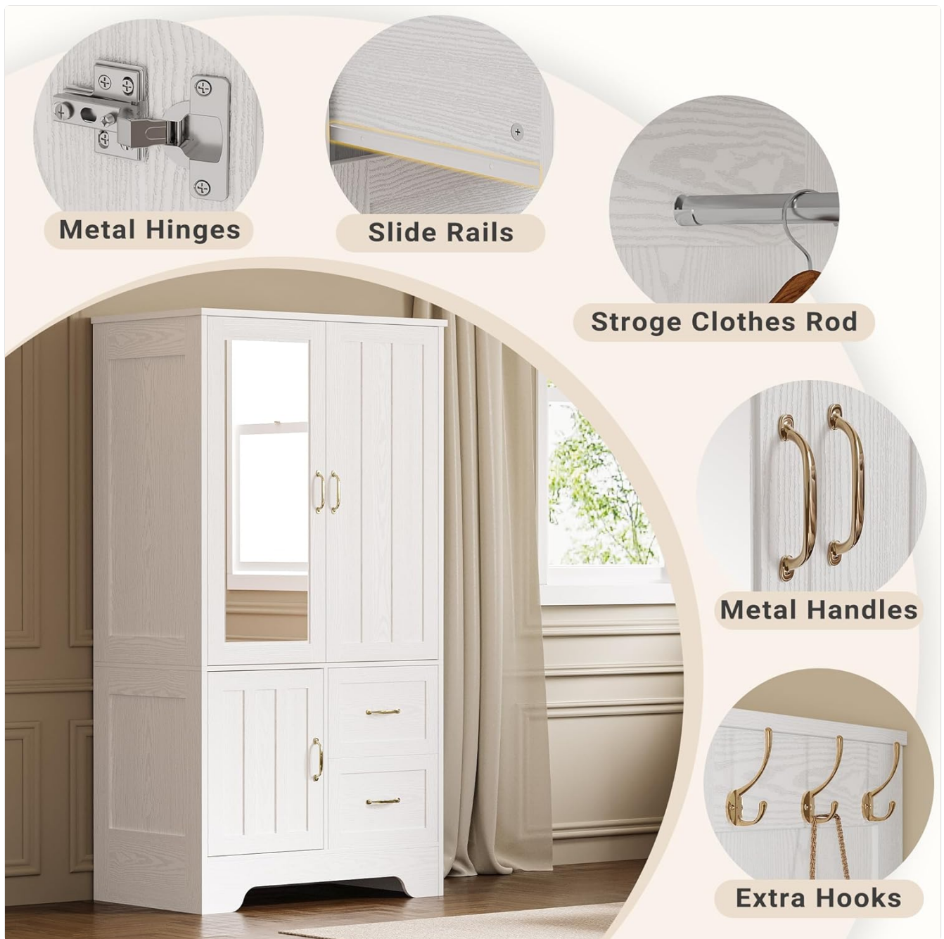
Figure 3.2: Close-up views of key components including metal hinges, slide rails for drawers, the strong clothes rod, metal handles, and extra side hooks.

Tools Required: A screwdriver (not included) is typically needed for assembly.