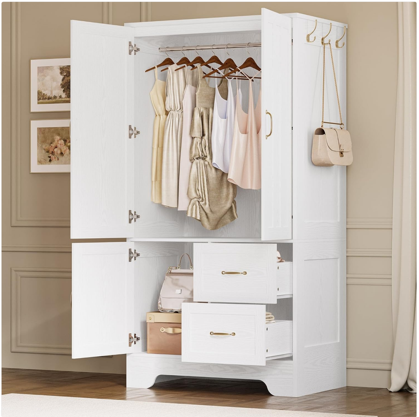
Figure 4.2: The wardrobe with its doors and drawers open, displaying ample space for hanging garments, folded items, and accessories.