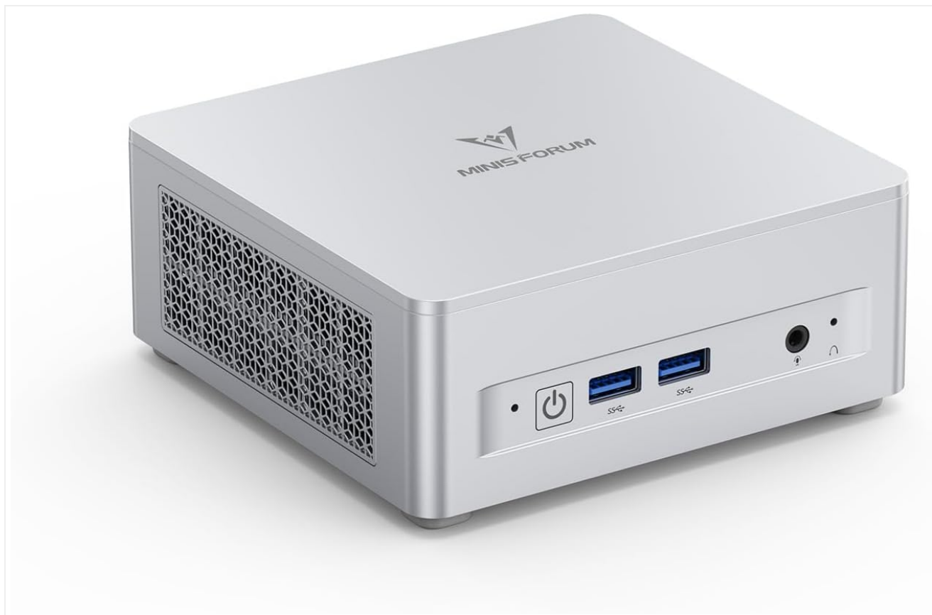
Figure 1: Front view of the MINISFORUM DeskMini UM870 Slim Mini PC.

This manual provides essential information for setting up, operating, and maintaining your MINISFORUM DeskMini UM870 Slim Mini PC. Please read this guide thoroughly before using the product to ensure proper functionality and longevity.