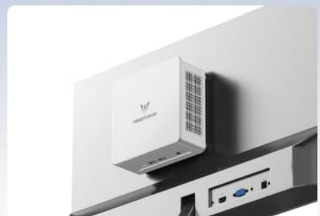
Figure 4: Front and rear port layout of the Mini PC.