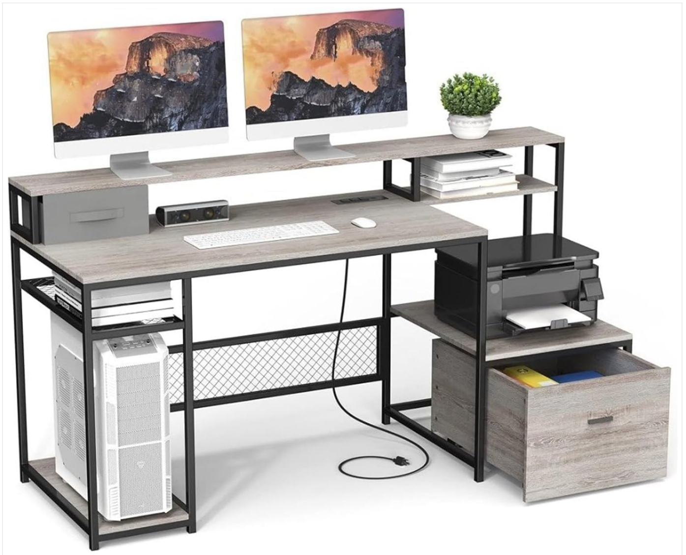
Figure 1.1: Fully assembled 66-inch computer desk.