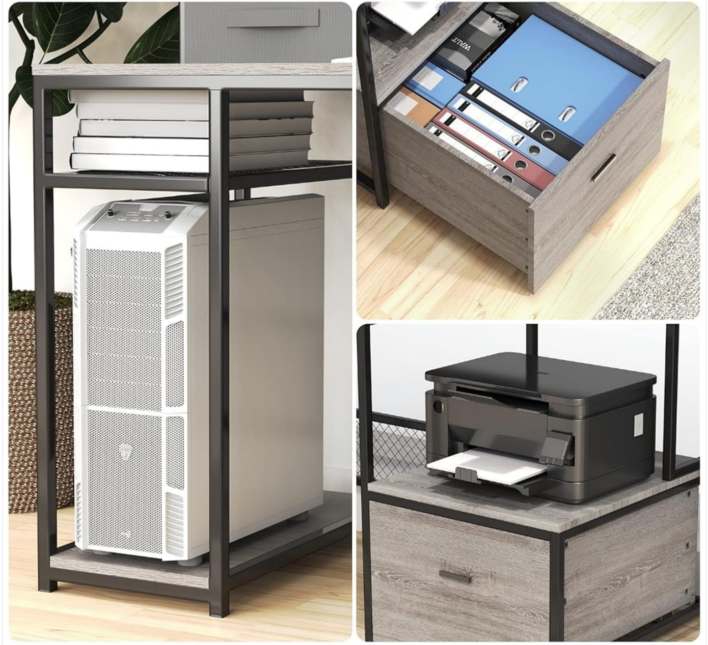
Figure 5.1: Features: Recessed power strip and ample storage.