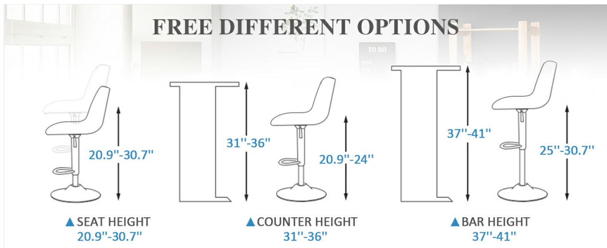
Image: Visual guide to seat height, counter height, and bar height options for versatile use.