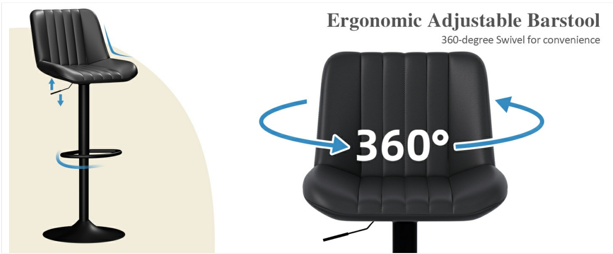
Image: Diagram showing the ergonomic adjustable barstool with its 360-degree swivel for convenience.