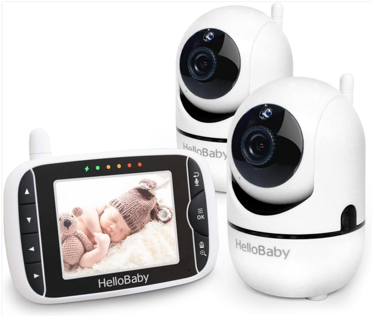
Image: The HelloBaby HB65-2 Baby Monitor system, showing the parent unit (monitor) and two camera units.