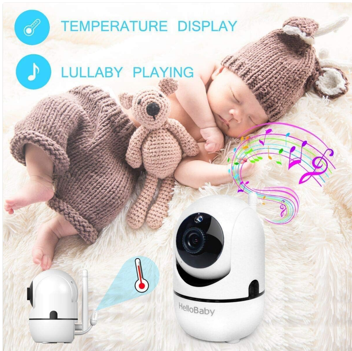
Image: The camera unit illustrating its temperature display and lullaby playing capabilities, with musical notes emanating from the camera.

The camera unit includes a temperature sensor that displays the room temperature on the parent unit, allowing you to ensure a comfortable environment for your baby.