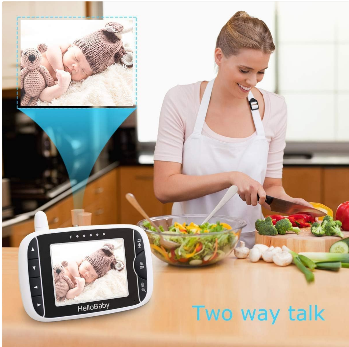
Image: A woman in a kitchen using the parent unit to engage in two-way talk with her baby, whose image is displayed on the monitor screen.