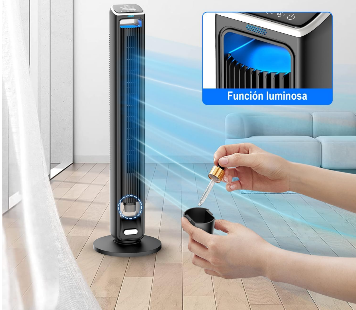
Image 5.4: A close-up of the Hivento Tower Fan's aroma box, showing a hand adding essential oil to the pad. The fan is shown in the background, circulating air.

Tenemos una caja especial de aromaterapia para que tu viento huela a aromaterapia