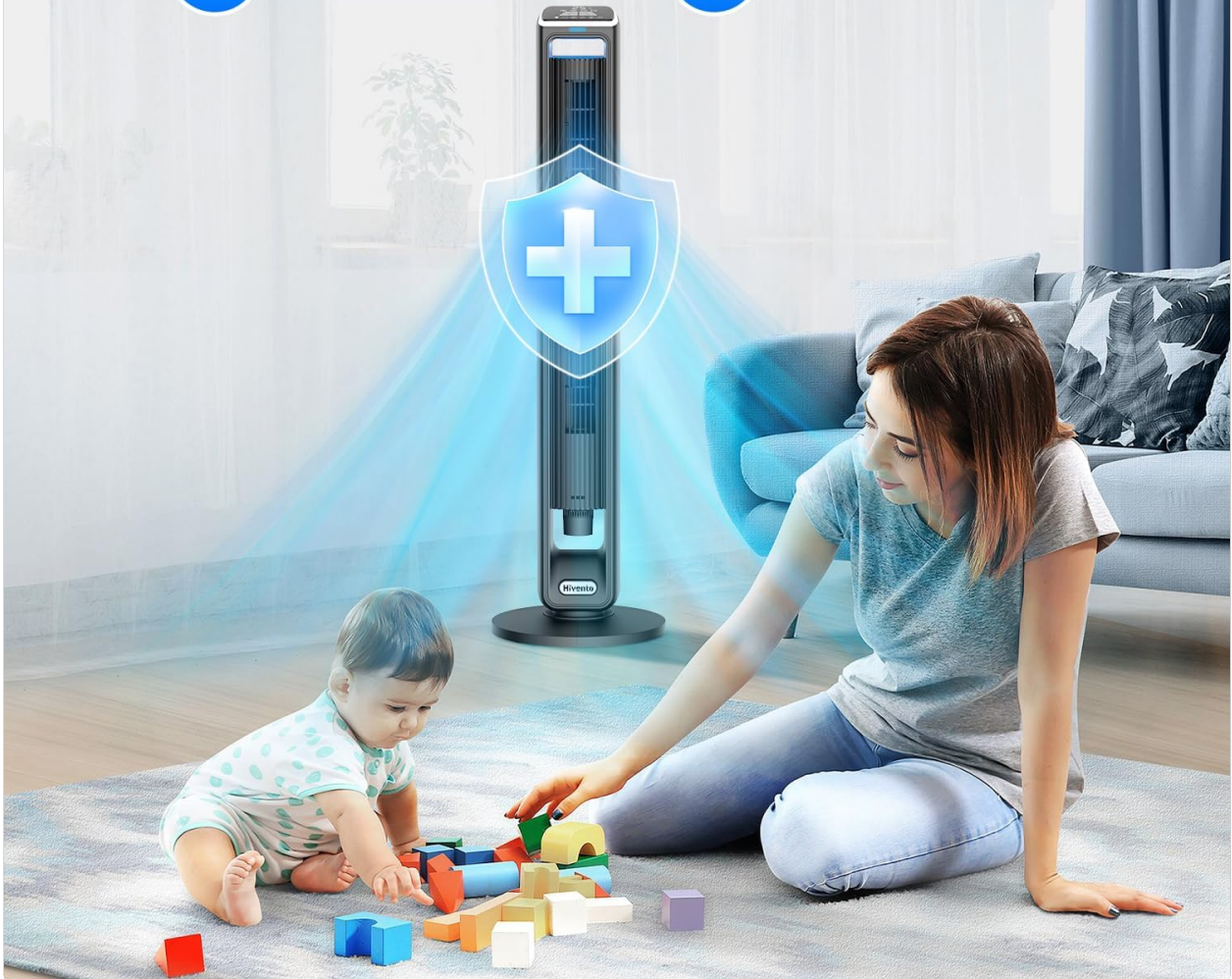
Image 5.5: An image highlighting the Hivento Tower Fan's safety features, including a child lock and safety plug, with a child playing near the fan.