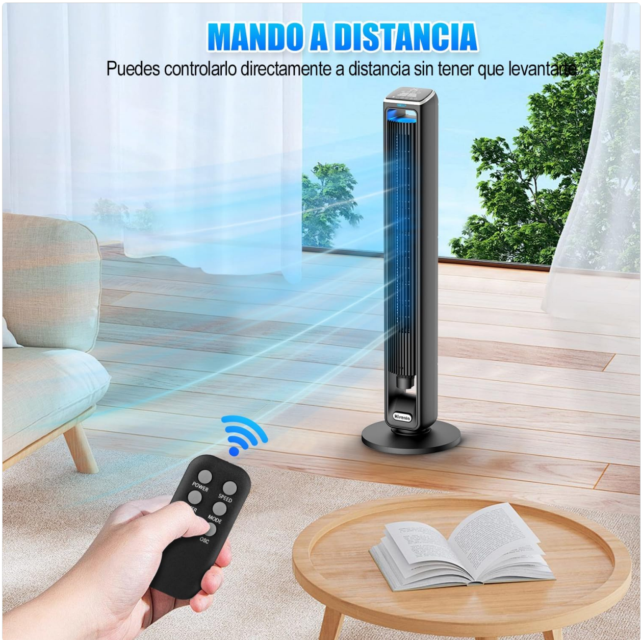
Image 5.1: A hand holding the remote control, pointing it towards the Hiventio Tower Fan. This illustrates the convenience of remote operation.

Puedes controlarlo directamente a distancia sin tener que levantarte.