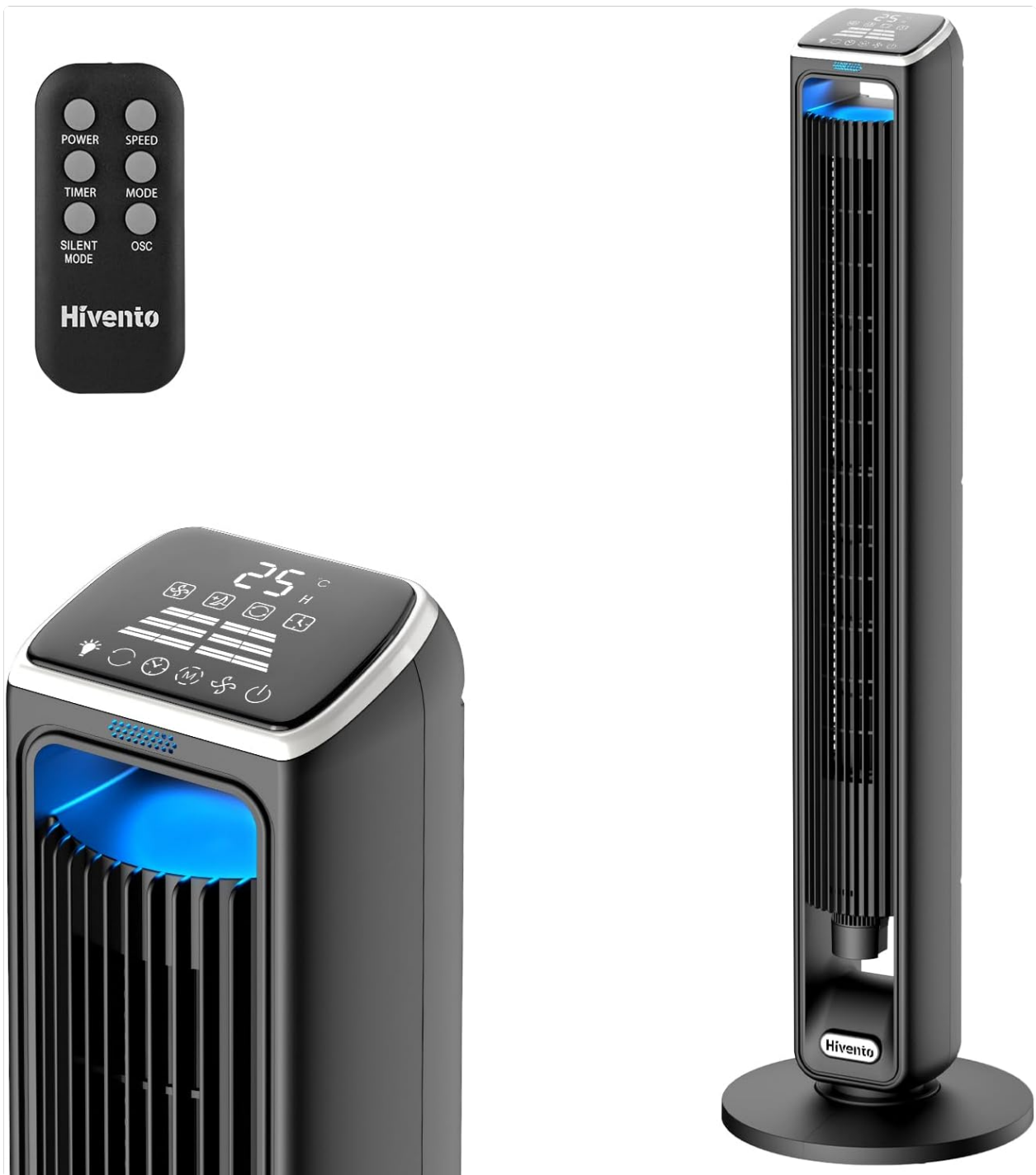
Image 1.1: Hivento Tower Fan and its remote control. The fan is a sleek, black tower design with a digital display on top, and the remote is compact with clearly labeled buttons.