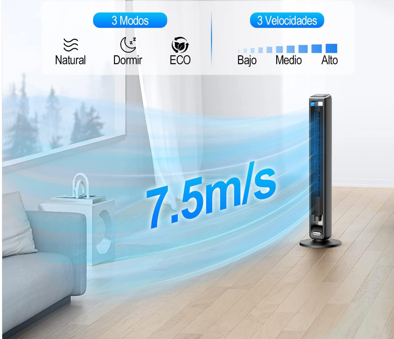
Image 5.2: Diagram illustrating the Hivento Tower Fan's 3 modes (Natural, Sleep, ECO) and 3 speeds (Low, Medium, High), with an arrow indicating a 7.5m/s airflow.

Más velocidades y modos para estar cómodo en cualquier situación