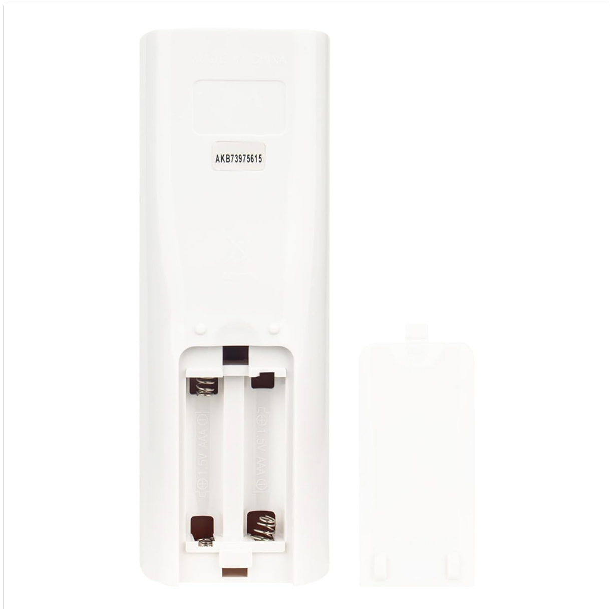
Image: Open battery compartment showing where to insert AAA batteries.