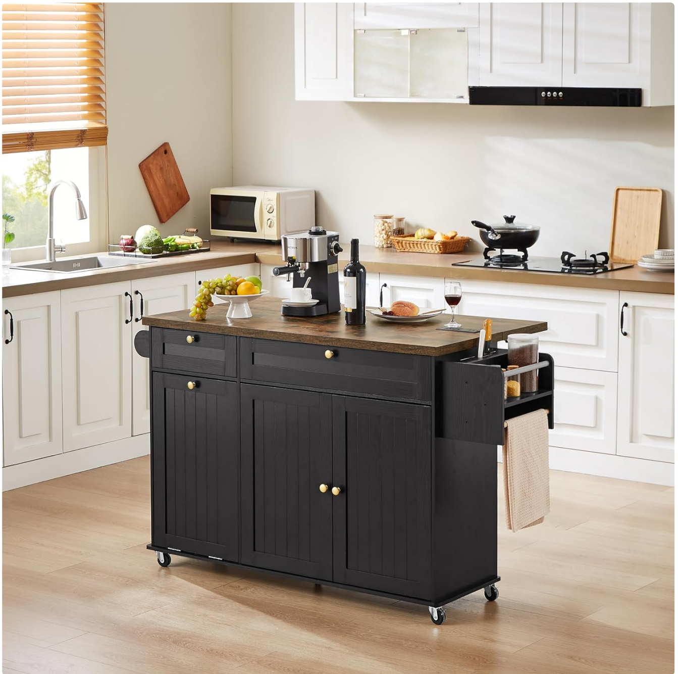
Image: The kitchen island positioned in a kitchen, demonstrating its compact and movable nature.