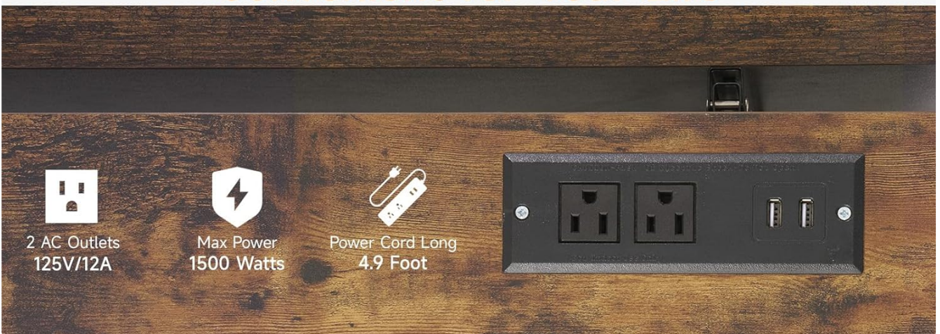
Image: Detail of the integrated power outlet and a diagram illustrating the mobility features.