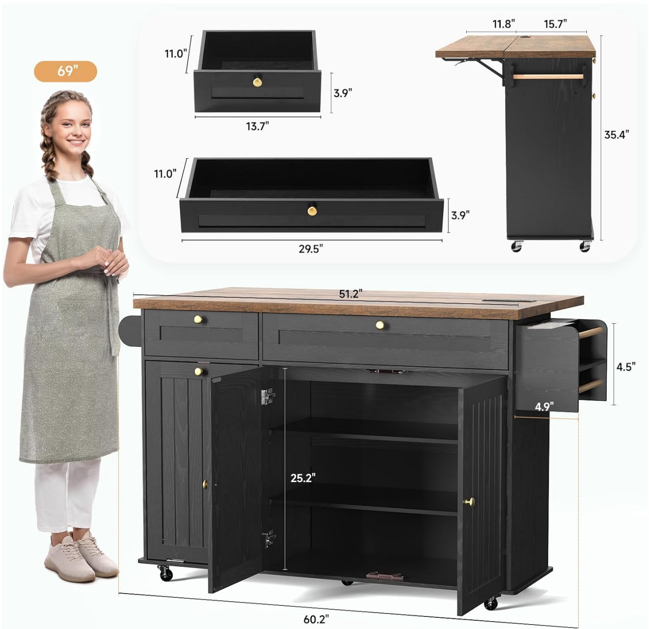
Image: View of the kitchen island with its storage compartments open, showcasing organized kitchen essentials.