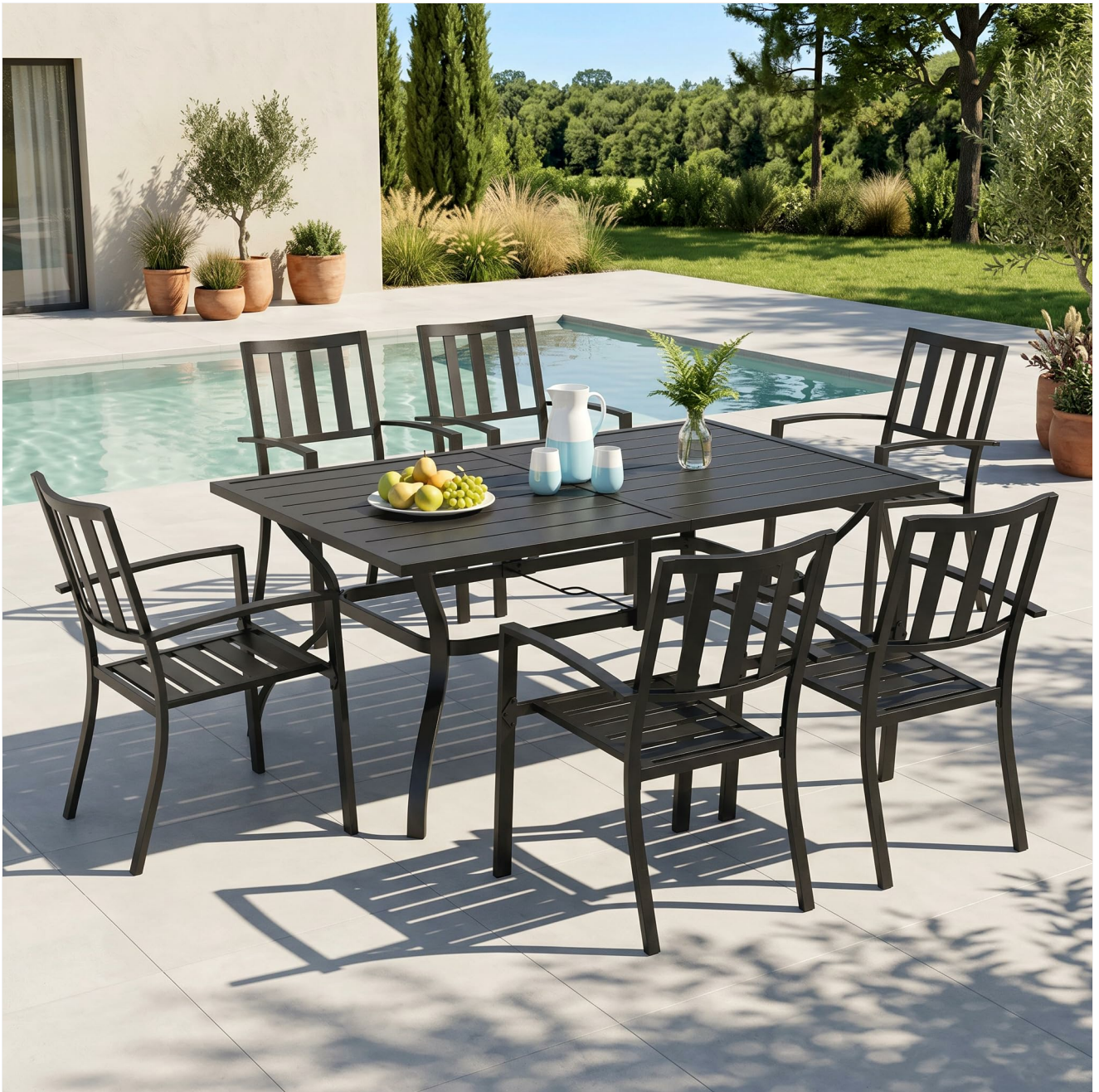
Image: The complete MFSTUDIO Outdoor Dining Set for 6, featuring a rectangular table and six chairs.