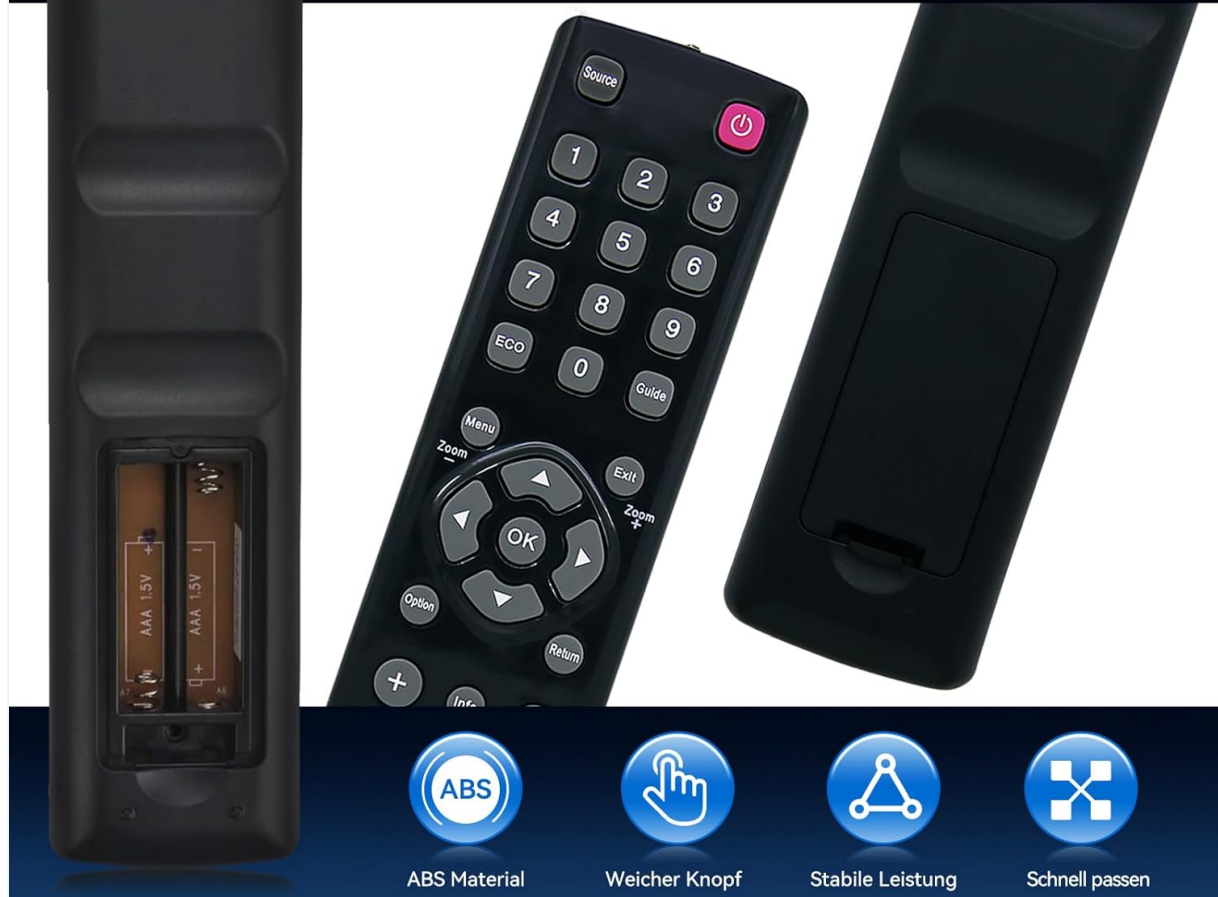
Image: The remote control with its battery compartment open, illustrating where to insert the two AAA batteries.

Perfekt ersetzen Sie Ihre ursprüngliche Fernbedienung nach einfach Einsatz von 2 AAA-Batterien (Nicht enthalten)