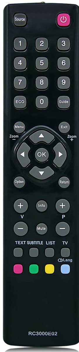
Image: A detailed view of the remote control's buttons, including power, number pad, navigation, volume, and channel controls.