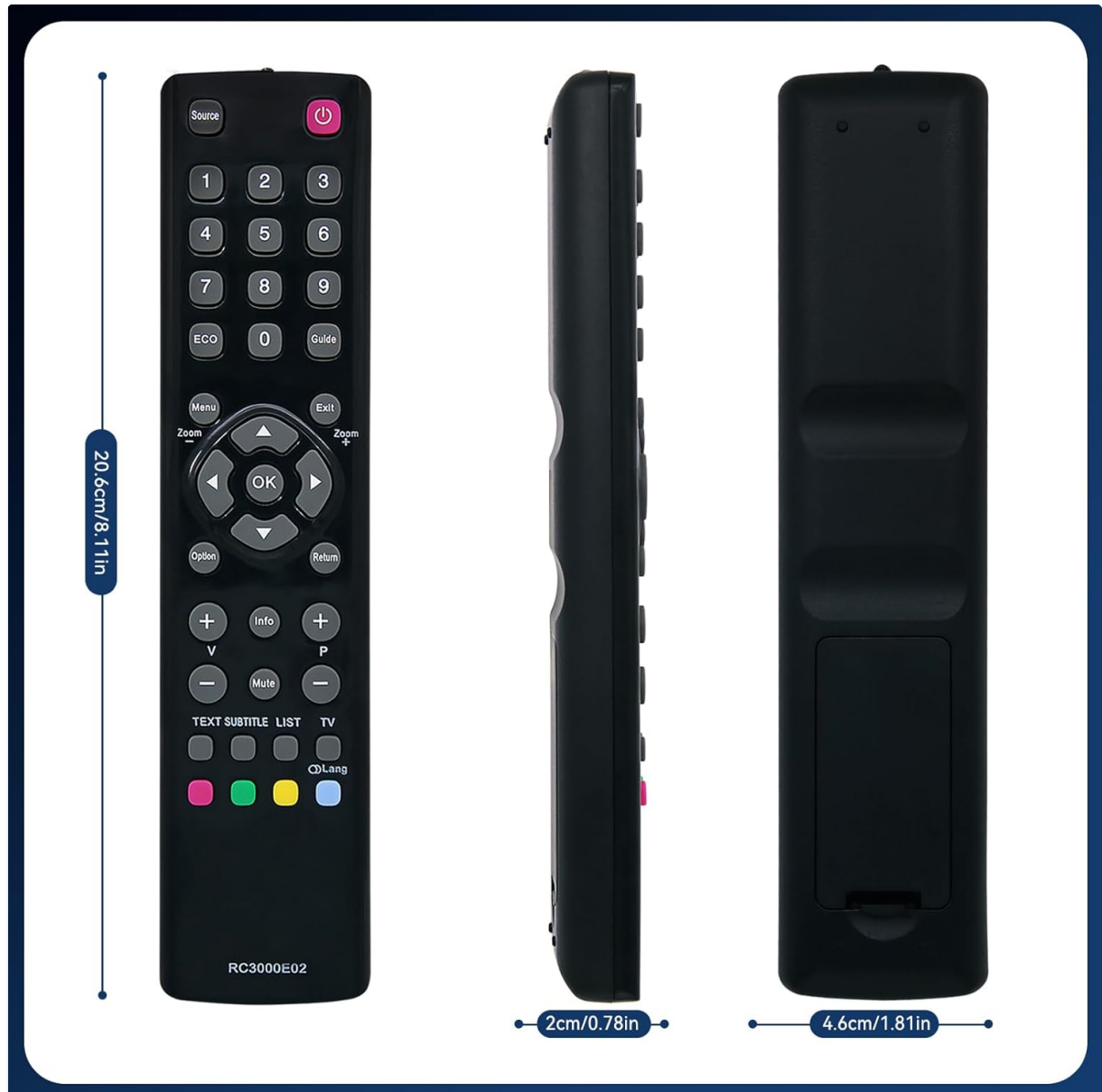
Image: The remote control shown with its approximate dimensions for reference.