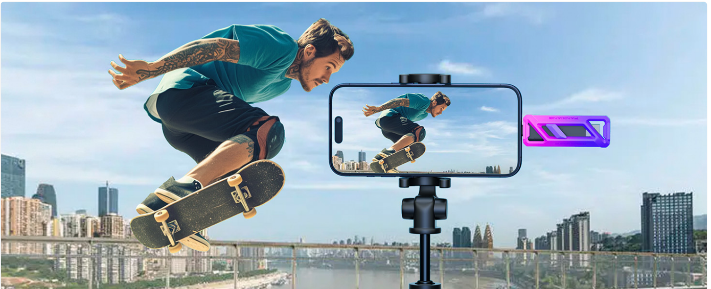
Figure 4: Direct 4K 60FPS ProRes video recording from iPhone 15 Pro/Pro Max to the FF958 Flash Drive.

The FF958 is specifically designed to be compatible with iPhone 15 Pro and iPhone 15 Pro Max models, allowing direct external recording of 4K 60FPS ProRes video. Connect the USB-C port of the flash drive to your iPhone to utilize this feature.