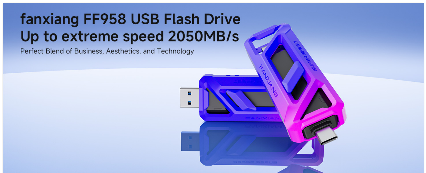
Figure 1: fanxiang FF958 Flash Drive in use with various devices, highlighting its speed capabilities.

The fanxiang FF958 is a high-performance 2TB flash drive designed for rapid data transfer and versatile compatibility. Featuring both USB-A and USB-C interfaces, it offers a convenient solution for expanding storage and transferring files across a wide range of devices, including smartphones, tablets, laptops, and desktop computers. Its robust zinc alloy construction ensures durability and efficient heat dissipation, maintaining stable performance during intensive use.