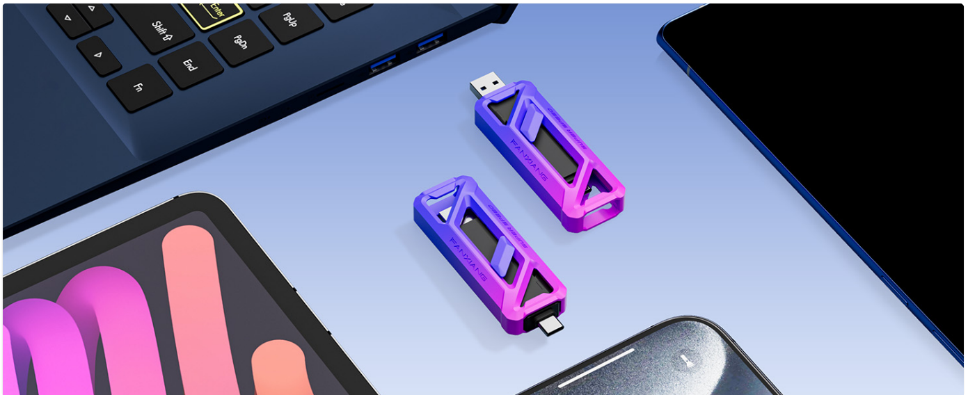
Figure 2: The FF958 Flash Drive with its dual USB-A and USB-C connectors, demonstrating connectivity with a laptop and tablet.