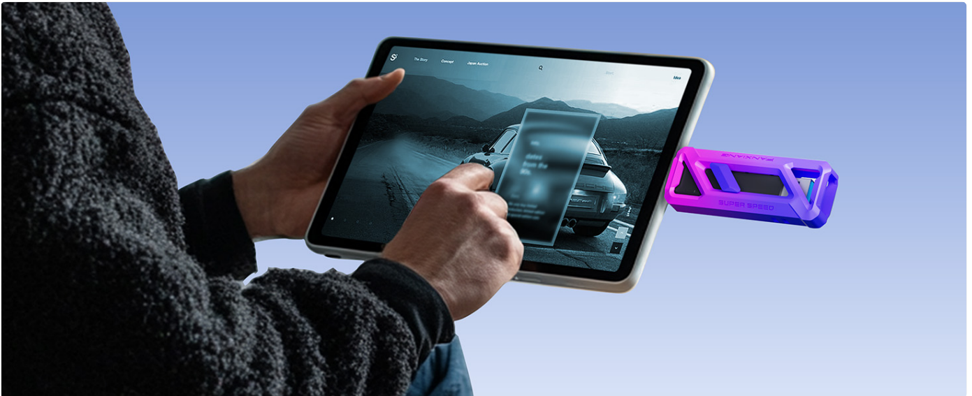
Figure 3: The FF958 Flash Drive supports high-speed data transfer for demanding tasks like 4K and 8K video editing.

utilizing a USB 3.2 Gen 2x2 Type-C port will provide the fastest transfer speeds.