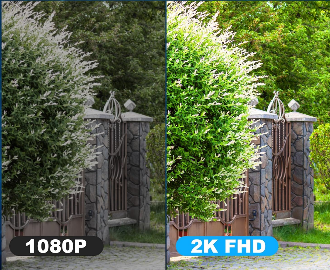
Image: A side-by-side comparison demonstrating the superior clarity of 2K FHD resolution versus 1080P for outdoor surveillance footage.