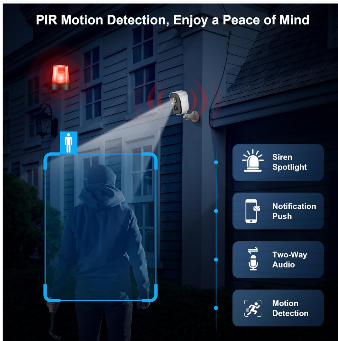
Image: Illustration of PIR Motion Detection in action, showing a detected person triggering a siren, spotlight, and a push notification to a mobile device.