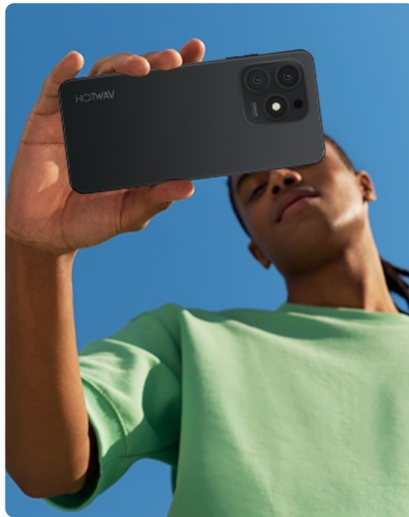
Figure 4: User interacting with the HOTWAV Note 13 Max. This image illustrates the phone's use for photography or video calls.