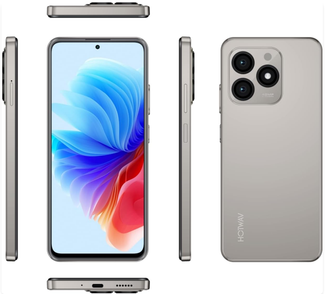
Figure 1: HOTWAV Note 13 Max Smartphone - Front, Back, and Side Views. This image displays the overall design of the smartphone, highlighting its sleek profile and camera module.