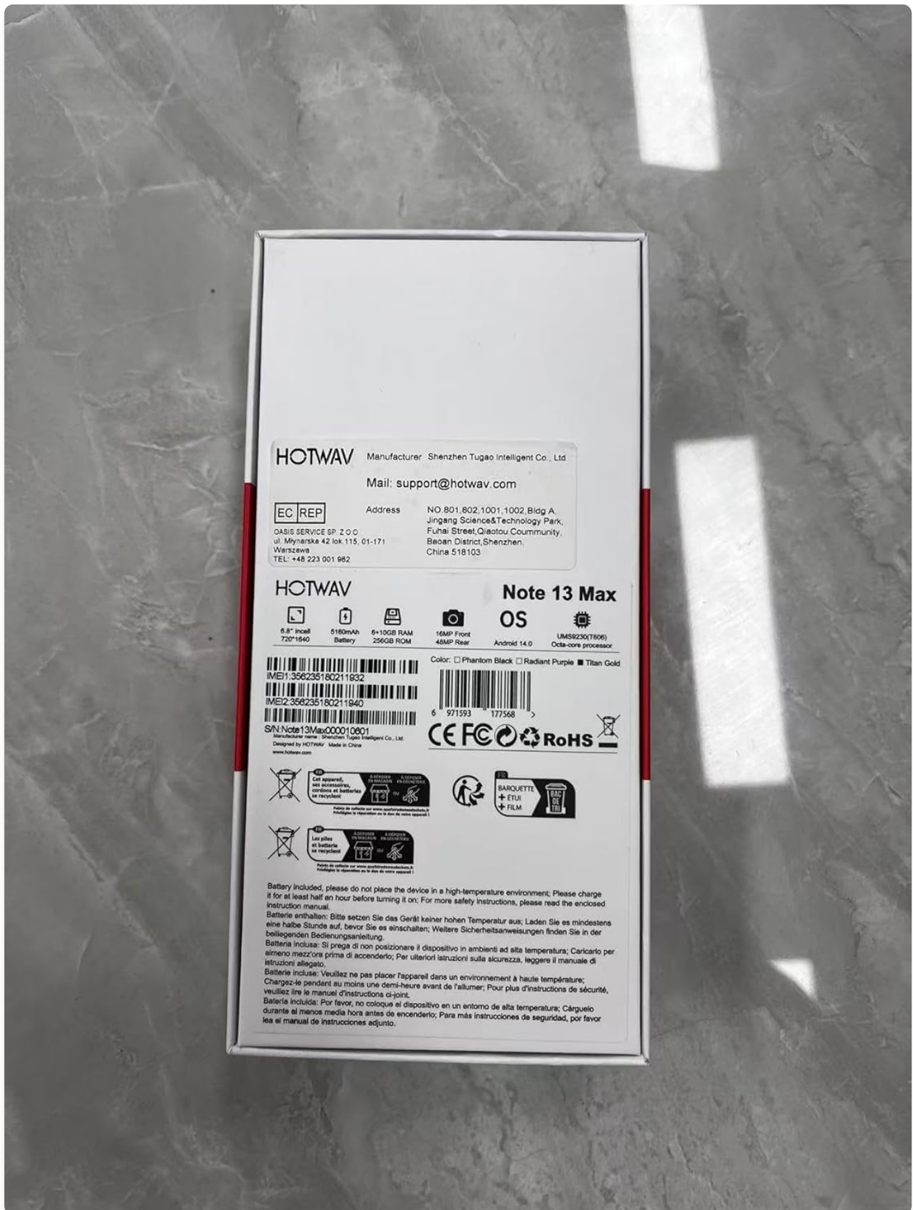
Figure 3: Back of the HOTWAV Note 13 Max retail packaging. This view shows detailed product information, including manufacturer details and key specifications.