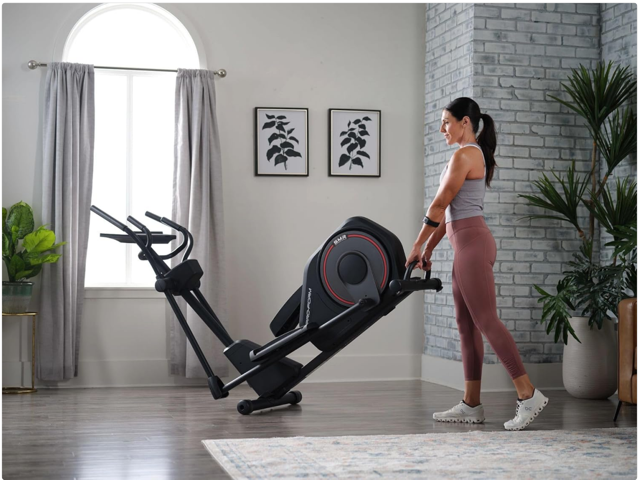
Image: A user tilting the elliptical to engage the front transport wheels, demonstrating how to easily move the machine for storage or repositioning.