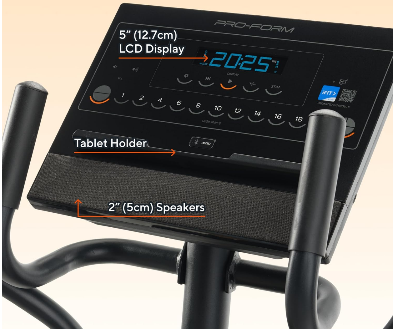
Image: The ProForm Sport Elliptical fully assembled, illustrating its compact design and key structural components. Dimensions are approximately 150 cm (length) x 65 cm (width) x 156 cm (height).