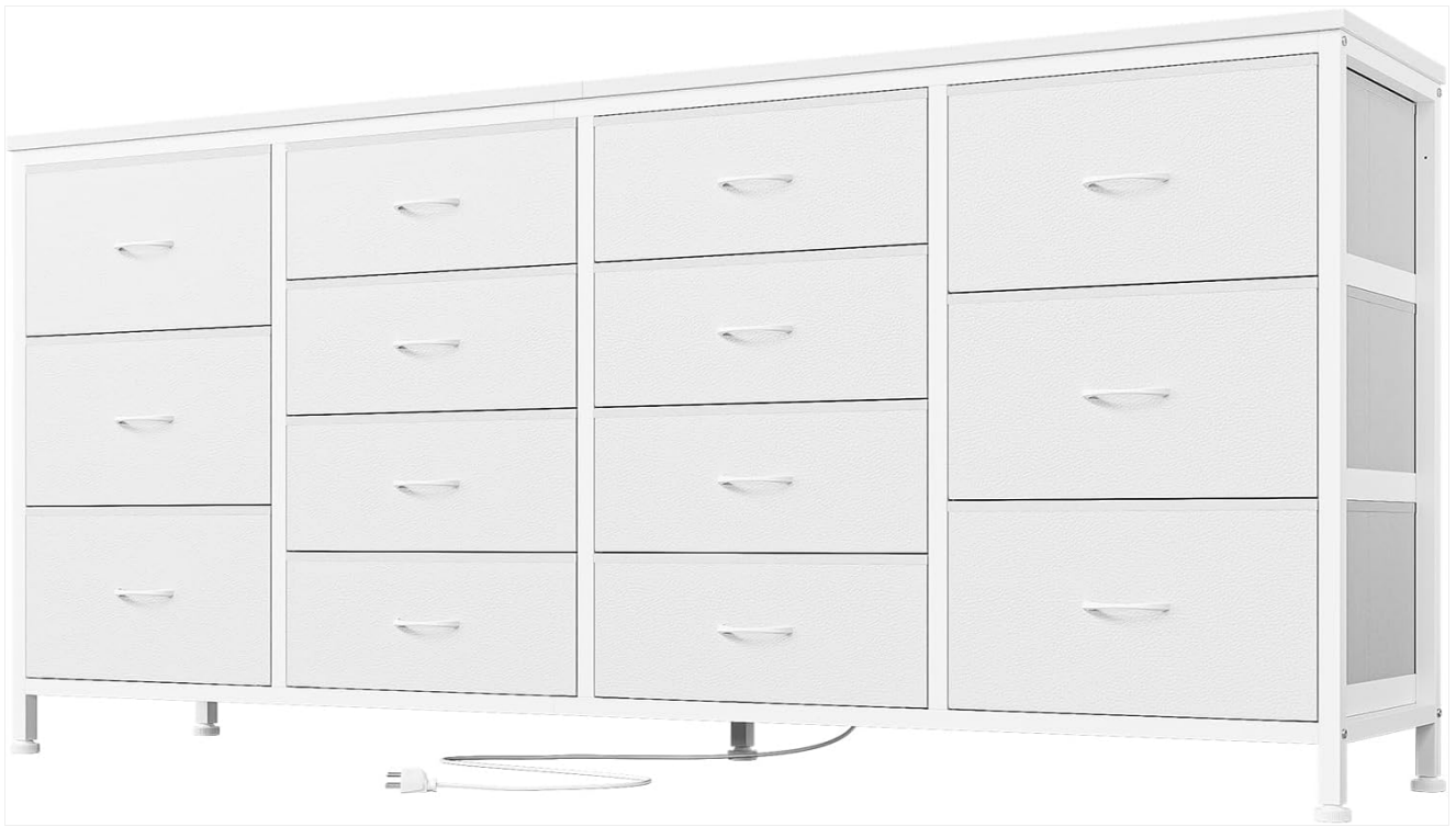
Another front view of the dresser, showing the integrated power cord.