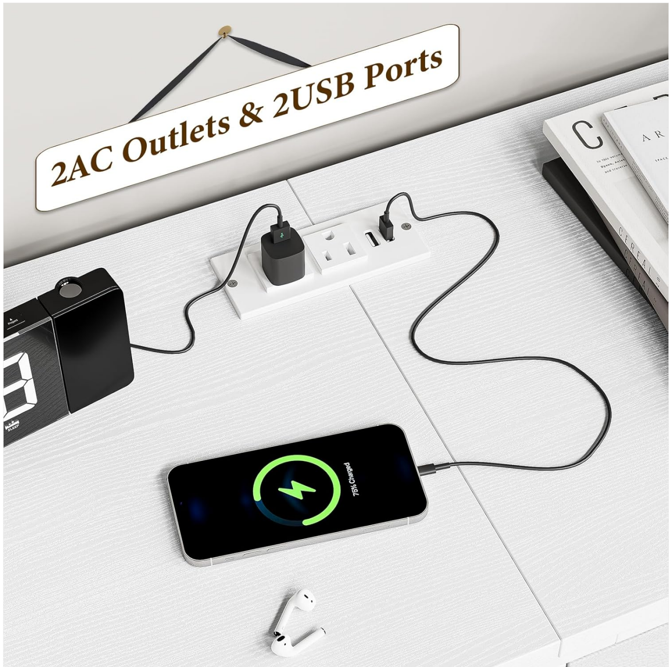
Integrated power outlets for convenient device charging and powering.