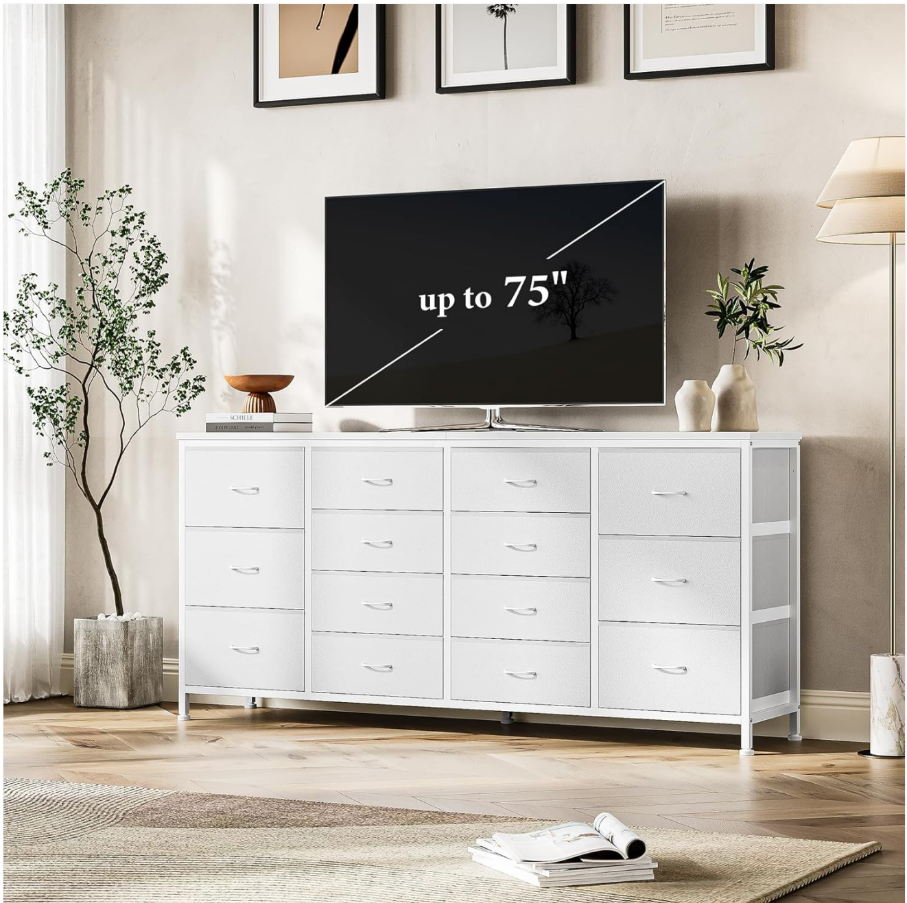
The dresser functions as a TV stand, accommodating TVs up to 75 inches.