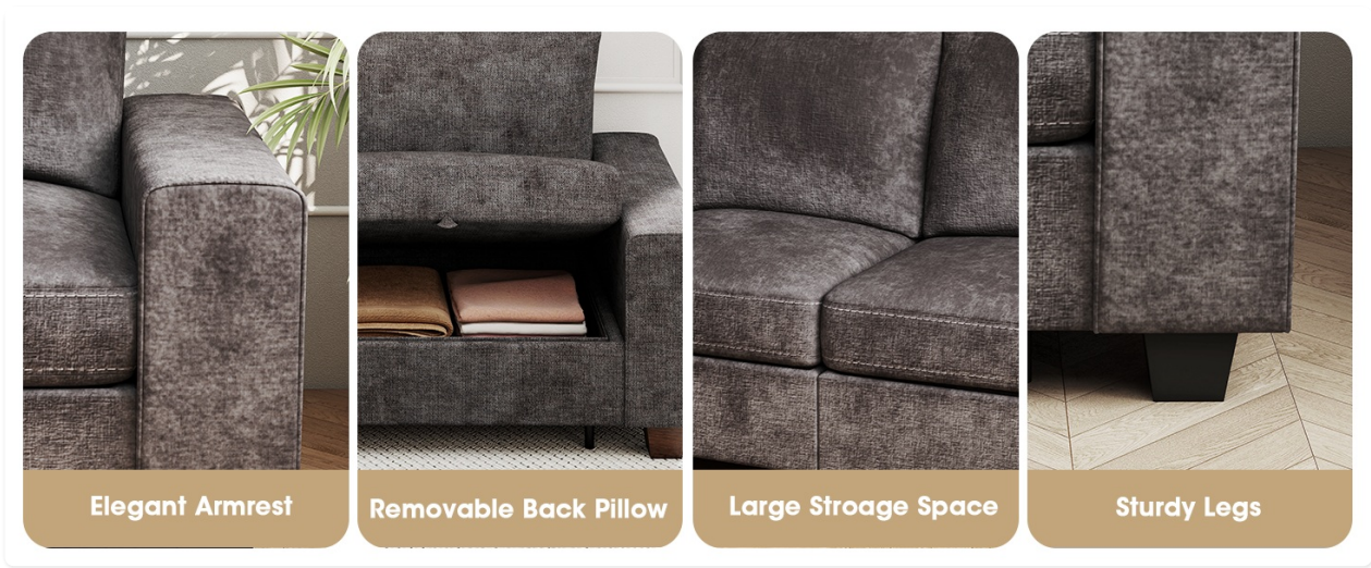
Figure 3: Close-up of sofa components and features.