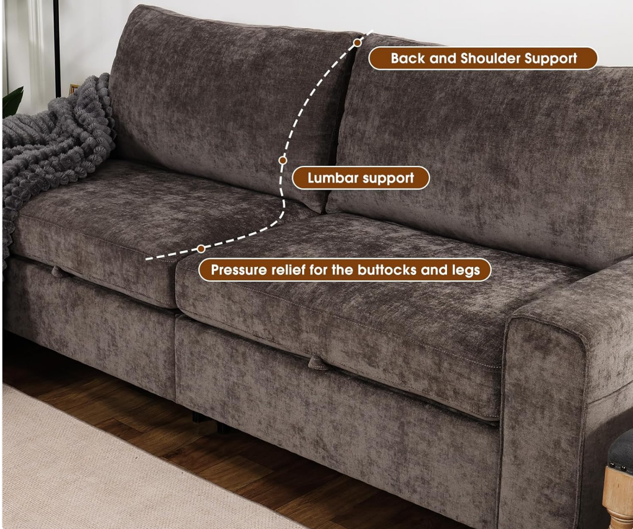
Figure 6: Ergonomic support provided by the sofa.