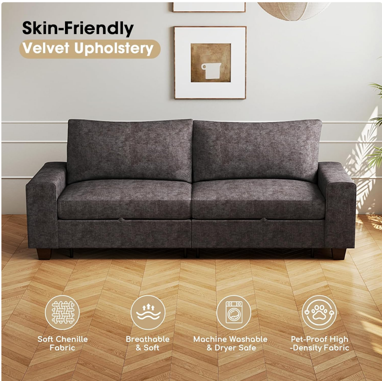
Figure 2: Key features of the sofa's chenille fabric.