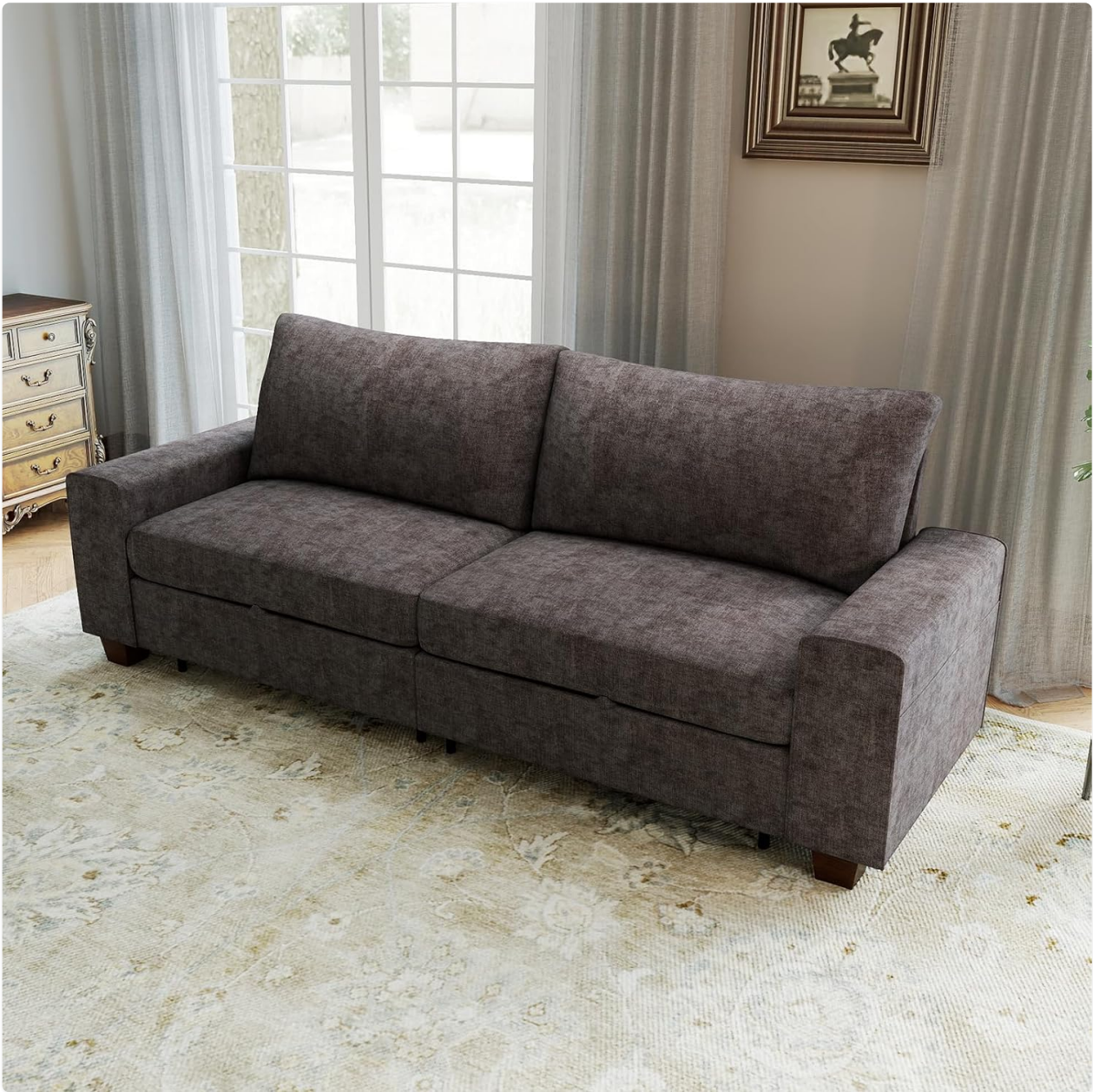
Figure 1: Couchus 88" Upholstered Sofa Couch.