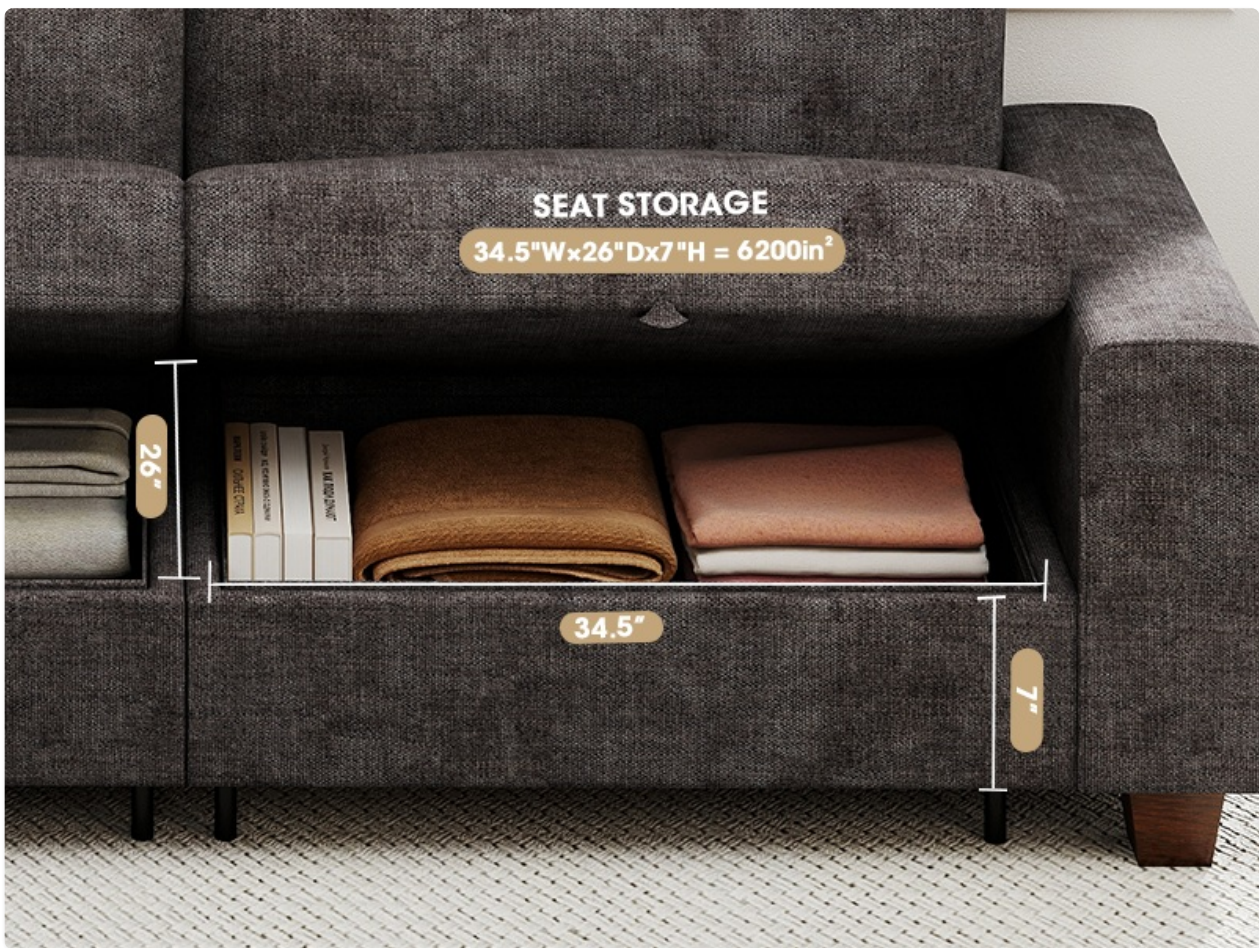
Figure 8: Detailed view of seat storage dimensions.

Video 5: L Shaped Couch with Storage by Couch-US. This video highlights the storage features of the sofa.