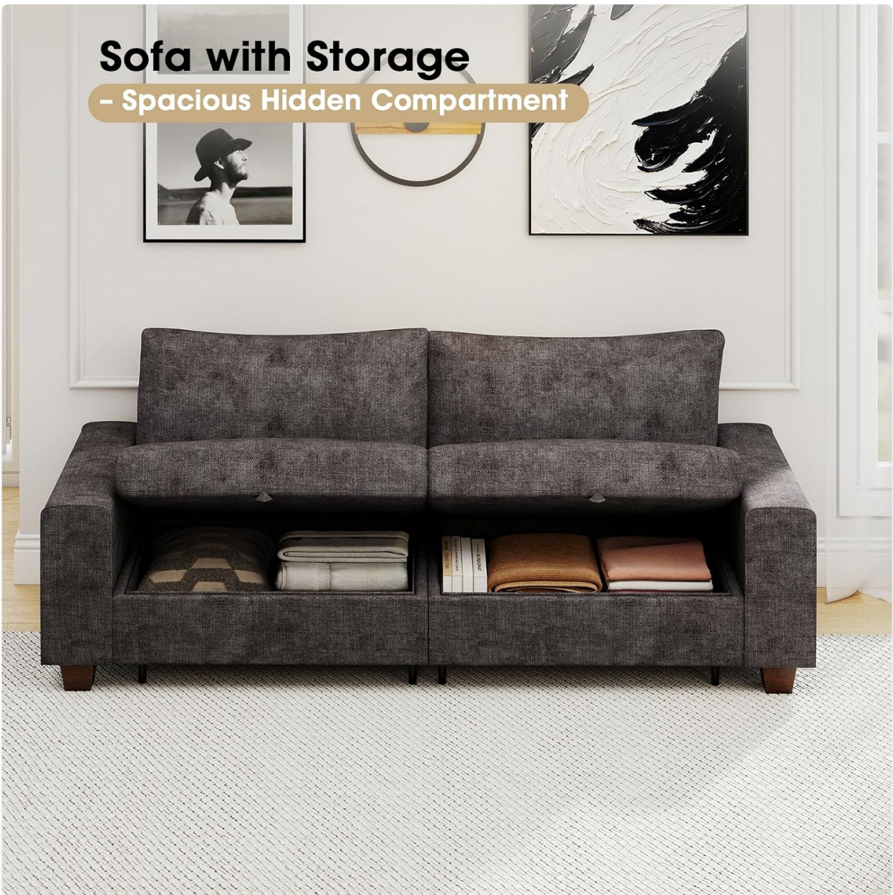
Figure 7: Sofa with hidden storage compartments.