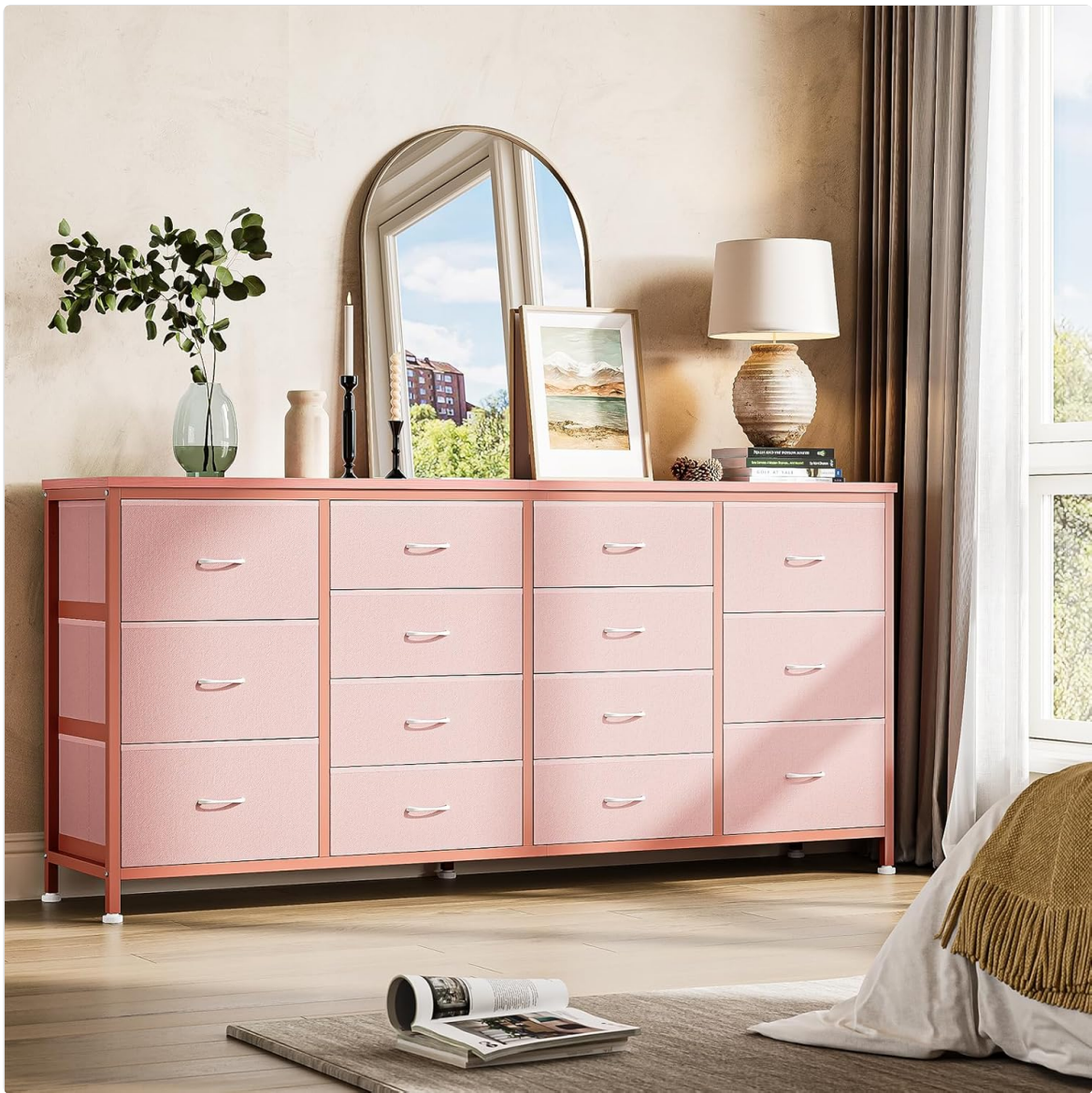
Figure 3: Organized Drawer Storage