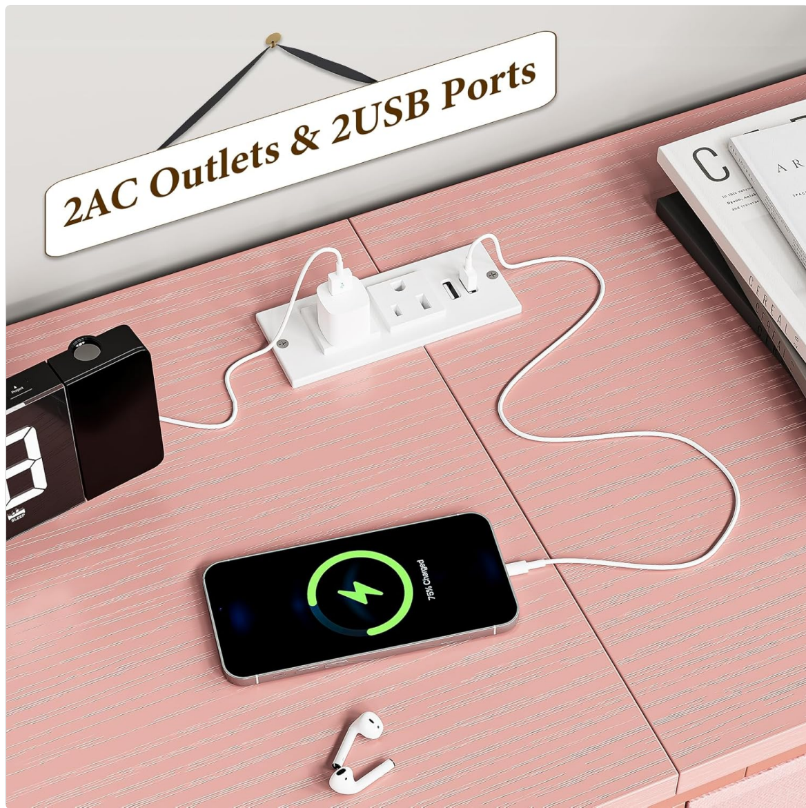
Figure 4: Integrated Power Outlets