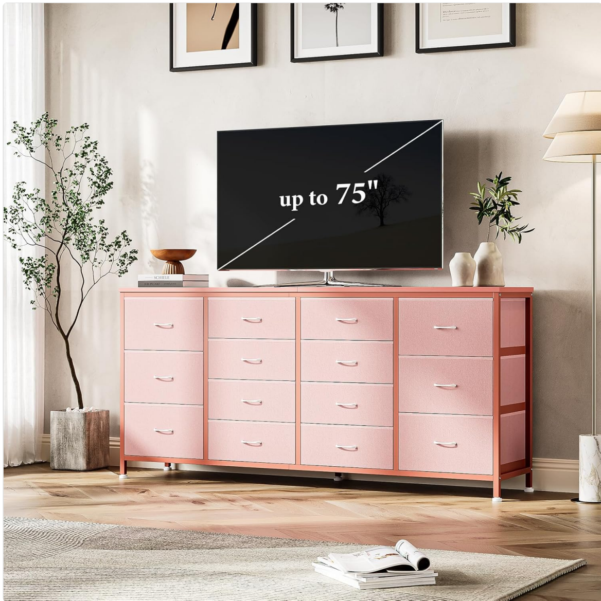
Figure 2: Assembled Dresser TV Stand