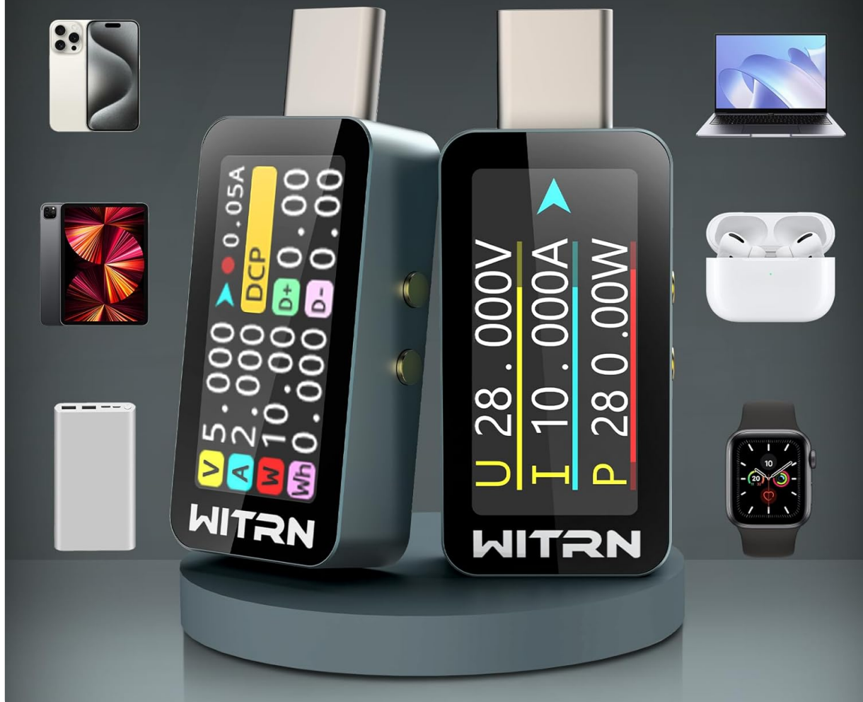
Figure 2: The USB Tester is compatible with various USB-C devices.