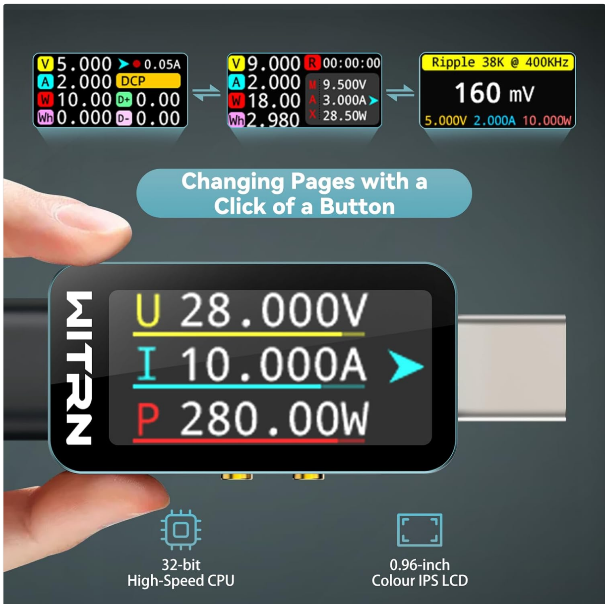
Figure 3: Changing display pages with a click of a button.