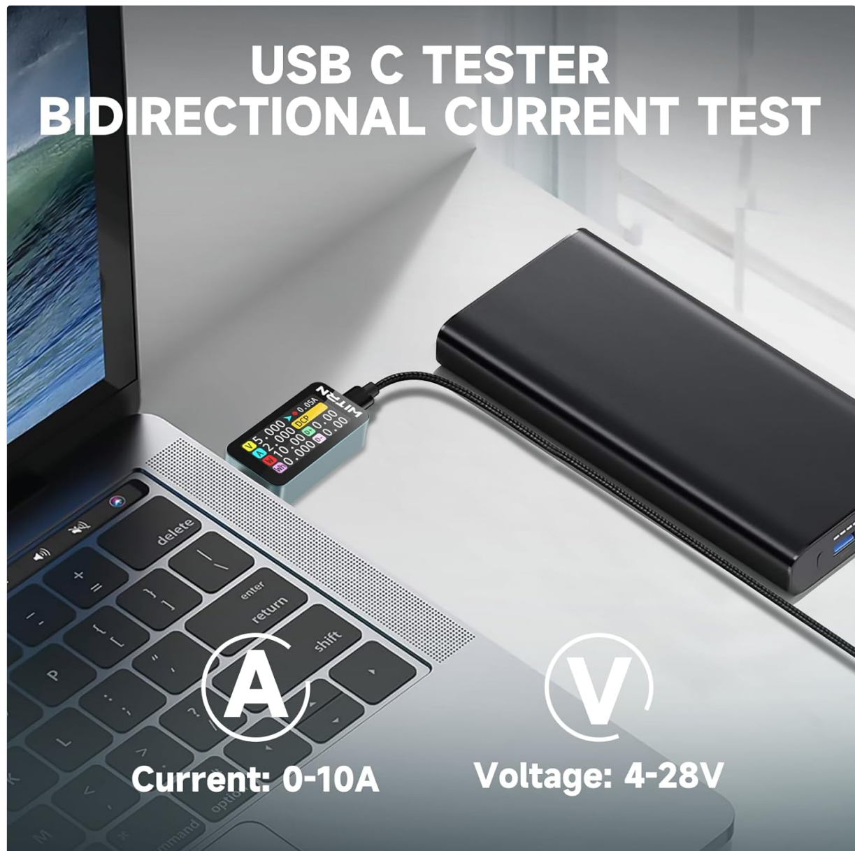
Figure 1: Heemol USB Tester demonstrating bidirectional current testing with a laptop and power bank.