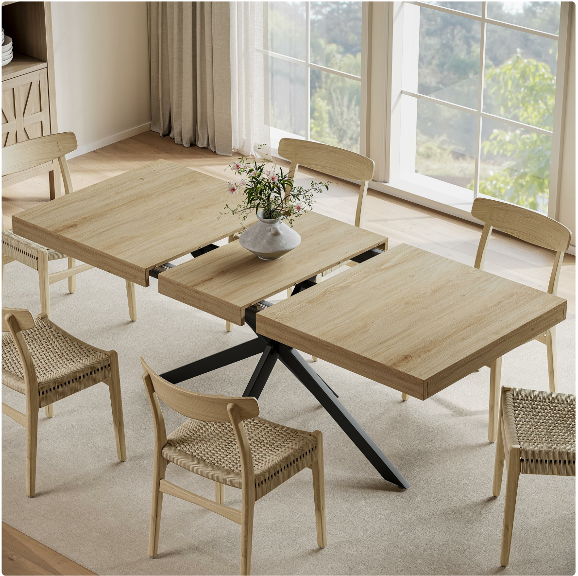
Image: The MECHYIN Extendable Dining Table in its compact form, suitable for 4-6 people.