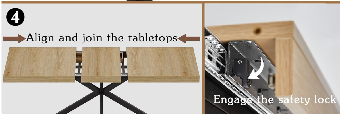
Image: Visual guide showing the process of releasing latches, pulling the tabletop, inserting the extension leaf, and engaging safety locks.