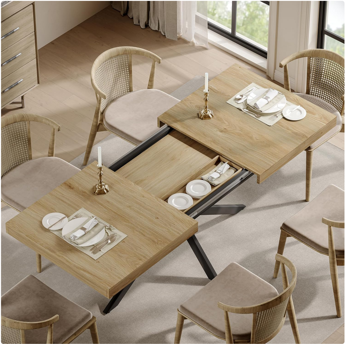
Image: The hidden storage compartment beneath the table, perfect for keeping small items organized.

Your browser does not support the video tag.