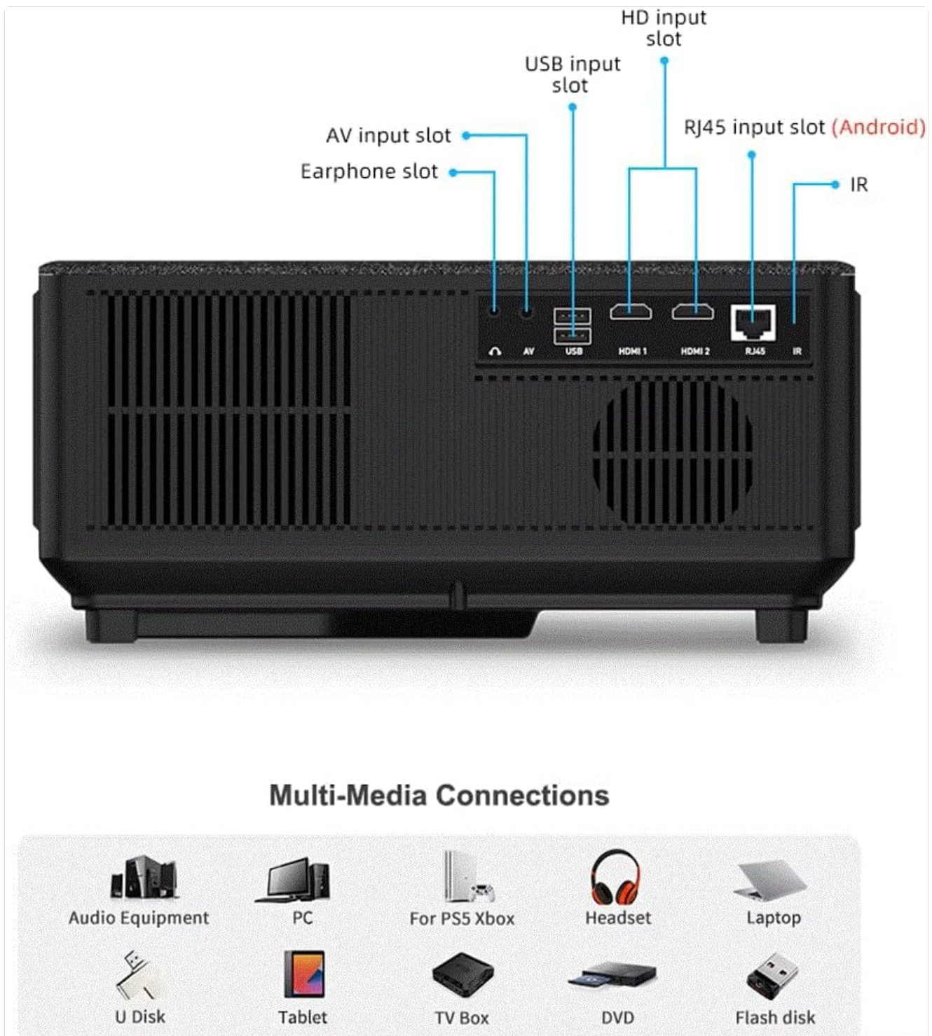
Figure 5.1: Multi-Media Connections Overview.