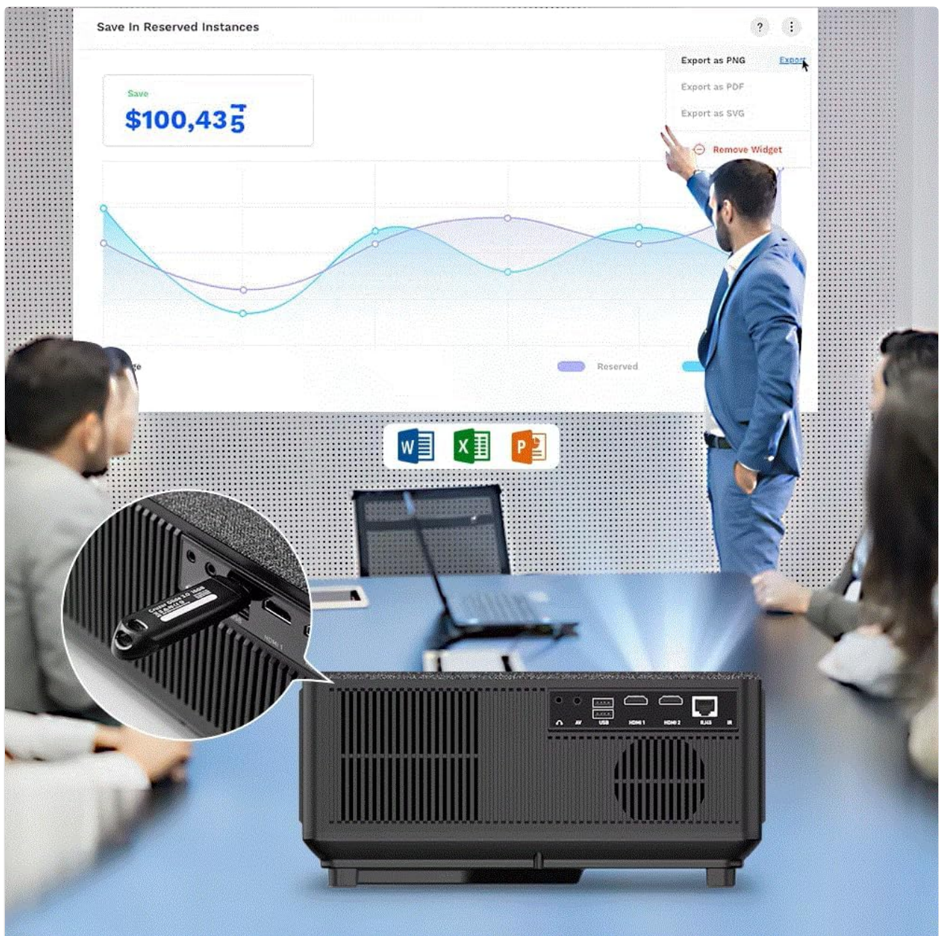
Figure 5.2: Projector in a business presentation scenario, demonstrating USB input capability.