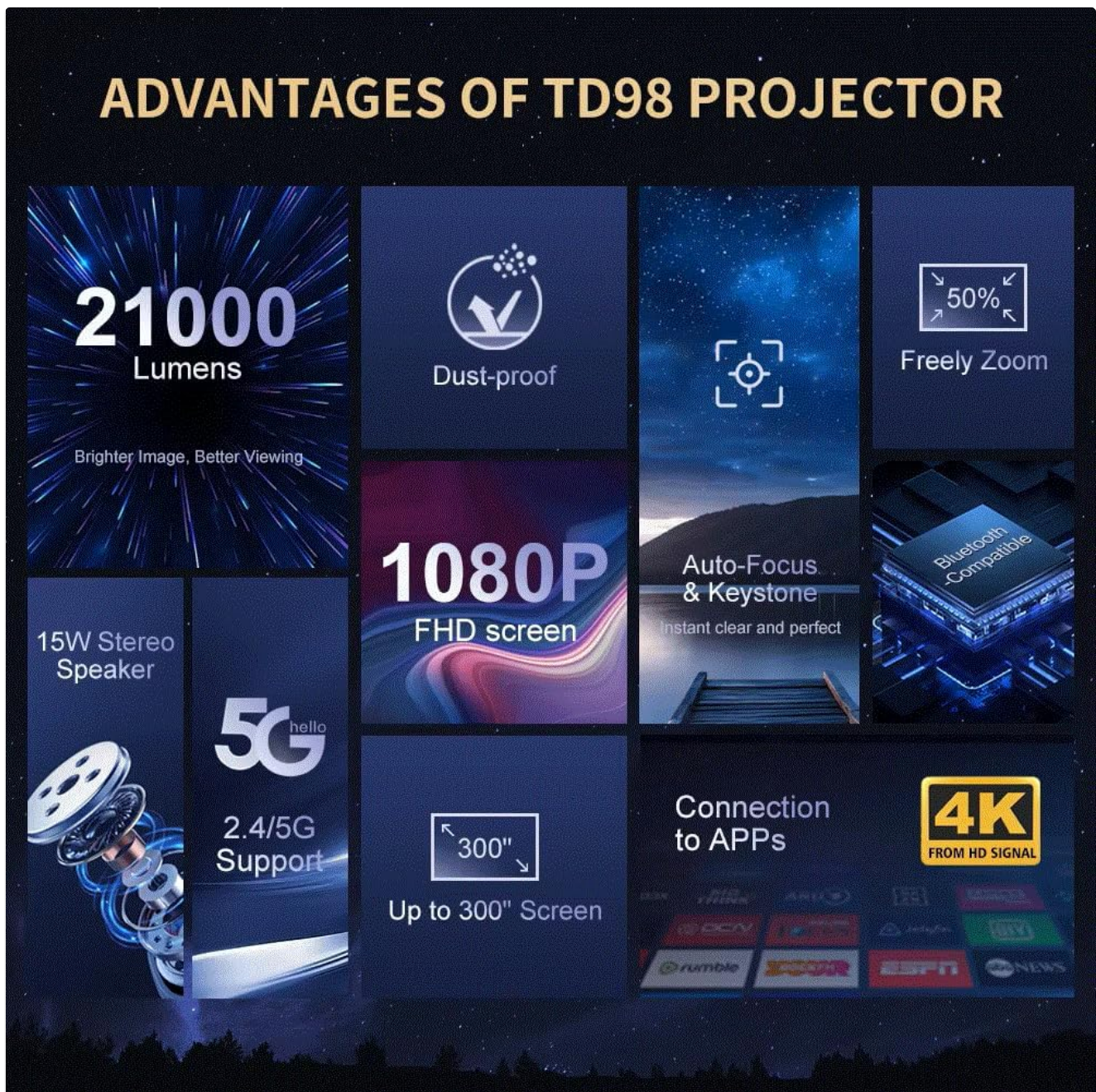
Figure 2.1: Overview of TD98 Projector Key Features.