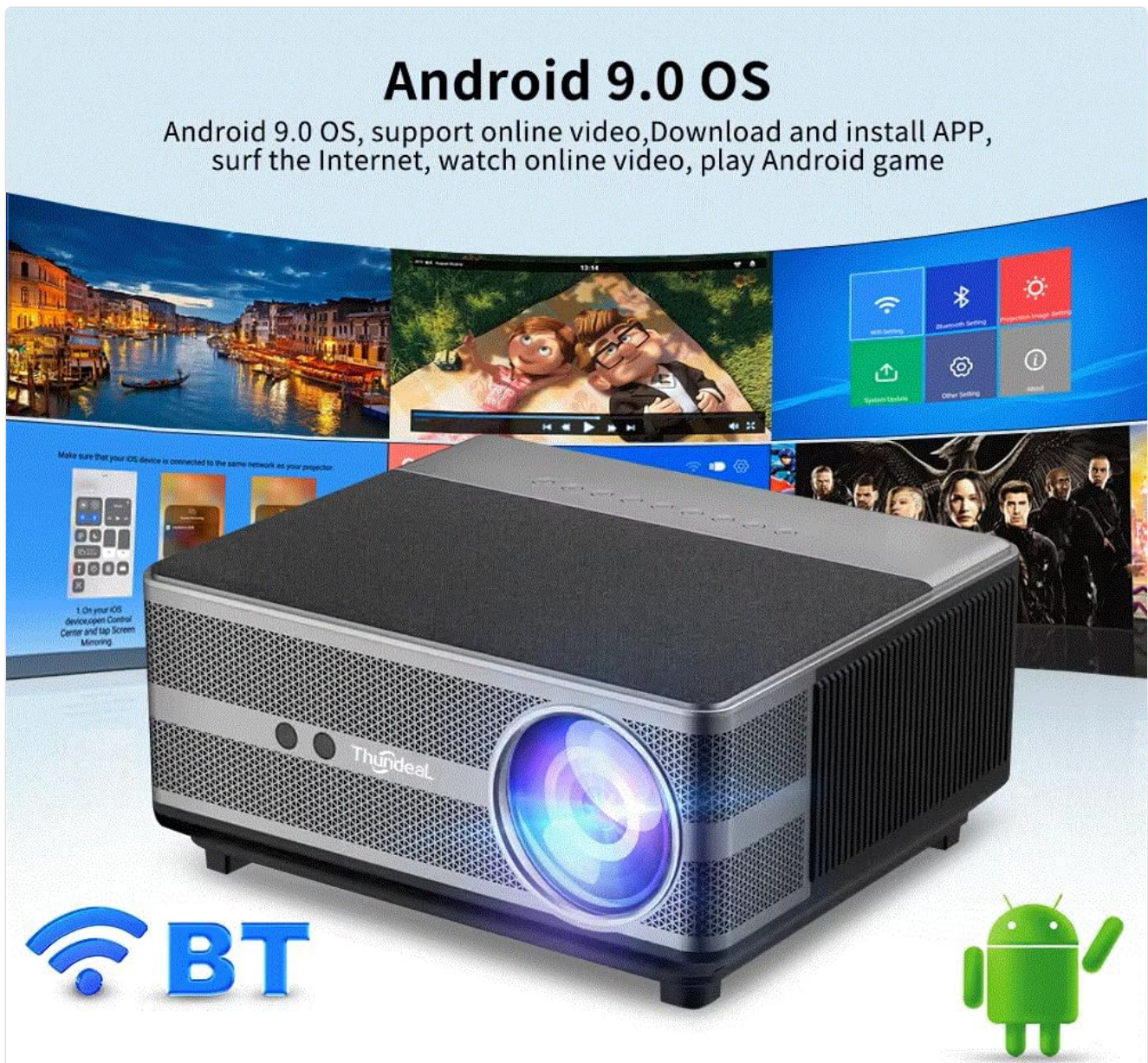
Figure 4.1: Android 9.0 OS Interface.

The projector runs on Android 9.0 OS, allowing you to download and install applications from the Play Store, browse the internet, and play Android games directly on the projector.