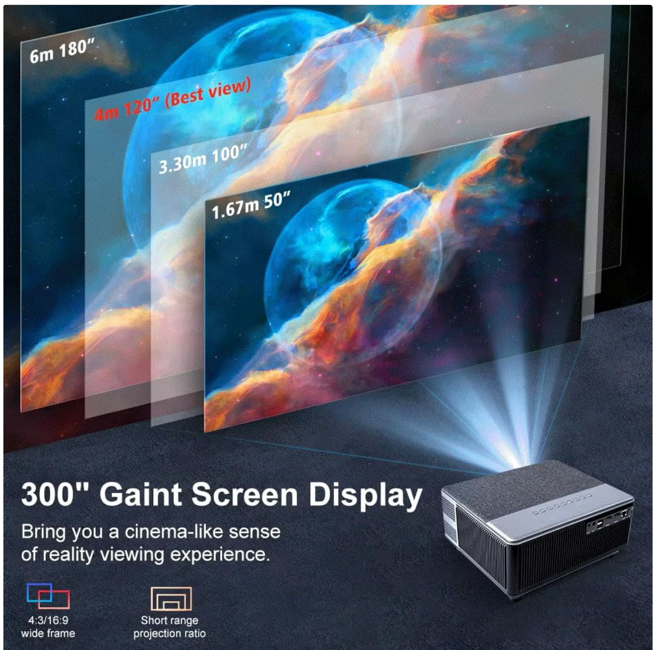
Figure 3.1: Recommended Projection Distances and Screen Sizes.