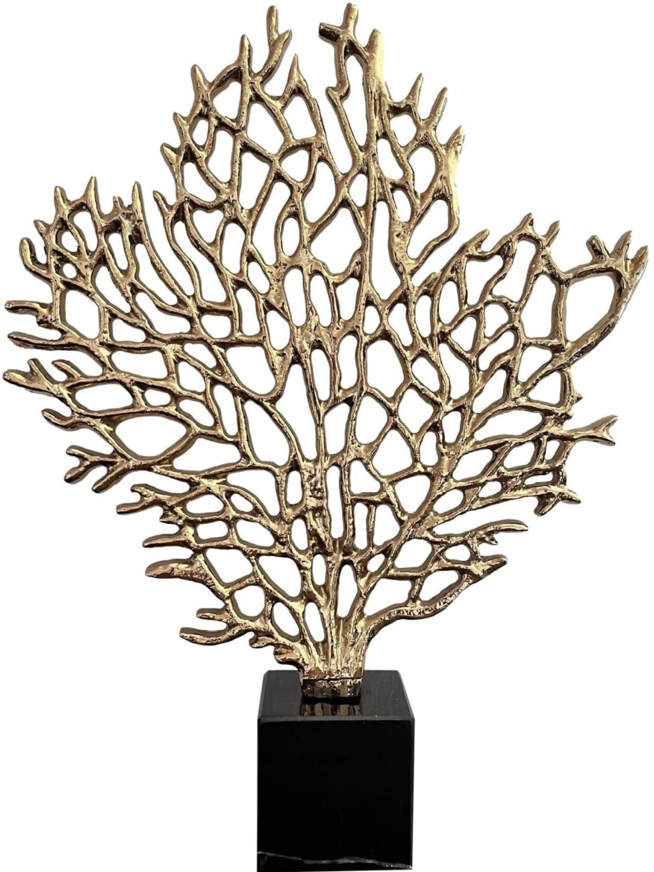
Figure 3.1: Front view of the Gold Gilded Accessory. This image displays the intricate, organic, tree-like design in a gold gilded finish, mounted on a solid black rectangular base. The accessory is designed for decorative purposes.