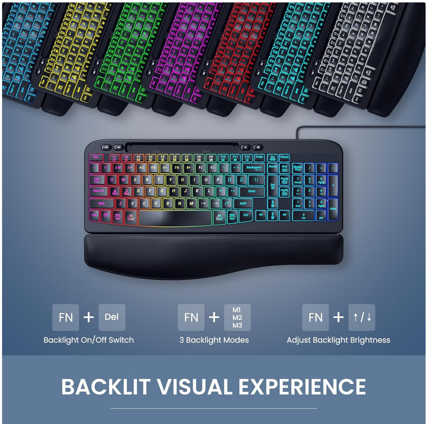
Figure 5: Visual guide to backlight control, showing key combinations for turning the backlight on/off, changing modes, and adjusting brightness levels.