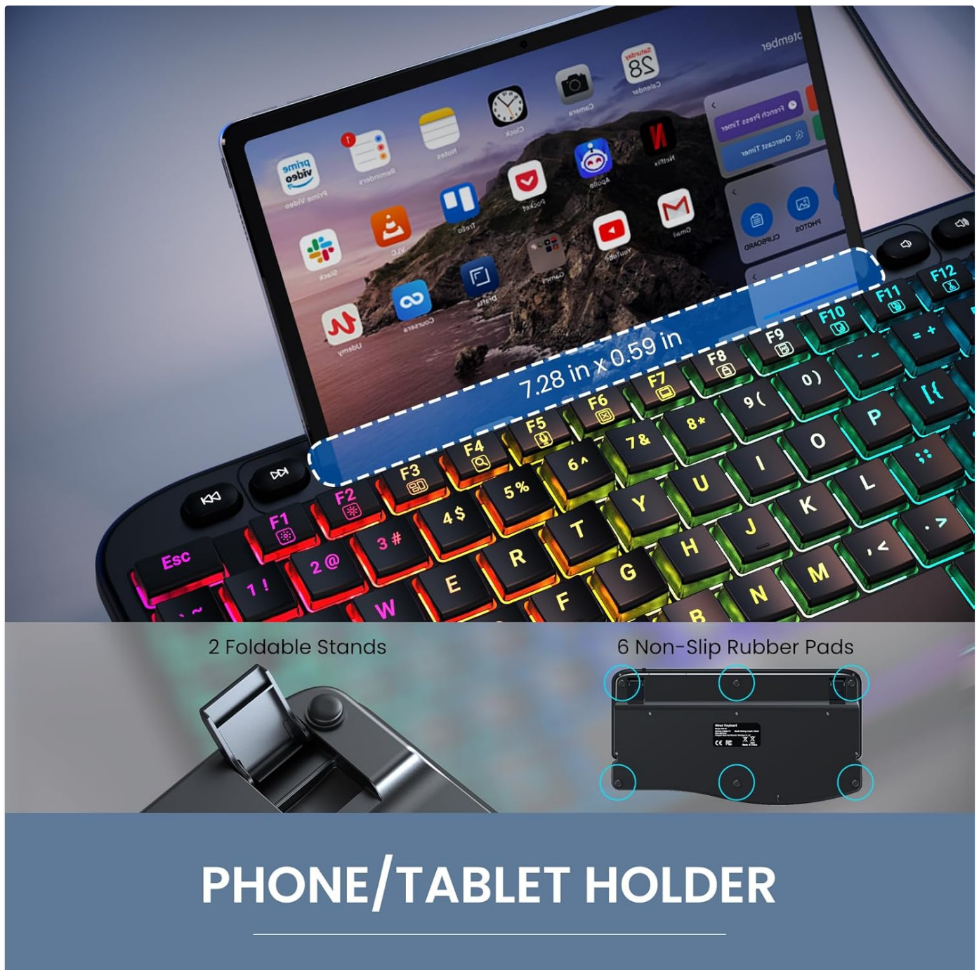
Figure 9: Close-up view of the integrated phone/tablet holder, indicating its dimensions (7.28 in x 0.59 in) and the presence of 2 foldable stands and 6 non-slip rubber pads for stability.