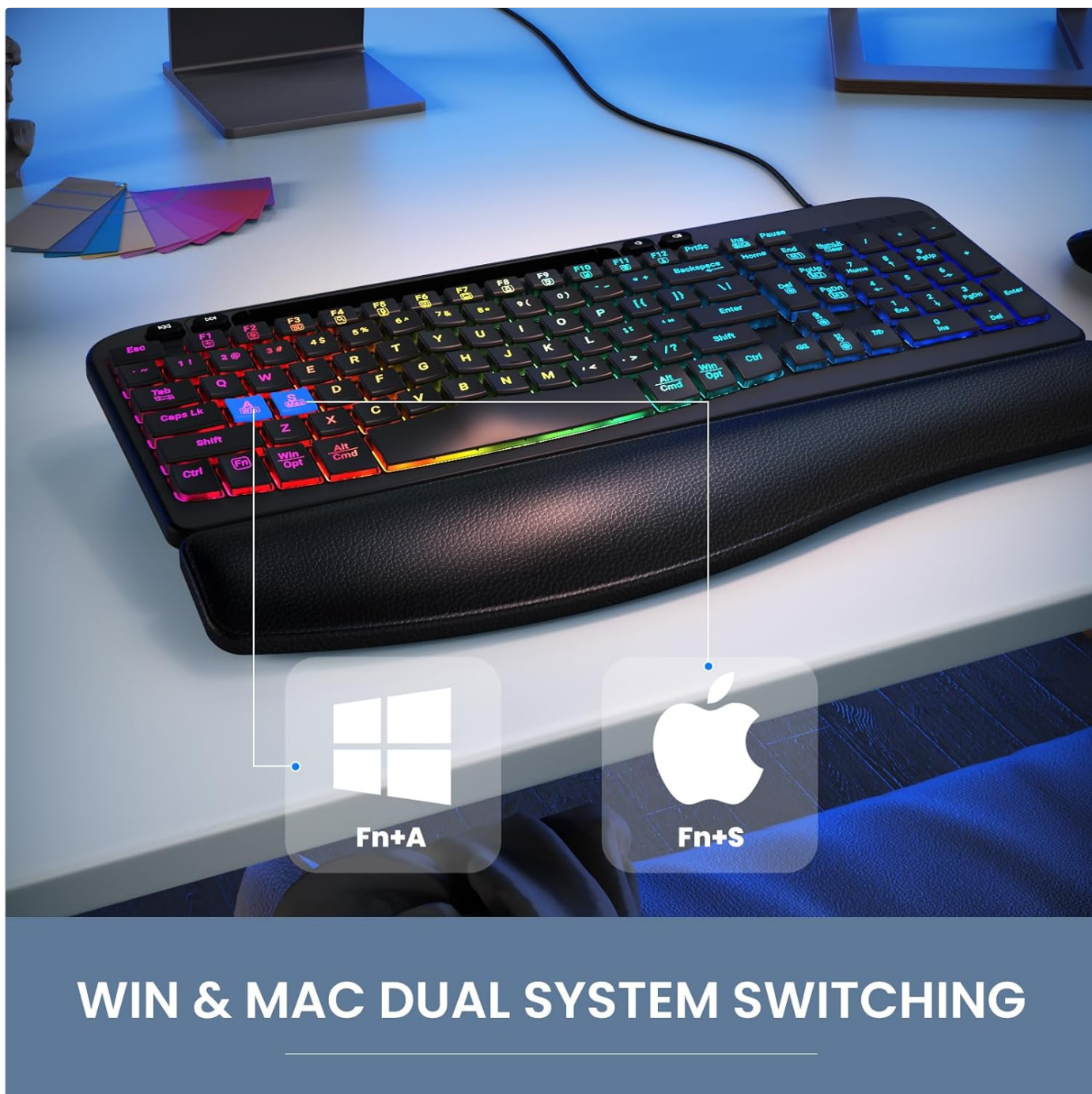
Figure 7: The keyboard's capability for dual system switching between Windows and Mac, activated by specific FN key combinations.