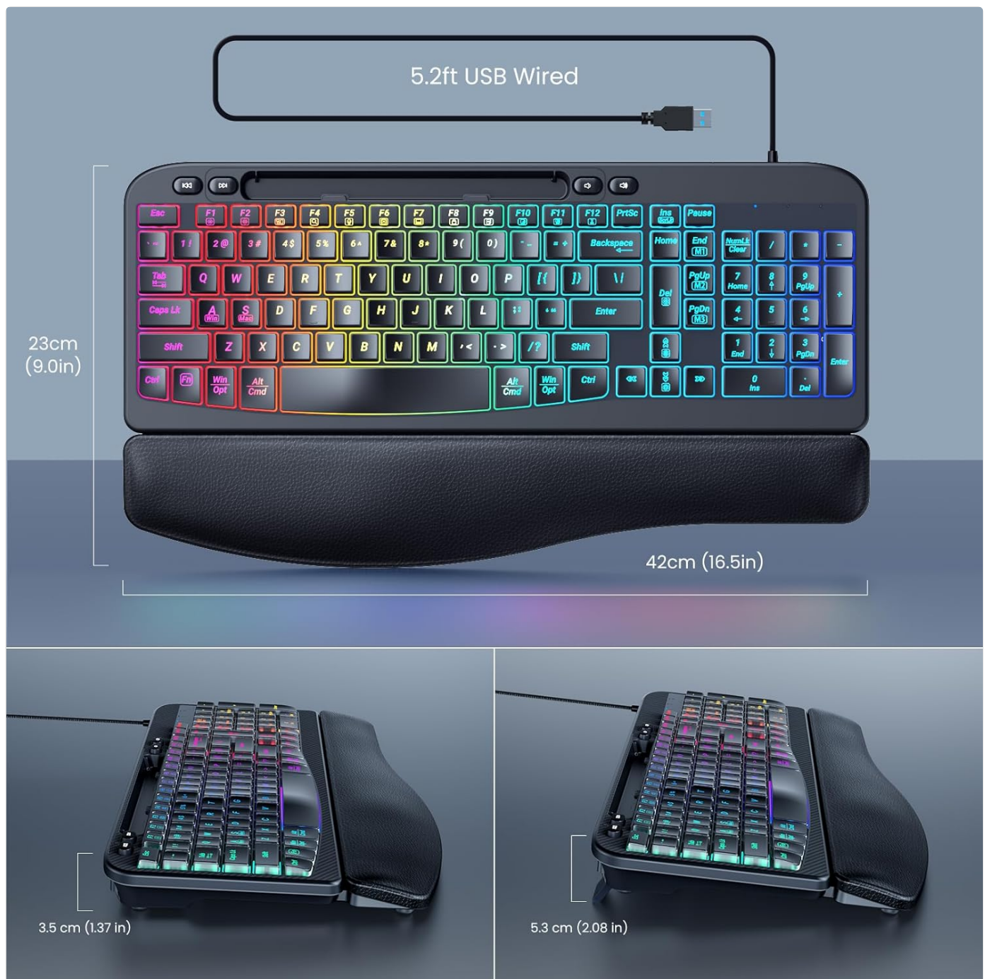
Figure 4: The keyboard's dimensions and its 5.2ft USB wired connection, illustrating its compact yet full-sized design for easy setup.