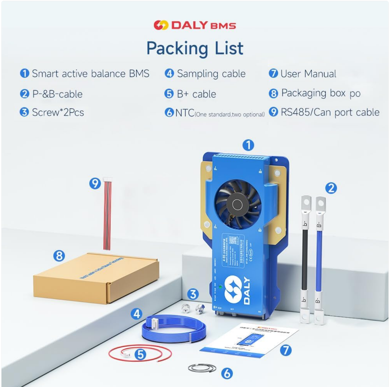
Image 4.1: Visual representation of the DALY BMS package contents, including the BMS unit, various cables, screws, NTC sensor, and user manual.