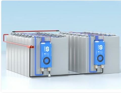
Image 5.3: Diagram showing how to connect multiple BMS units in parallel for increased capacity.