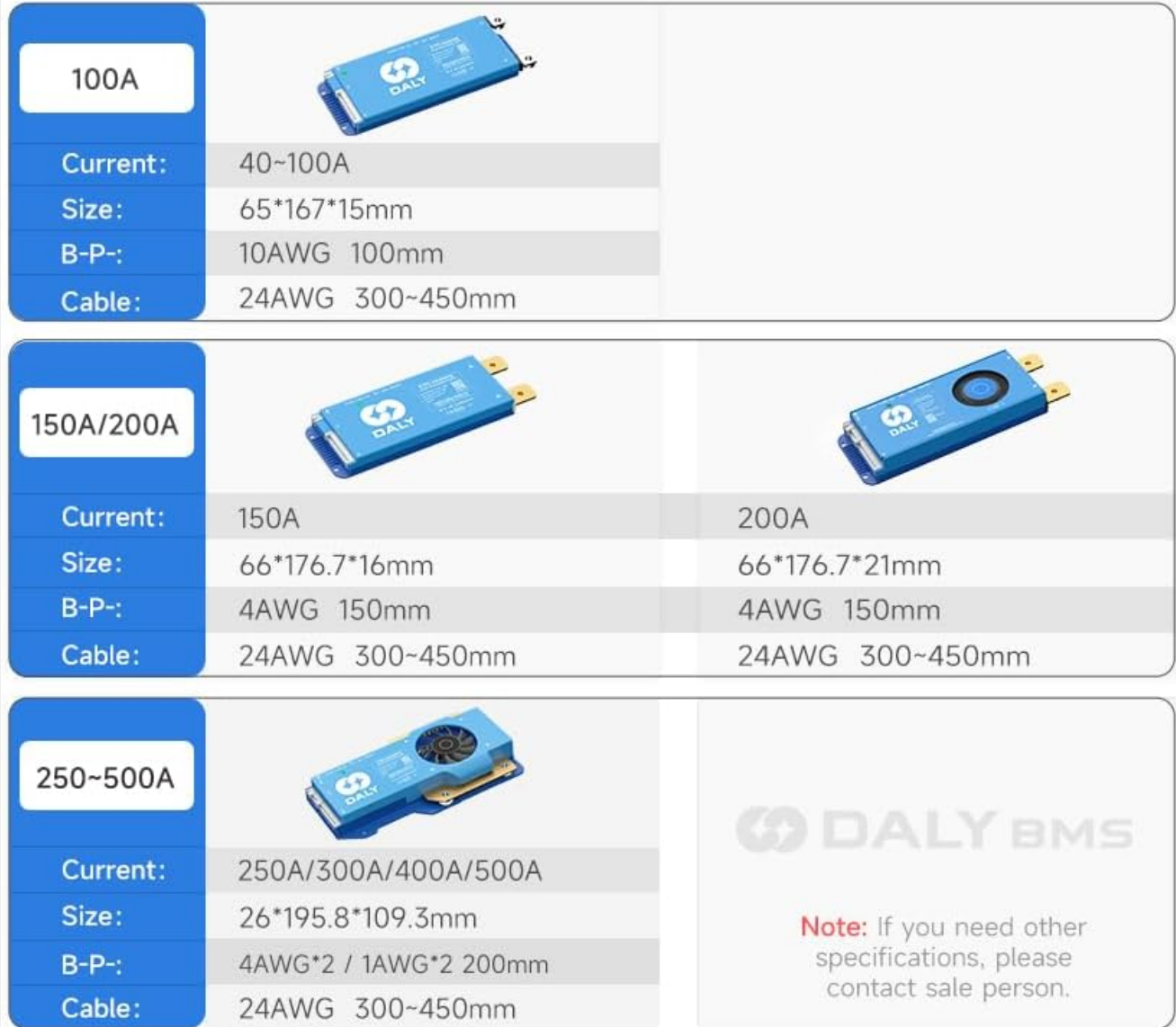
Image 9.1: Table showing various DALY BMS models with their current ratings, sizes, and cable specifications, applicable for 4S-24S configurations.

Product dimensions are width*length*thickness, dimensional data tolerance range: +0.5mm.