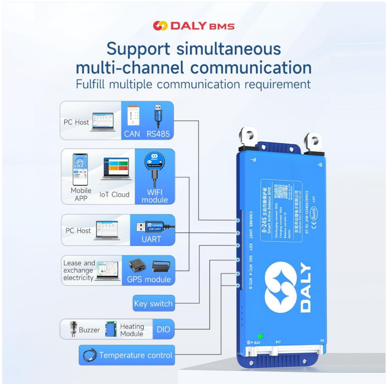
Image 3.1: Diagram illustrating the DALY BMS's support for multi-channel communication including PC Host (CAN, RS485, UART), Mobile APP (Bluetooth, WiFi module), GPS module, Key switch, Buzzer, Heating Module, and DIO for temperature control.