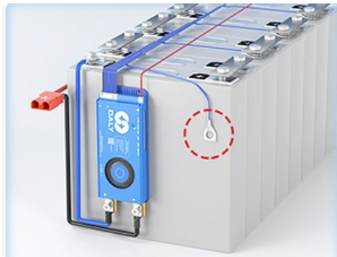
Image 5.4: Comprehensive wiring diagram for all-in protection, including main power and balance connections.