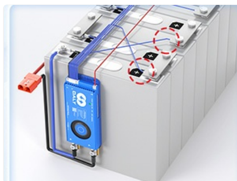
Image 5.2: Illustration of BMS misconnection protection, highlighting correct balance wire connections.