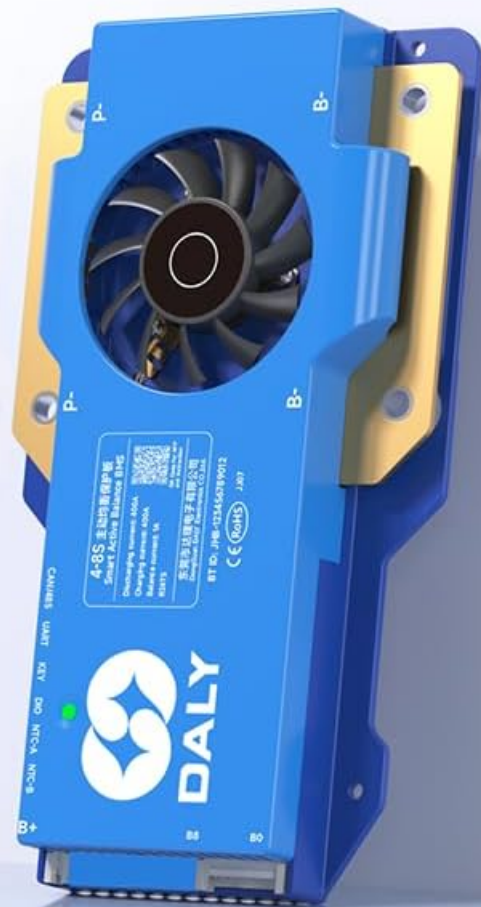
Image 1.1: DALY Smart Active Balance BMS highlighting 4S-8S, 400A, 1A balance, Bluetooth, UART+RS485+CAN.