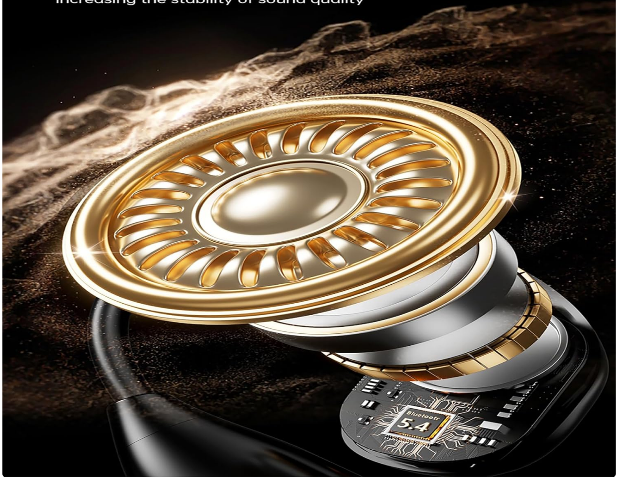
Image: Close-up of the 14mm dynamic driver inside the AWEI TZ12 earbuds, emphasizing natural and pure sound output.

Creating a natural sound field Increasing the stability of sound quality