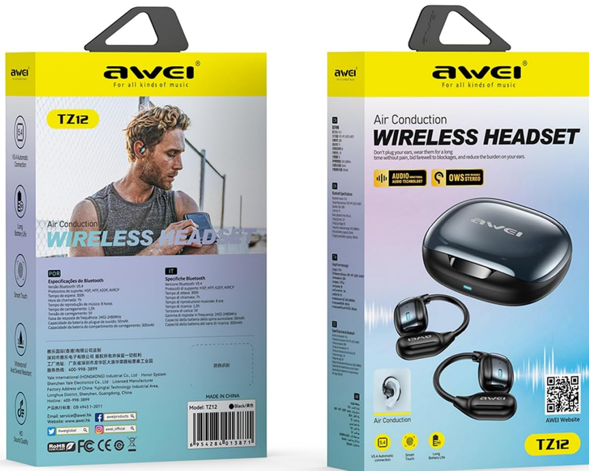
Image: The retail packaging for the AWEI TZ12 Wireless Headset, showing the product and key features on the box.