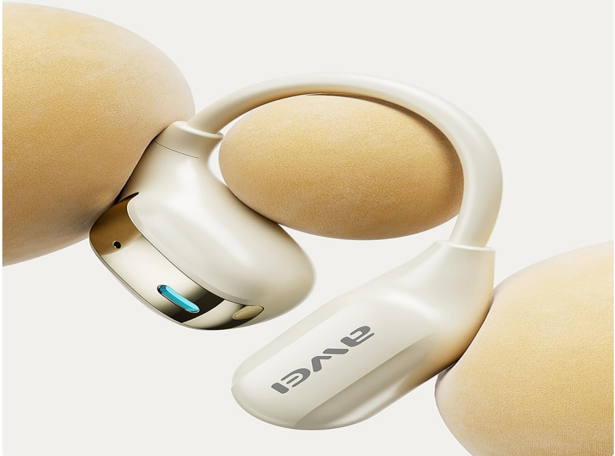
Image: AWEI TZ12 earbuds showcasing their skin-friendly silicone ear hooks, designed for a secure and comfortable fit.

The ergonomic structure fits human auricles closely, alloy wires in the silicone achieve softness and rigidity in sync