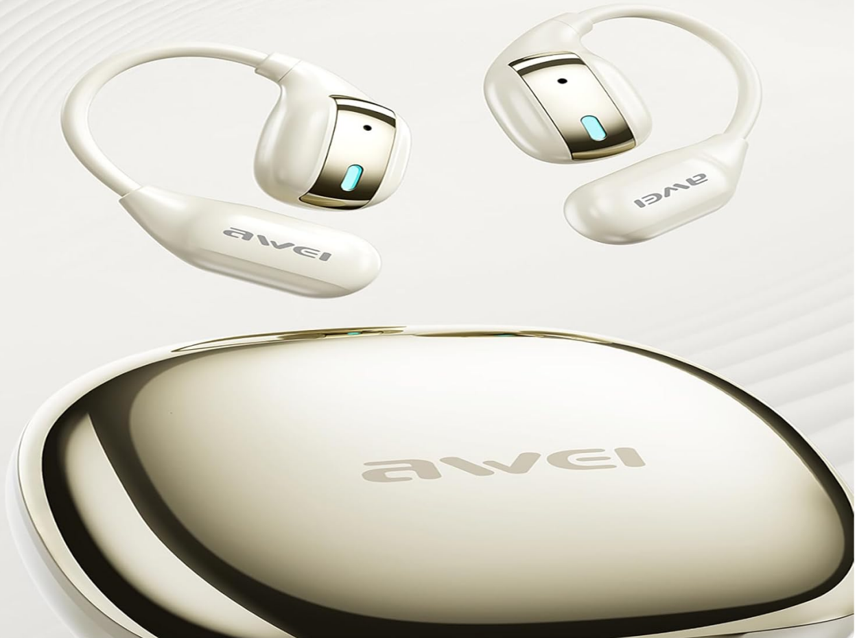
Image: AWEI TZ12 TWS Sports Earphones, showcasing the earbuds and their charging case, highlighting their open wearable stereo design.