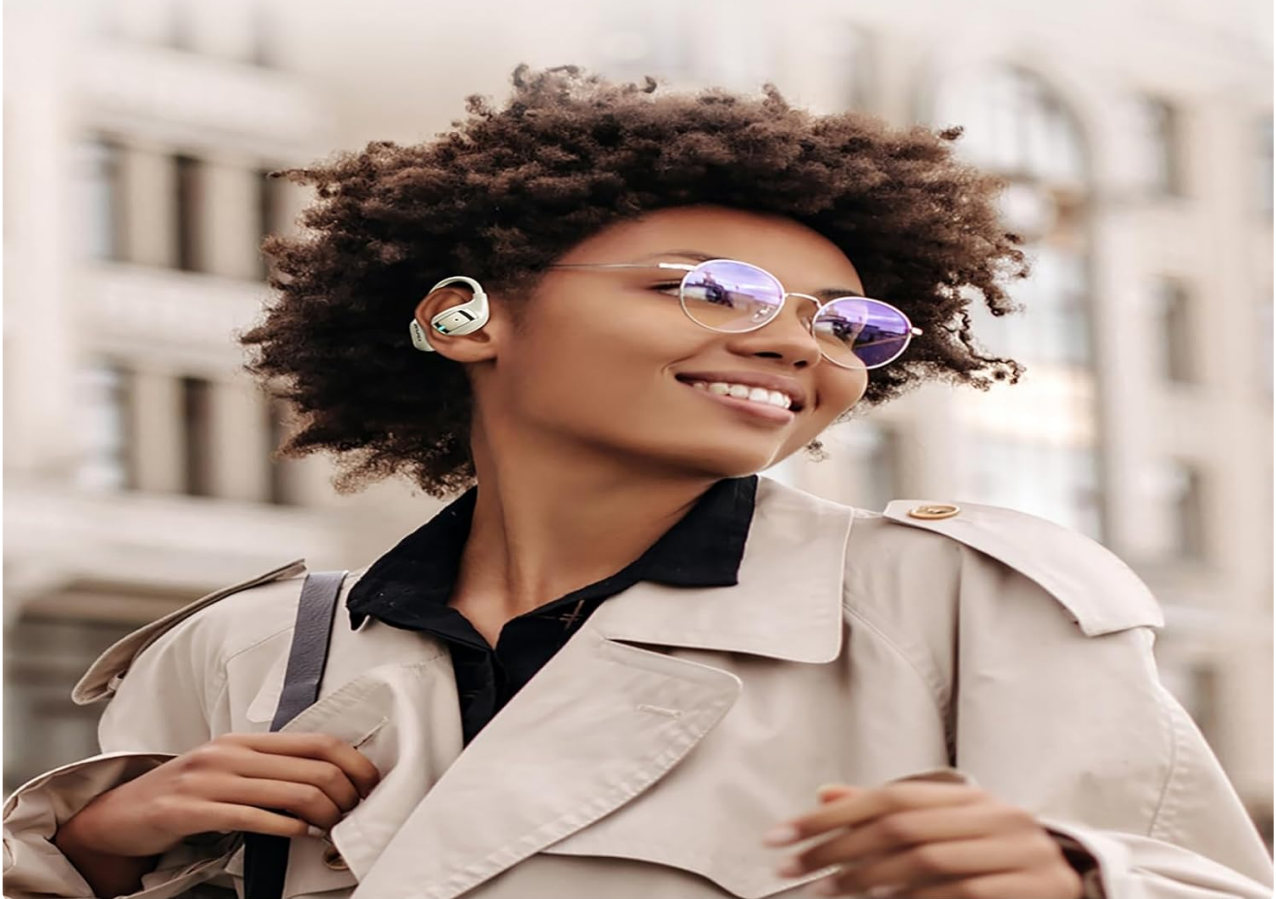
Image: A person wearing the AWEI TZ12 earbuds, demonstrating the secure fit provided by the over-ear design, allowing for awareness of surroundings.

Staying alert while listening to musics in dangerous environments