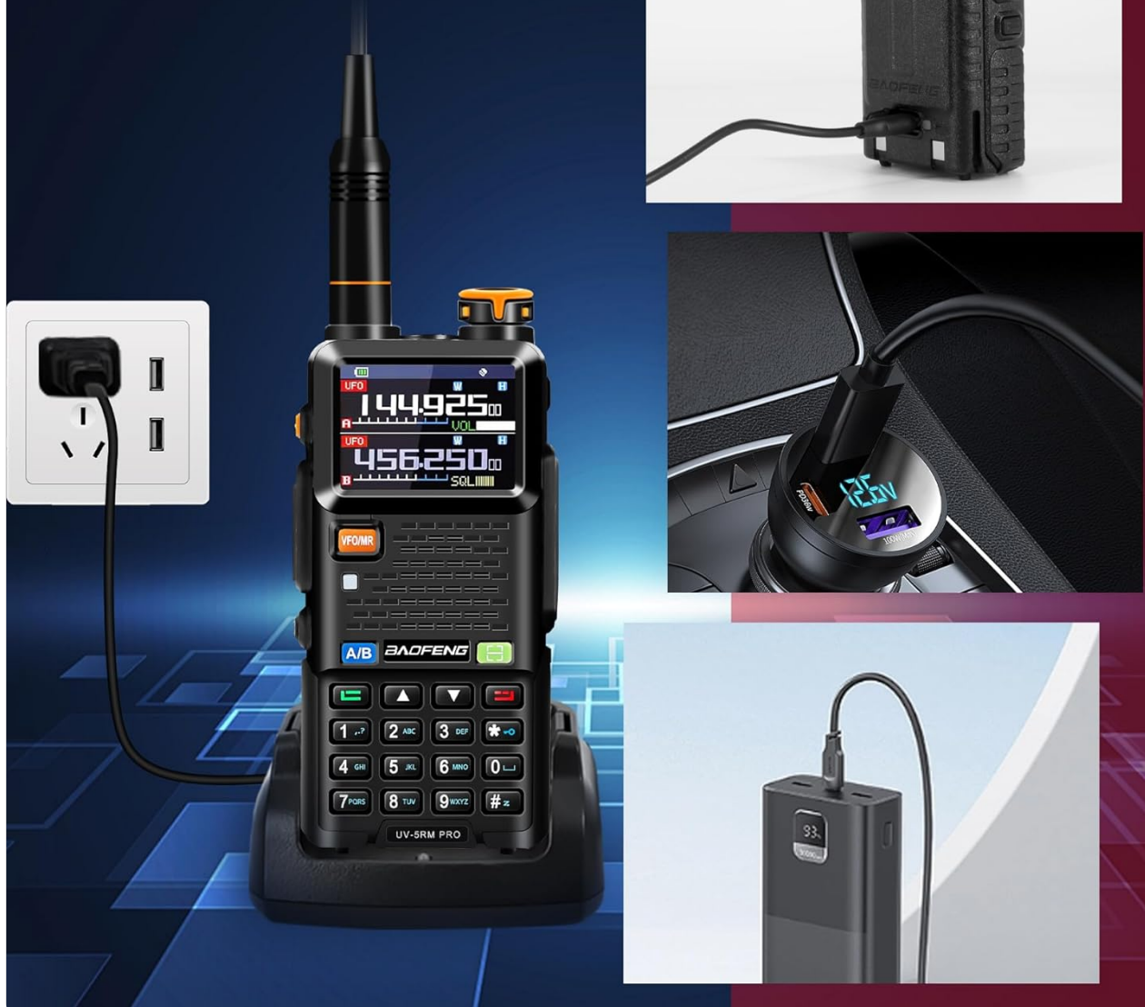
Figure 1: Multiple charging methods for the BAOFENG UV-5RM PRO, including base charger and Type-C port.