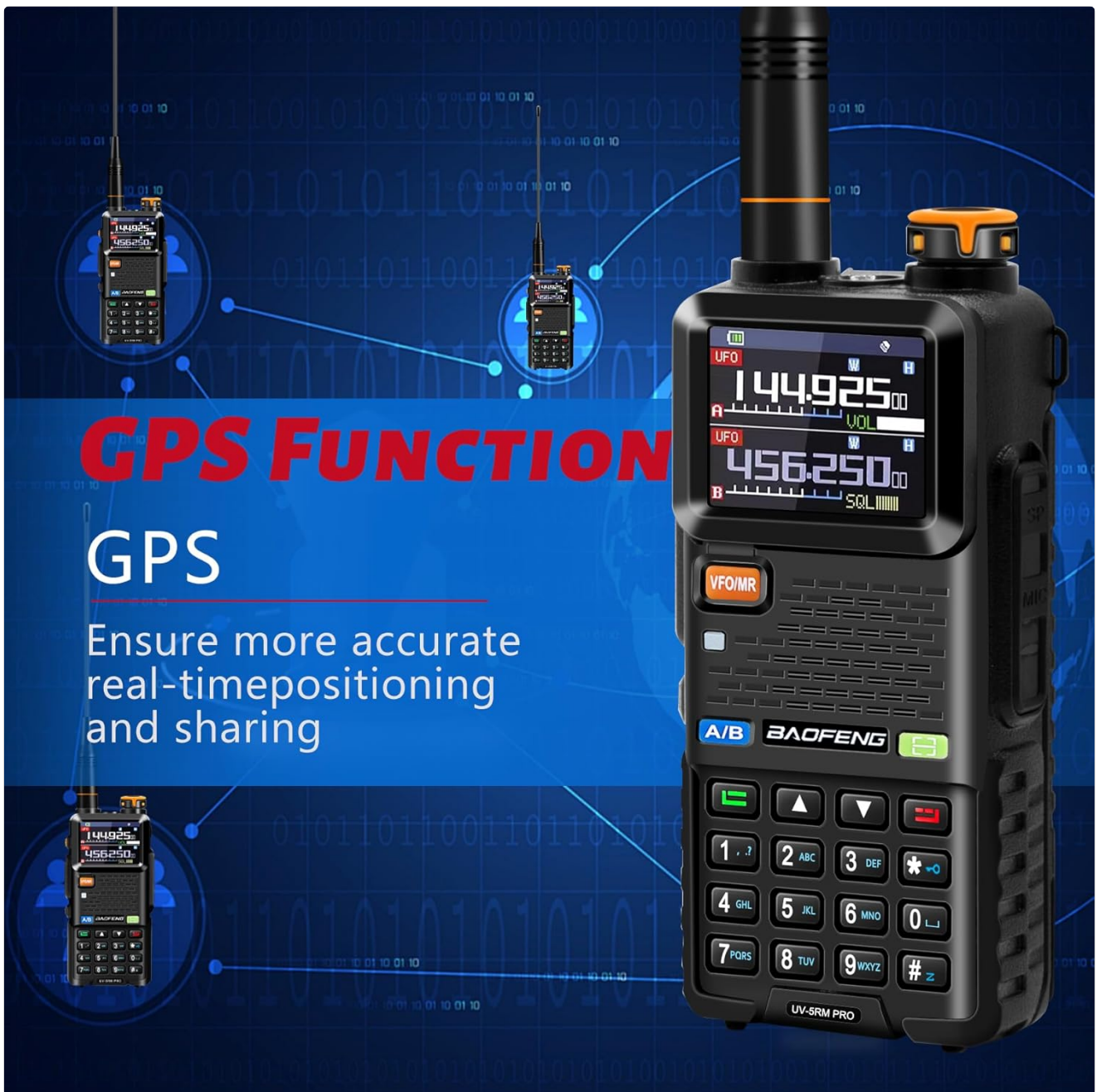
Figure 6: GPS functionality for accurate positioning and sharing.