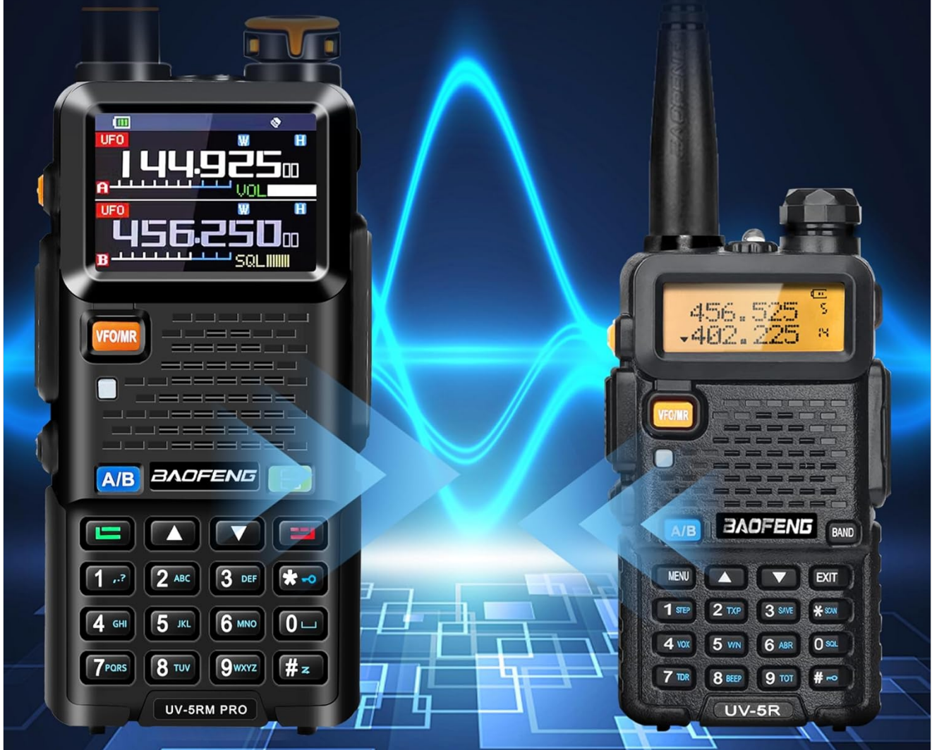
Figure 7: One-touch frequency copying feature.