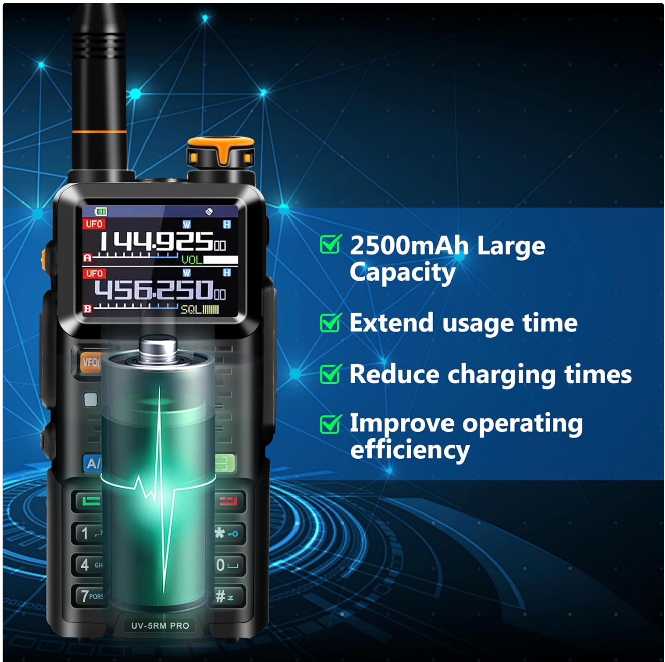
Figure 2: The 2500mAh battery provides extended usage and reduces charging frequency.