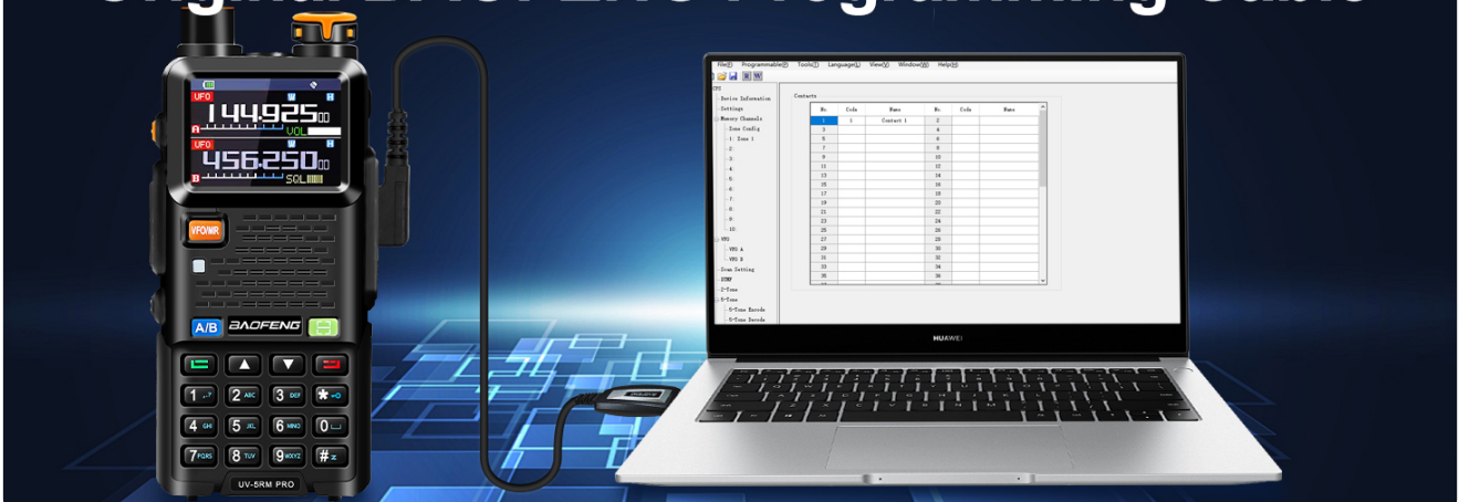
Figure 3: Connecting the radio to a computer for programming using the dedicated cable.