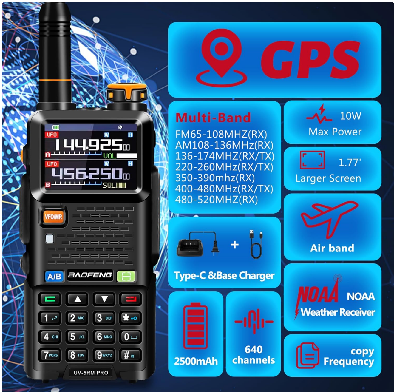
Figure 4: Overview of the BAOFENG UV-5RM PRO's key features and display.