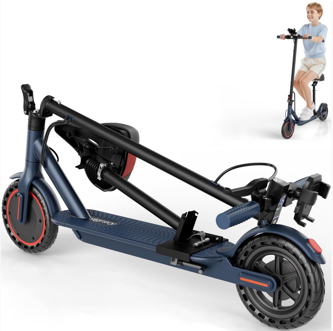
Figure 1: Sigravy Electric Scooter Adults-G6 with optional seat.