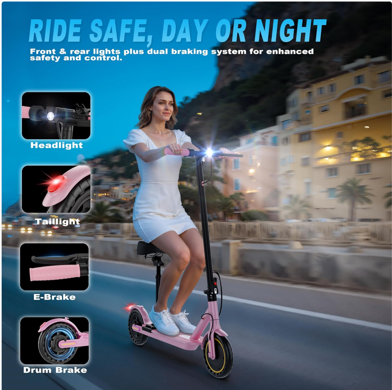
Figure 4: Safety features including headlight, taillight, and dual braking system.