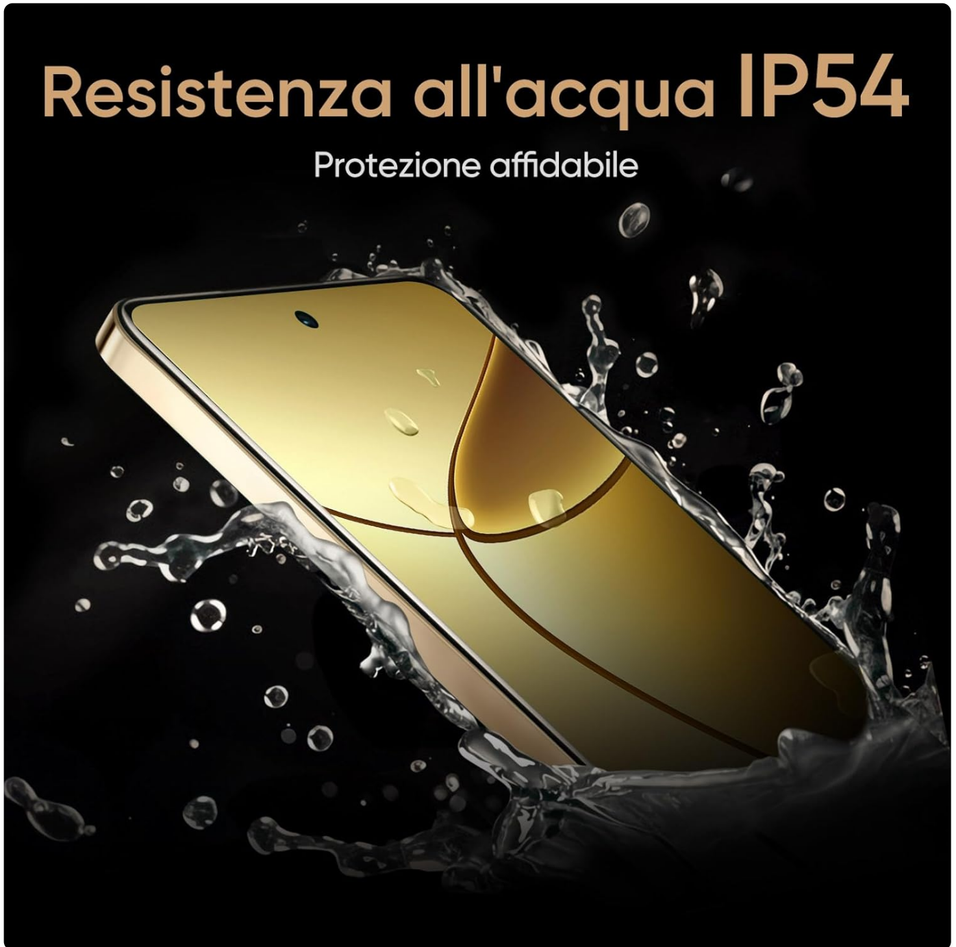
Image: The realme 12+ 5G Smartphone shown with water splashing on it, indicating its IP54 water resistance for reliable protection against splashes.