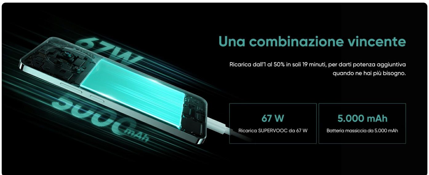
Image: An illustration demonstrating the 67W SUPERVOOC fast charging capability and the 5000 mAh battery of the realme 12+ 5G.