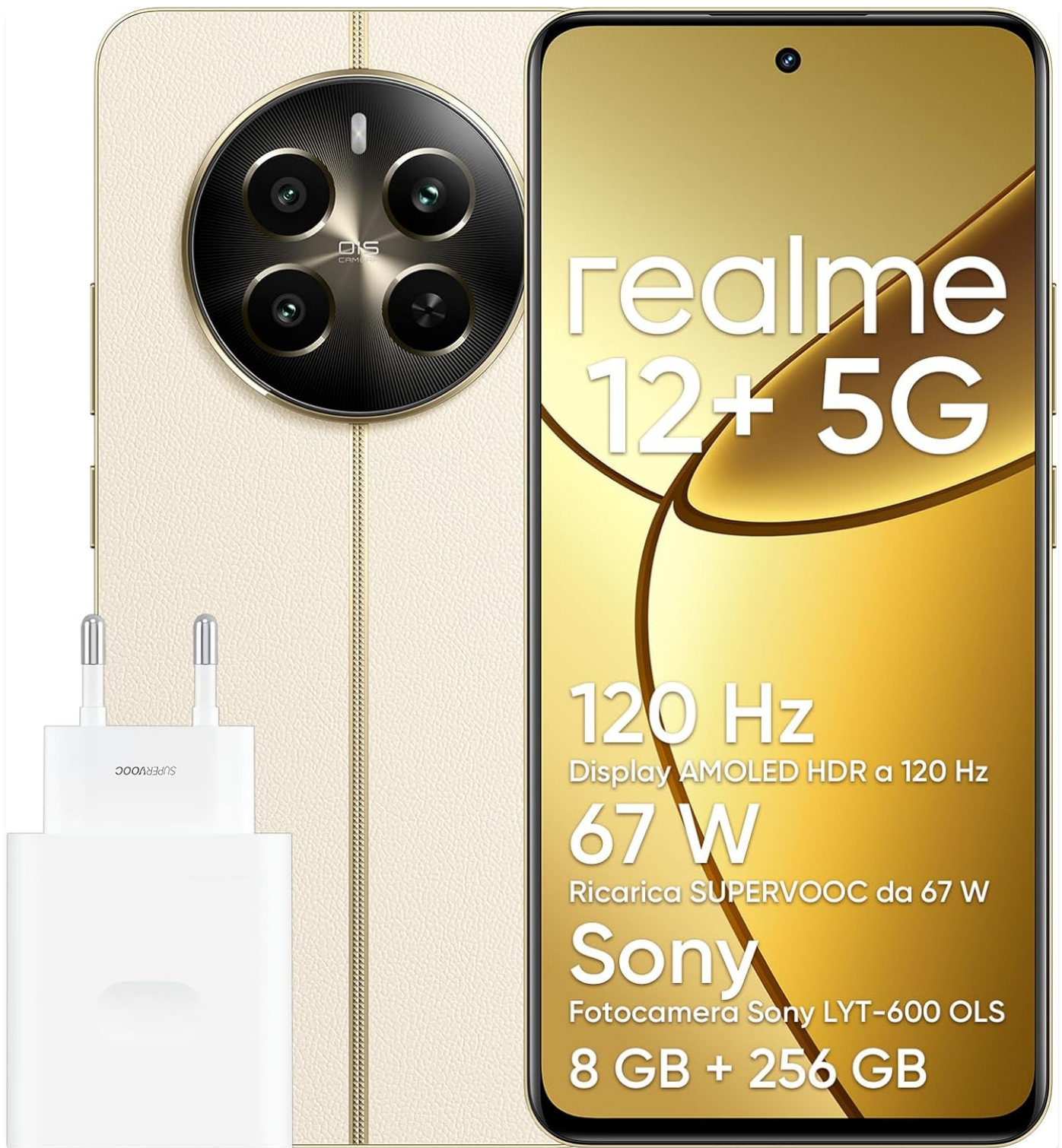
Image: Front and back view of the realme 12+ 5G Smartphone in beige, alongside its 67W SUPERVOOC charger. Key features like the 120Hz AMOLED display, camera specifications, and memory configuration are highlighted on the screen.