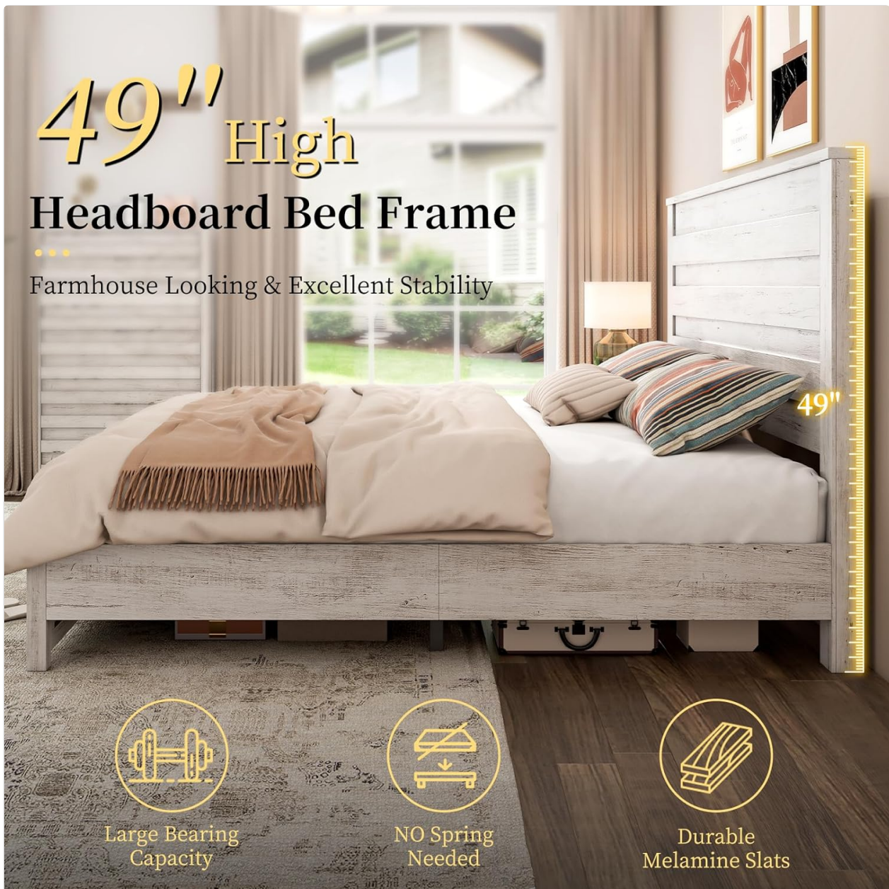
Image 4.1: Visual representation of the 49-inch high headboard and 12.2-inch under-bed clearance.