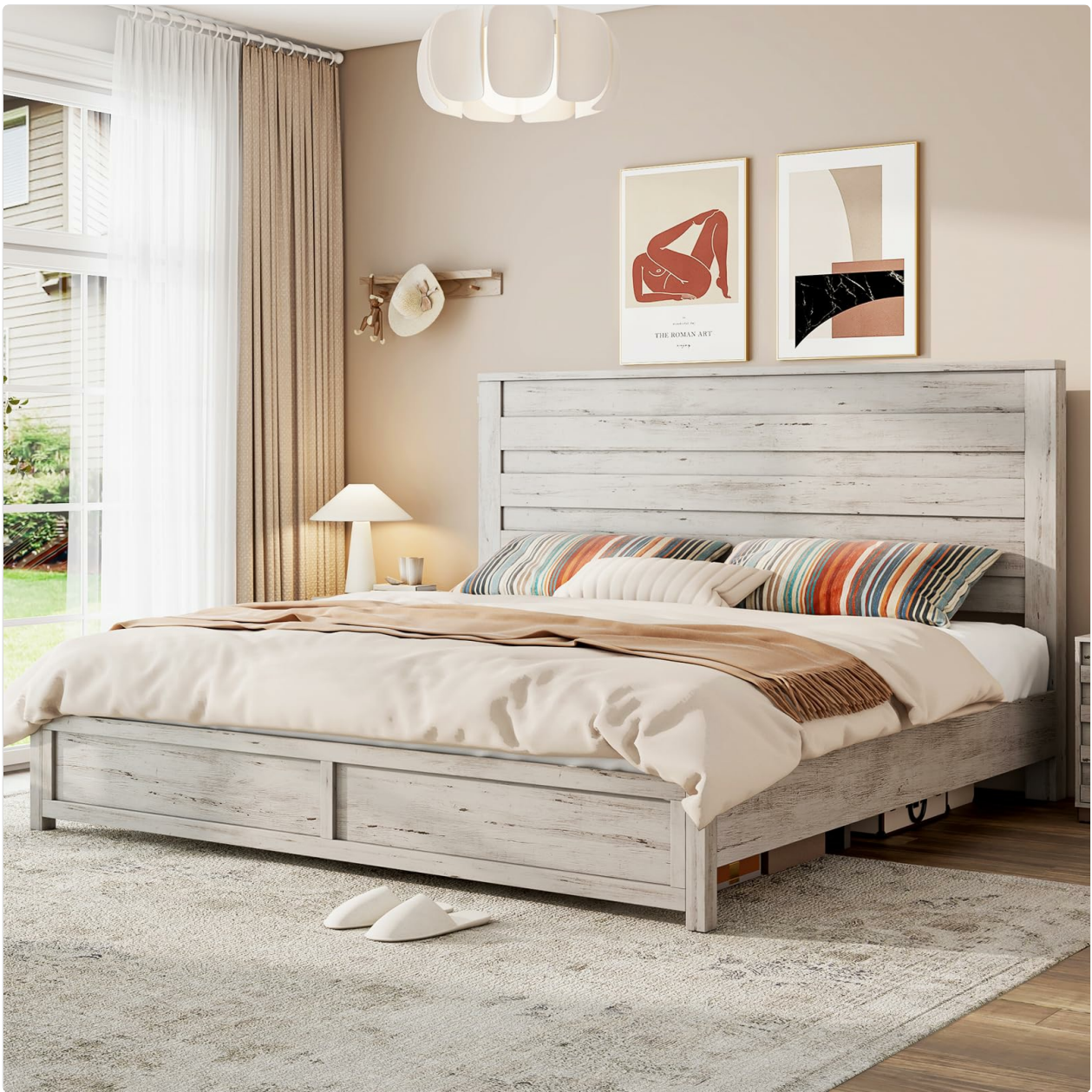
Image 1.1: Overall dimensions and key features of the King Bed Frame.