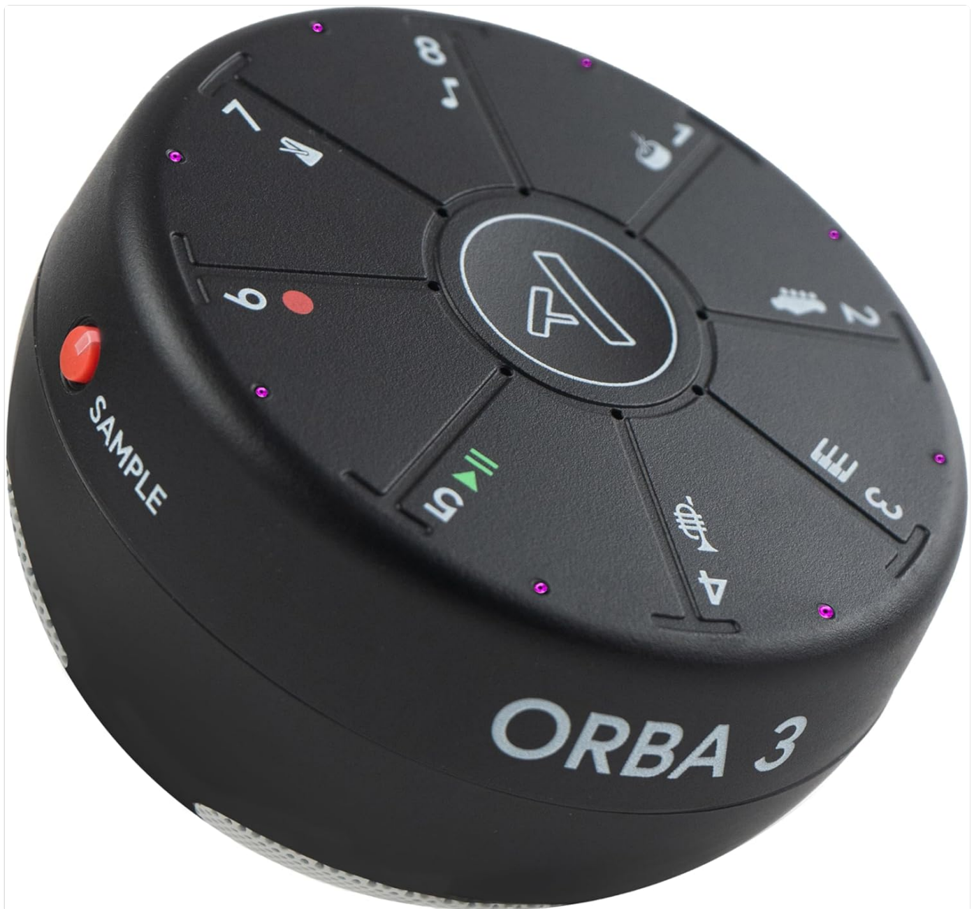
Image: The Artiphon Orba 3, showcasing its compact, spherical design with touch-sensitive pads on the top surface.