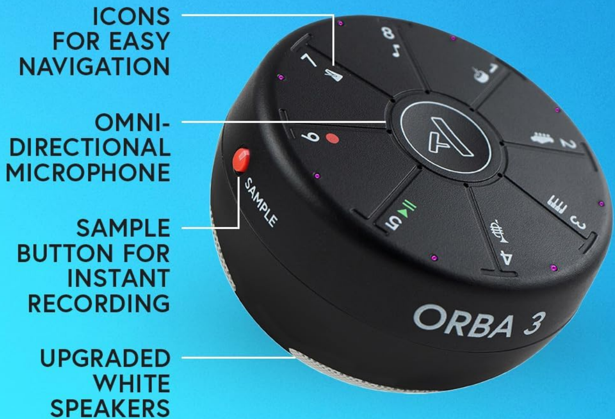
Image: A diagram illustrating the key features of the Orba 3, including navigation icons, the omni-directional microphone, the sample button, and the upgraded white speakers.