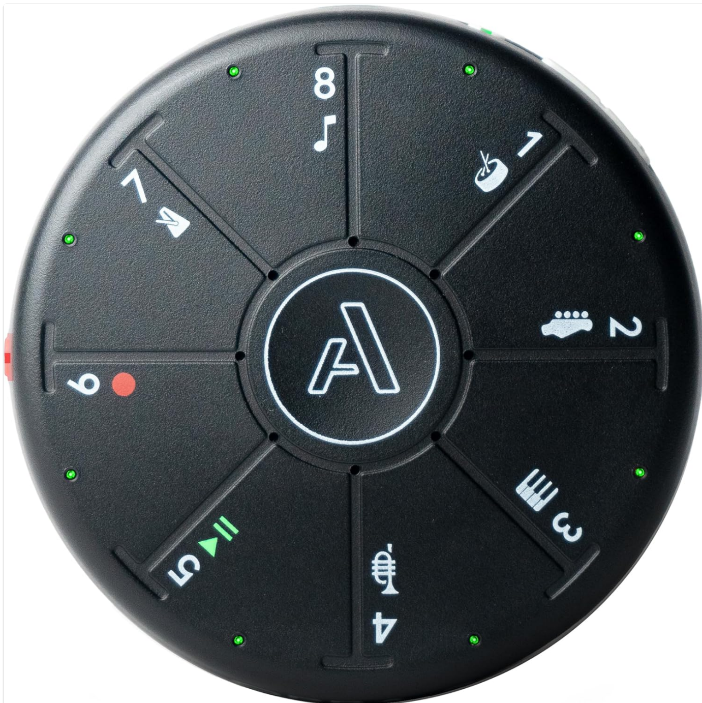
Image: A top-down view of the Orba 3, clearly showing the layout of its eight touch-sensitive pads and the central Artiphon logo. Refer to the Artiphon Connect App for detailed tutorials and advanced control options, including instrument key selection (Pentatonic, Diatonic, Chromatic) and sound library management.