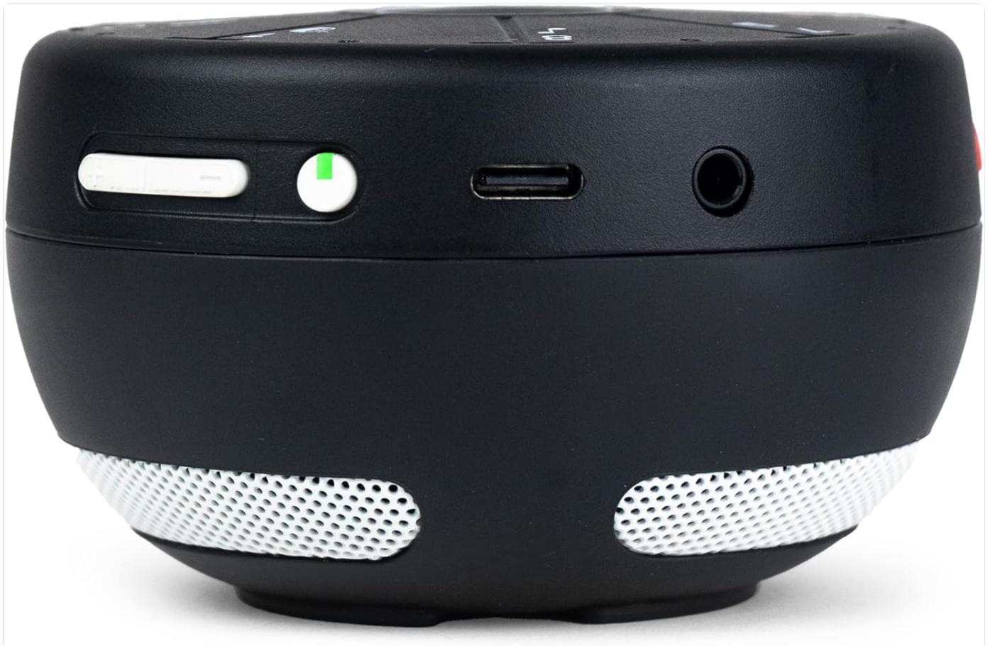
Image: The side of the Orba 3 showing its power button, USB-C port, and headphone jack for various connections.