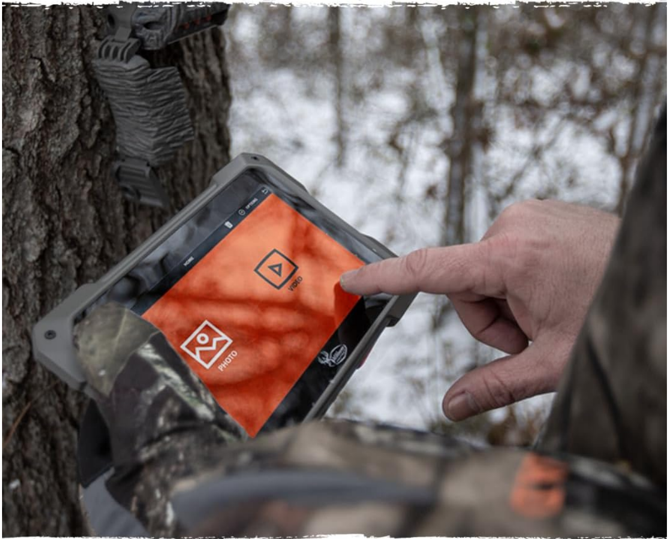
Image 4.1: Viewing Media. This image shows a user's finger tapping on a 'Video' icon on the Wildgame Innovation Trail Pad Tablet screen, indicating the process of selecting and viewing media files.

Insert an SD card from your favorite trail cam into the library port to view every deer, hog and turkey in HD quality.