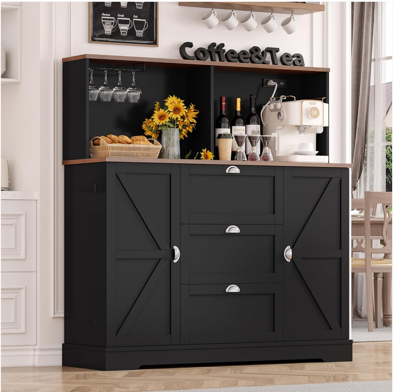
Image 1.1: Fully assembled HIFIT PB-035 Farmhouse Coffee Bar Cabinet in black finish, showcasing its overall design and functionality in a kitchen setting.