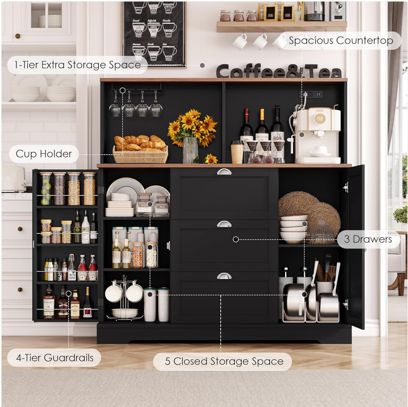
Image 5.1: The HIFIT PB-035 cabinet configured as a bar, displaying wine bottles, glasses, and decorative items.

The integrated wine rack is designed to hold standard wine bottles horizontally, preserving cork integrity.