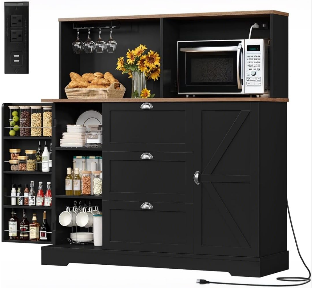
Image 4.1: The HIFIT PB-035 cabinet highlighting the integrated power outlet, glass holder, and various storage compartments.