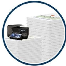
Higher Page Yield