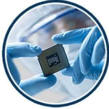
With Upgraded Chip