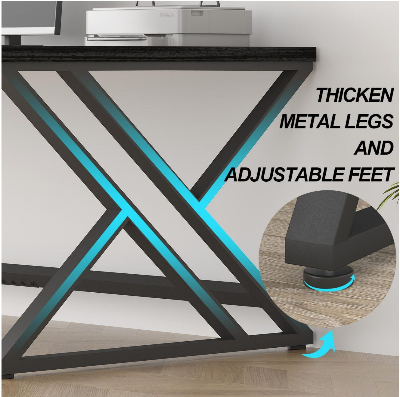
Image: Close-up view of the X-shaped metal leg frame, emphasizing its robust design.

Secure the leg frames to the desktop using M6*40mm bolts (C) and the Allen key (B). Fully tighten all bolts for the leg frames.