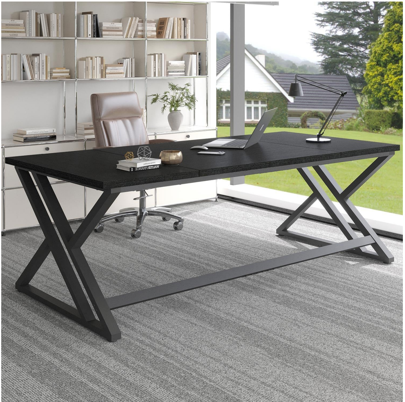
Image: Fully assembled LVB 78.7 Inch Black Oak Computer Desk in an office environment.

Attach the flat brackets (7) to connect the desktop panels using M6*15mm bolts (A) and the Allen key (B). Secure all 8 bolts.