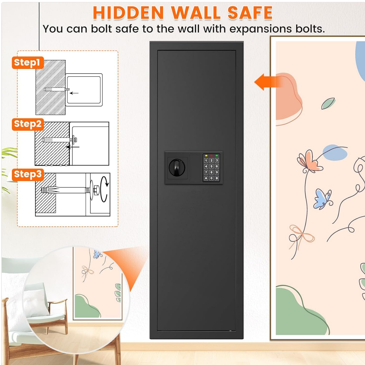
Image 3.1: Step-by-step diagram illustrating the process of wall mounting the Zogola 130EN Wall Safe using expansion bolts.