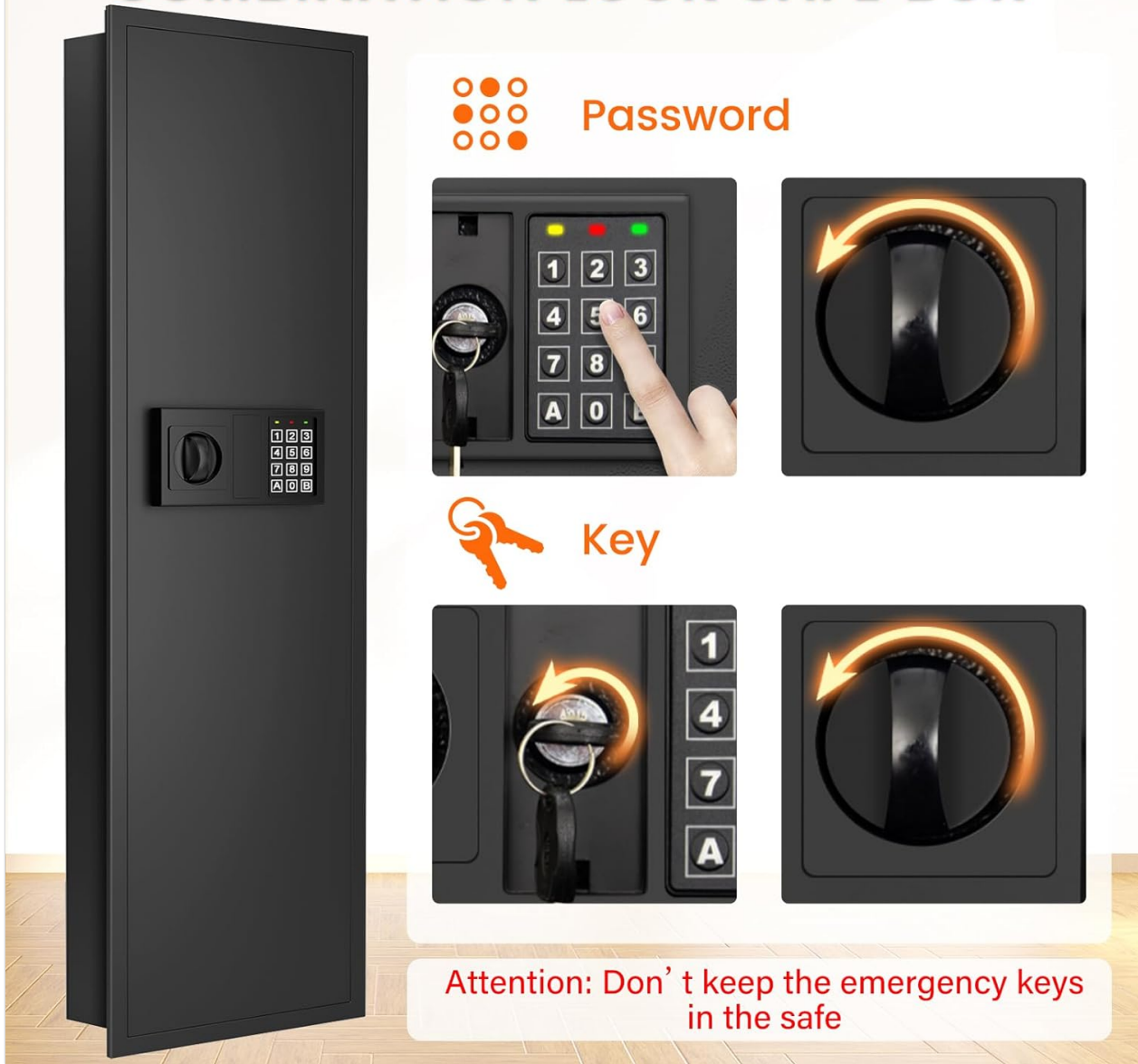
Image 4.1: Close-up of the Zogola 130EN Wall Safe's combination lock, showing the keypad for password entry and the emergency keyhole with turning knob.