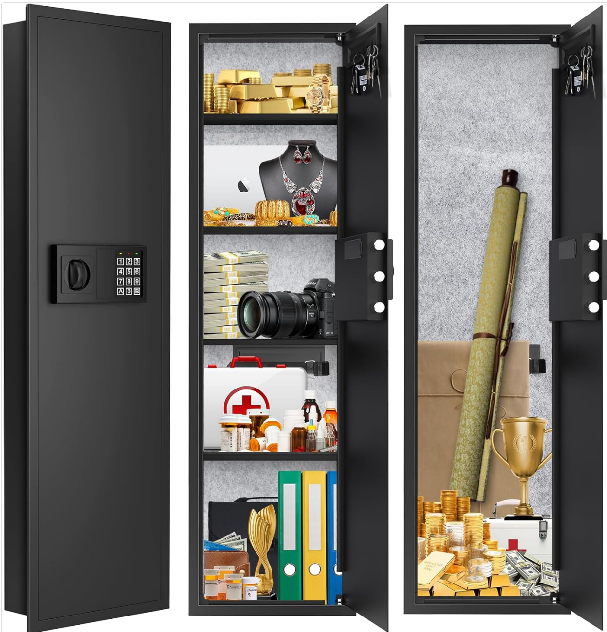
Image 1.1: The Zogola 130EN Wall Safe, illustrating its sleek exterior and organized interior with various items stored.