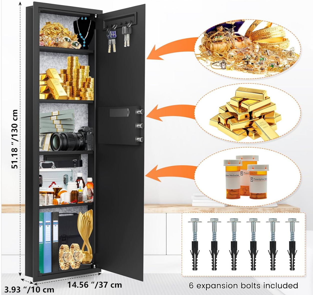
Image 2.1: Detailed view of the Zogola 130EN Wall Safe, highlighting its dimensions and the organized interior with various items.