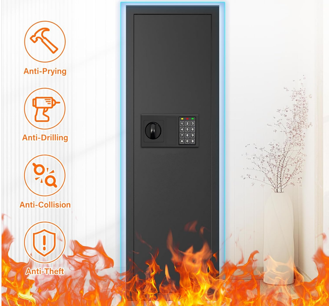
Image 2.2: Illustration of the Zogola 130EN Wall Safe's security features, including resistance to prying, drilling, and collision, emphasizing its anti-theft design.