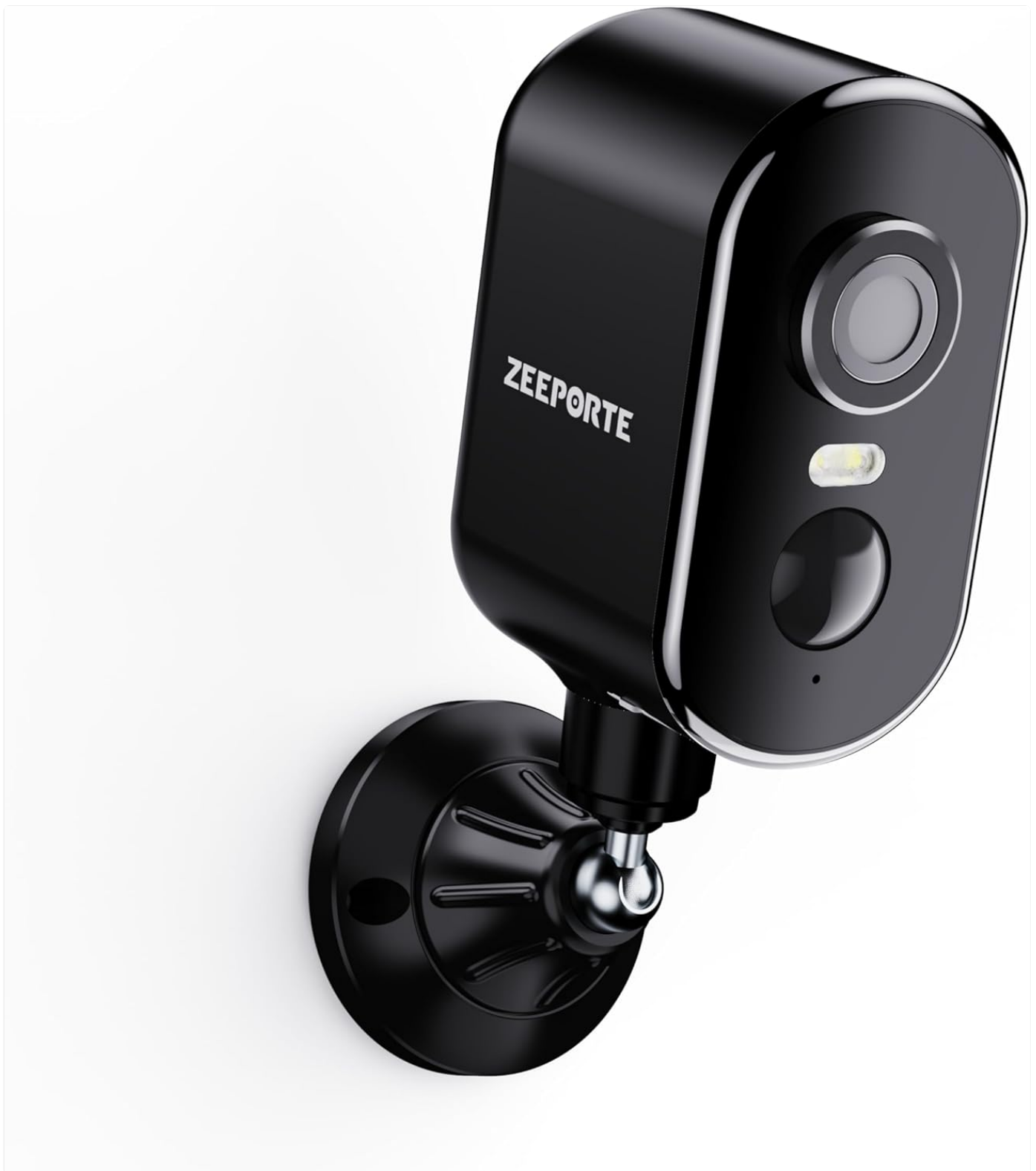
Image: ZEEPORTE SECURITY ZY-Q1 Wireless Outdoor Security Camera mounted on a wall.