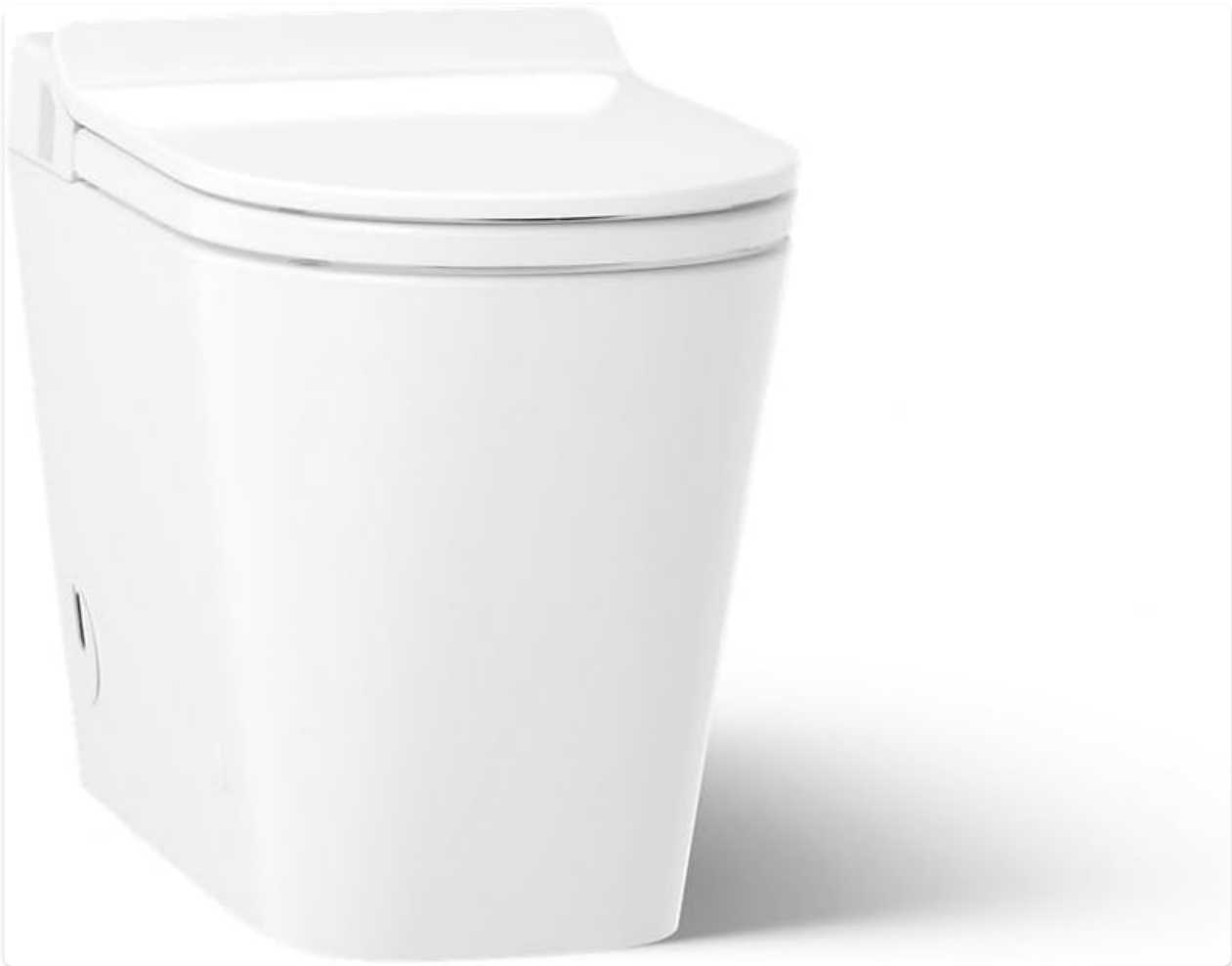
Front view of the Kohler Leap Smart Toilet, showcasing its sleek, one-piece design.