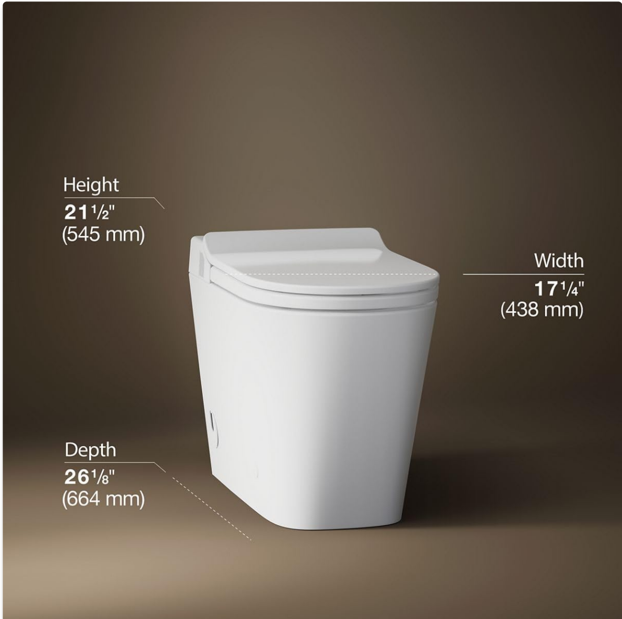
Diagram showing the dimensions of the Kohler Leap Smart Toilet: Height 21 1/2" (545 mm), Width 17 1/4" (438 mm), Depth 26 1/8" (664 mm).