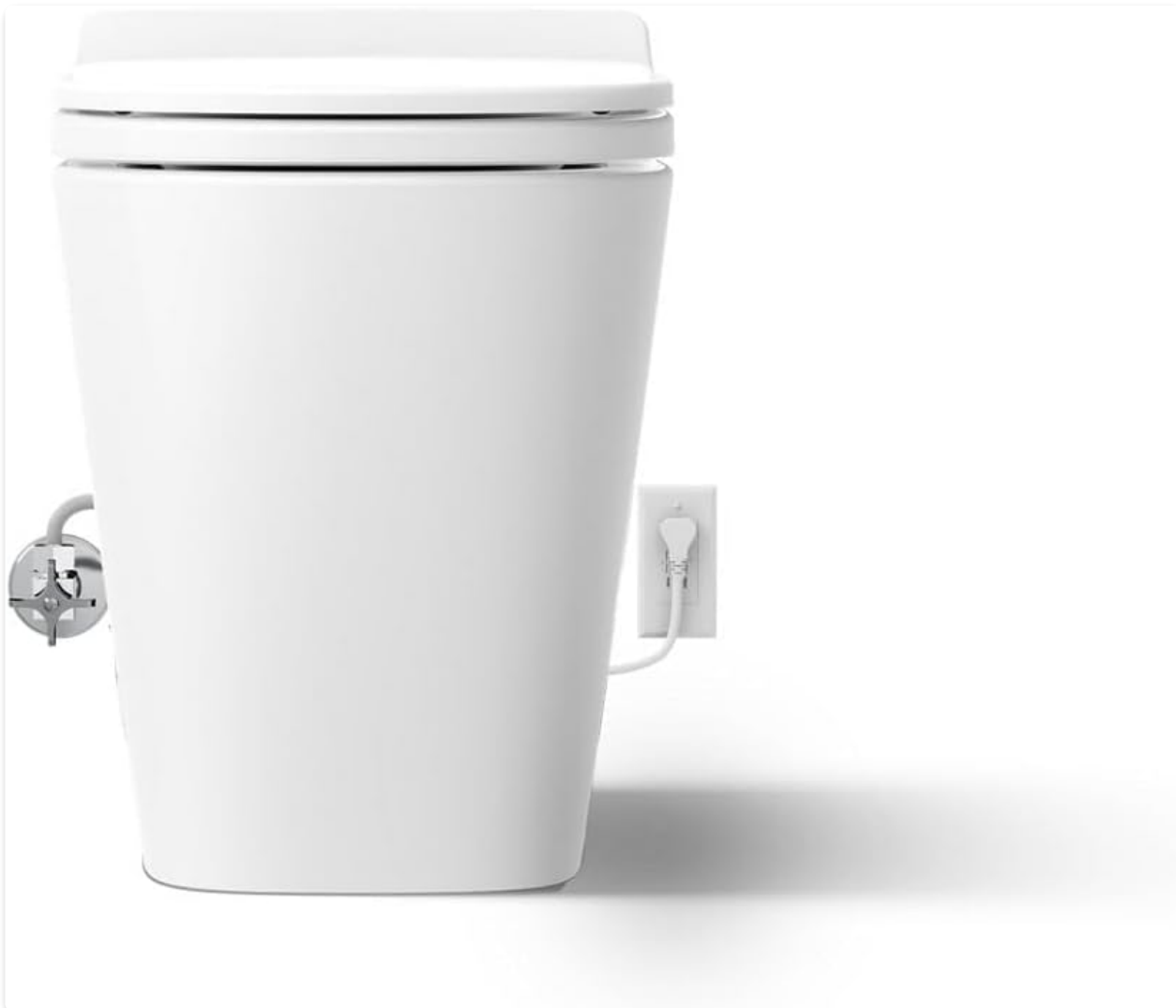
Rear view of the toilet showing the water supply and power cord connections. Ensure cables are not pinched.