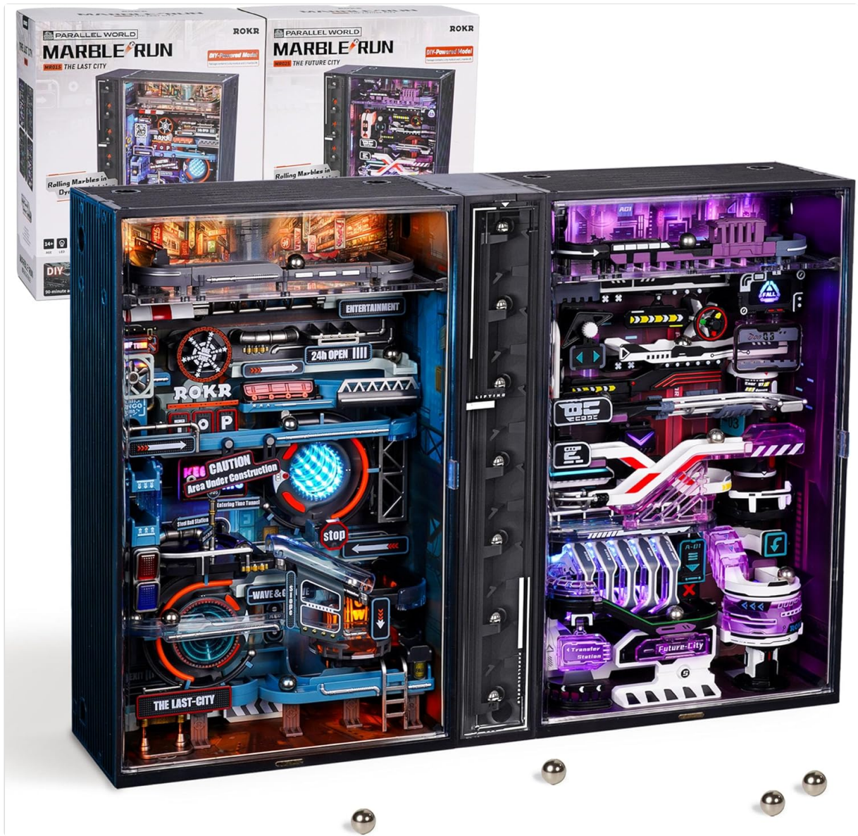
Figure 1: The ROKR Parallel World Marble Run Kit (MR01S & MR02S) assembled.