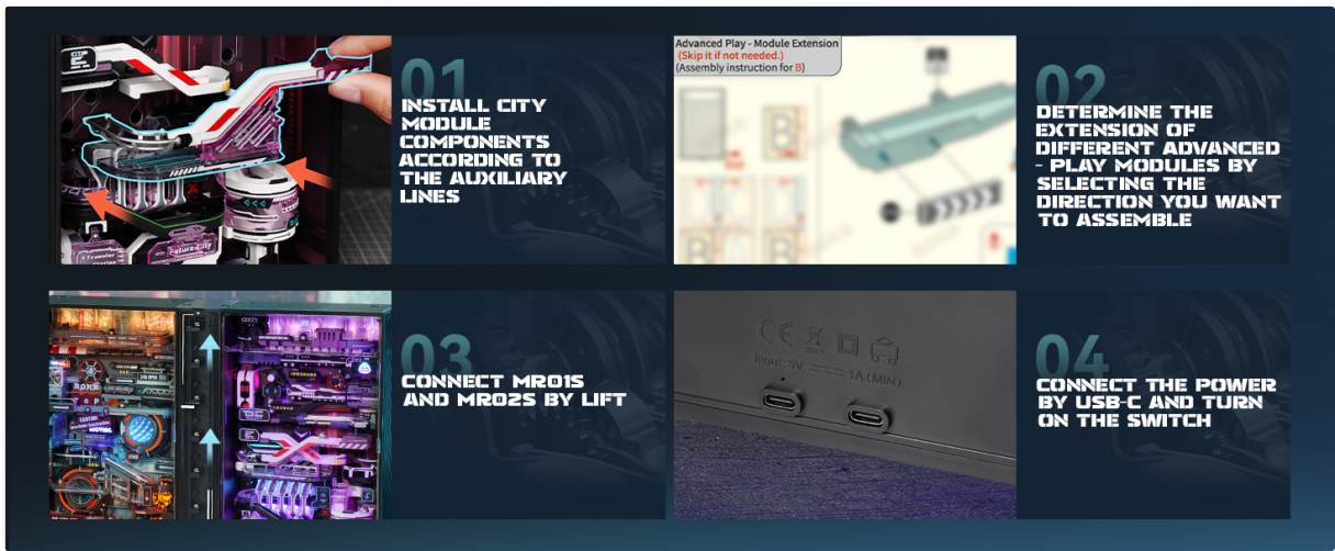
Figure 3: Key steps in assembling and connecting the marble run modules.