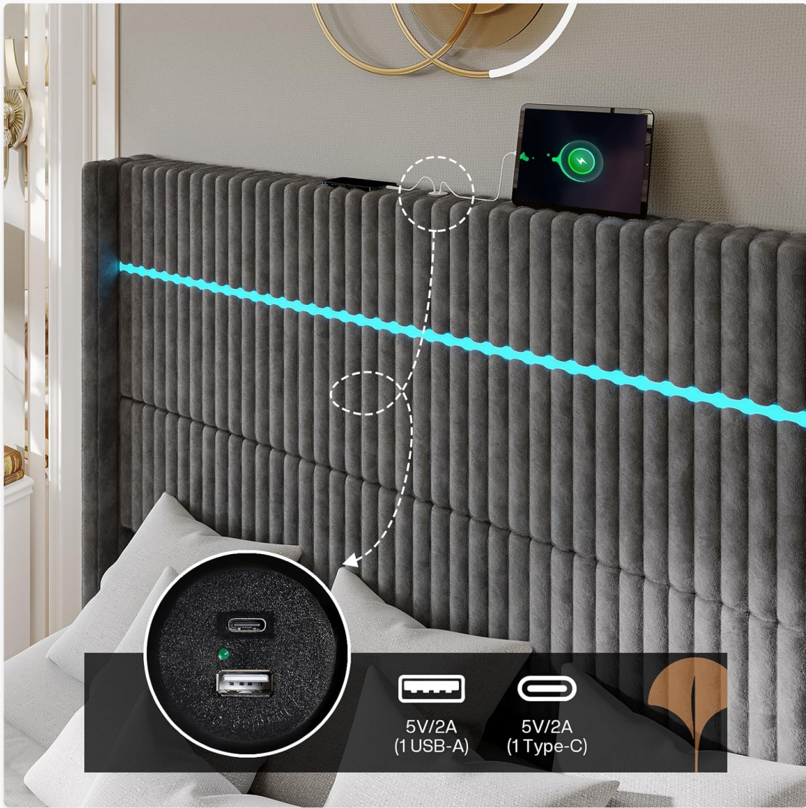
Figure 4: RGB LED Lights and Remote Control

Your browser does not support the video tag.