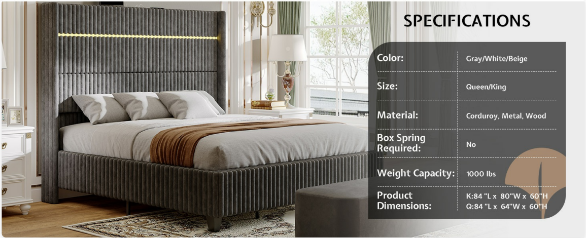
Figure 6: Bed Frame Structure and Assembly Features