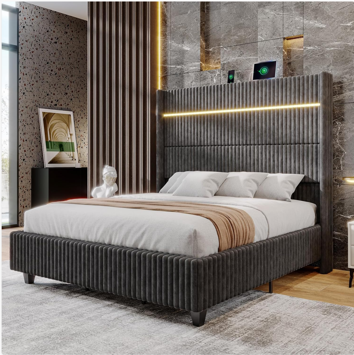
Figure 1: Jocisland 60" Tall Queen Bed Frame