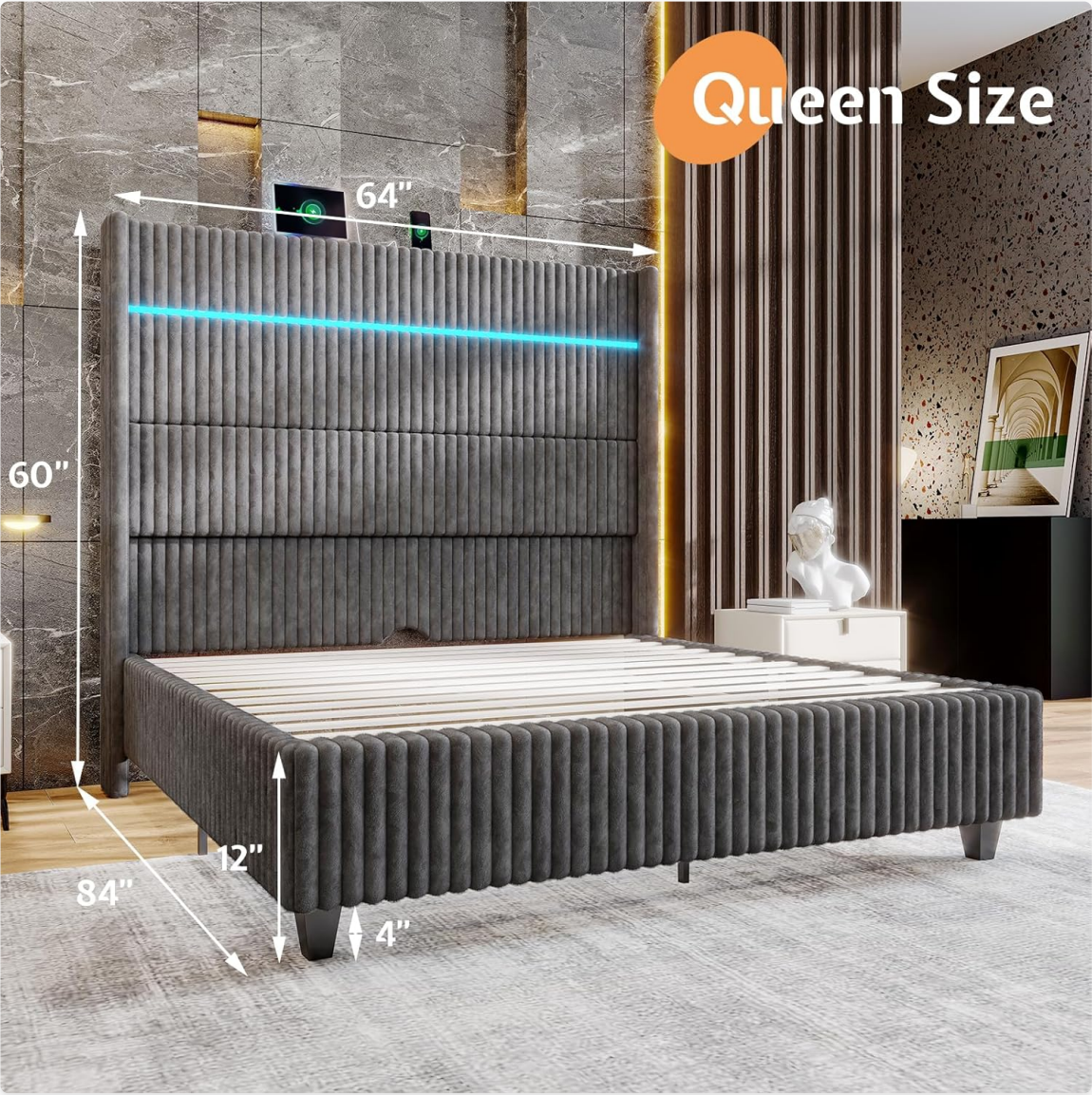
Figure 5: Product Dimensions