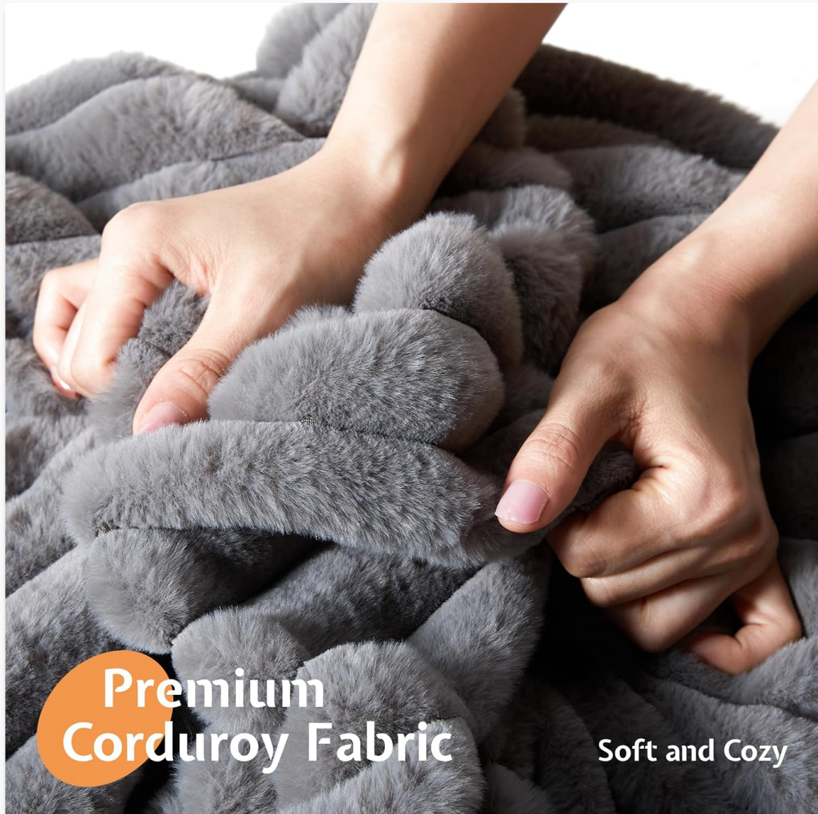
Figure 2: Soft Corduroy Upholstery