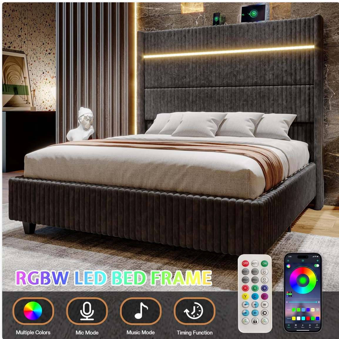
Figure 3: Integrated Charging Station