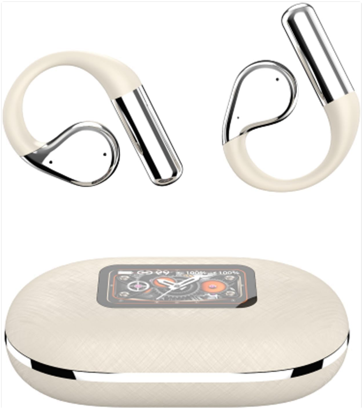
Image: The Hsermlh OWS True Wireless Open Ear Headset, showing both earbuds and the charging case with its integrated color touch screen.