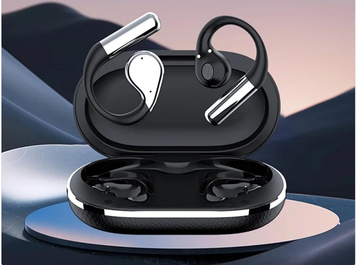
Image: The earbuds in their charging case, highlighting the "Panoramic stereo" feature, emphasizing comfortable wear and lightweight design (7 grams per ear).

Comfortable to wear, weighing only 7 grams per ear, more lightweight