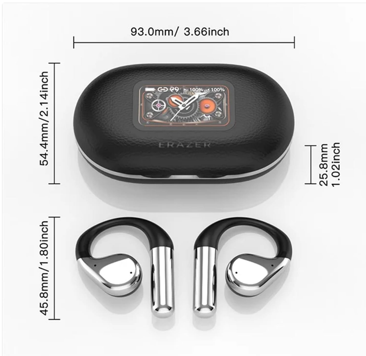
Image: Diagram illustrating the dimensions of the Hsermlh OWS True Wireless Open Ear Headset earbuds and their charging case. The case measures approximately 93.0mm (3.66 inches) in length and 54.4mm (2.14 inches) in width. Each earbud measures approximately 45.8mm (1.80 inches) in length.