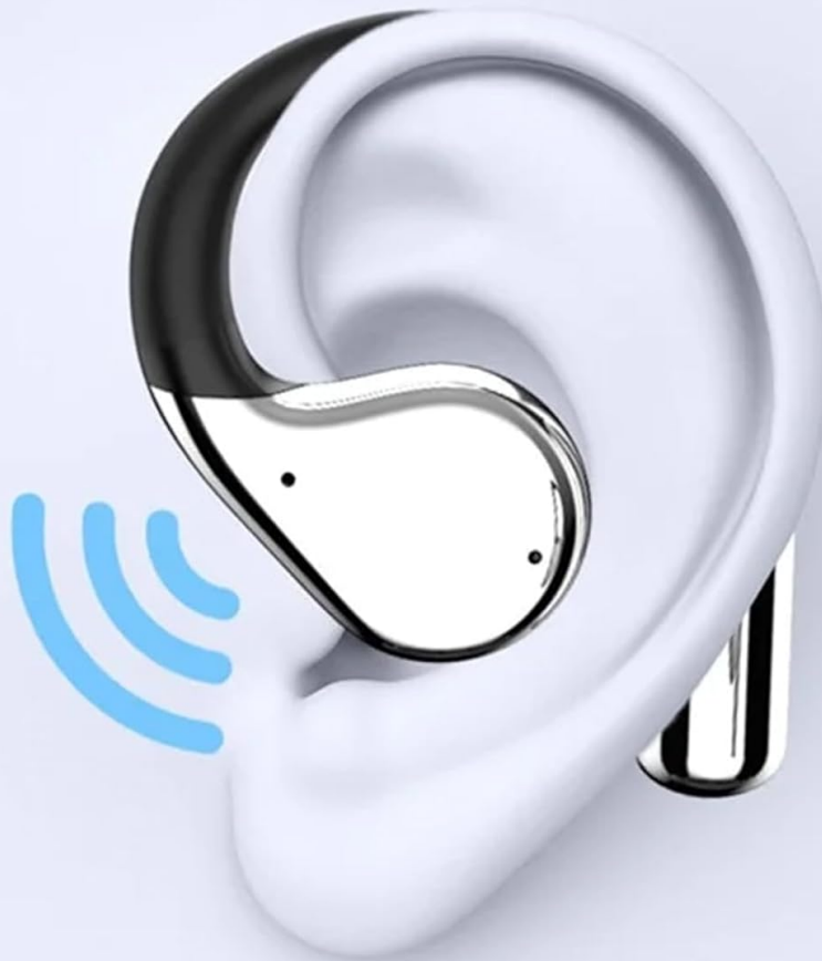
Image: A diagram showing an earbud positioned on an ear, with blue waves indicating directional sound transmission, a result of the special cavity design to increase peak frequency.

Special cavity design to increase peak frequency