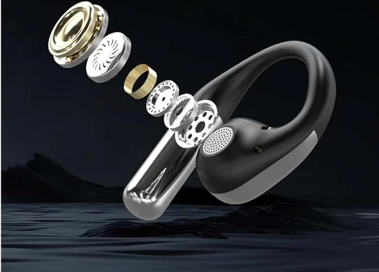
Image: An exploded view of an earbud's internal components, illustrating the professional acoustic tuning and high elasticity composite diaphragm responsible for sound quality.

Professional acoustic tuning, high elasticity composite diaphragm