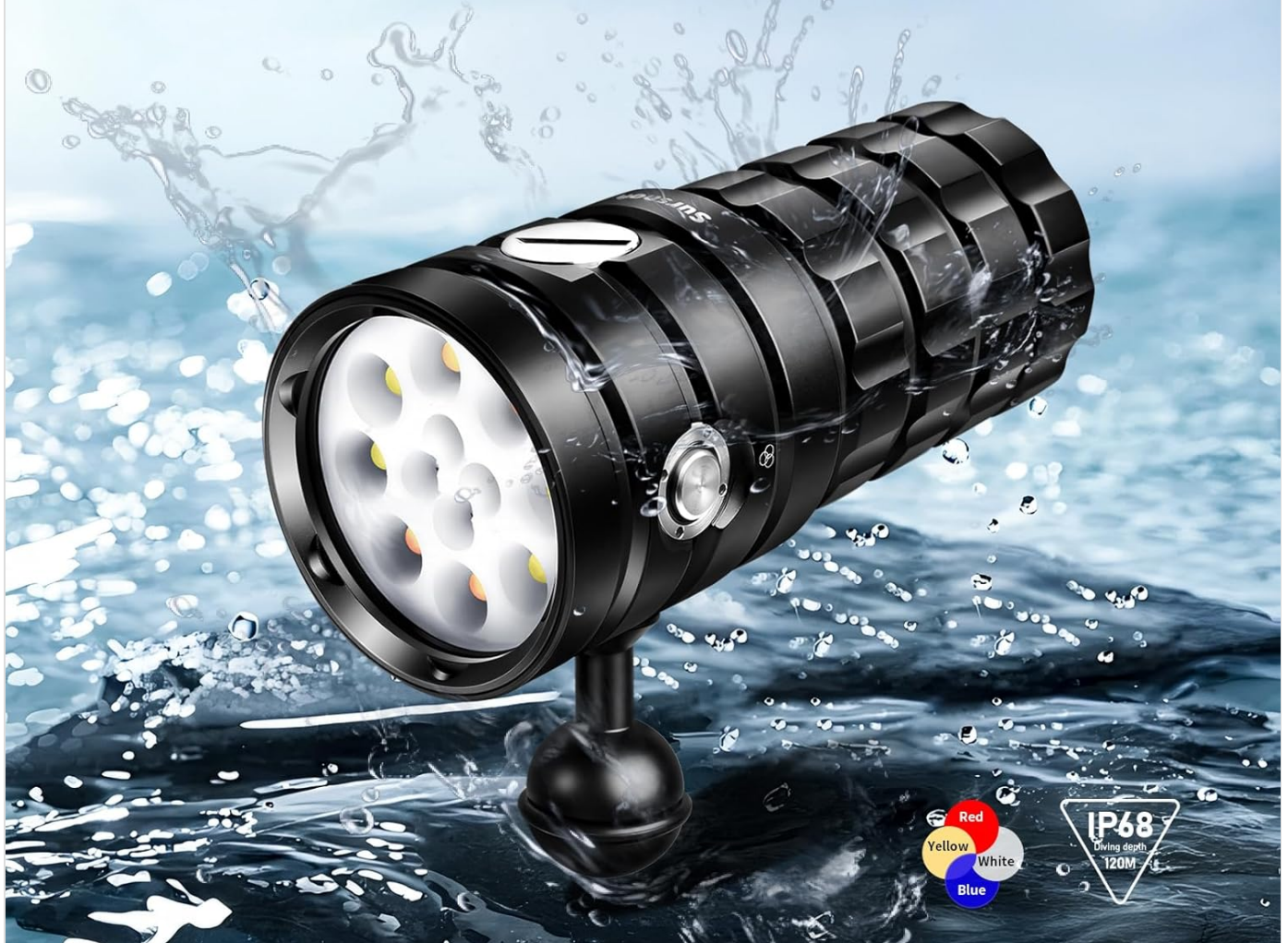
Image 1.1: Sursnong StarShine-SR highlighting key features like 120m diving depth, corrosion protection, aviation aluminum construction, 1m fall protection, and integrated 21700 batteries.