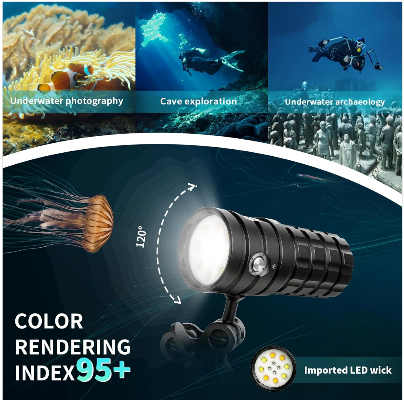
Image 6.2: High Color Rendering Index (CRI 95+) for accurate color reproduction.

Press the right button repeatedly to cycle through these red and blue light modes.