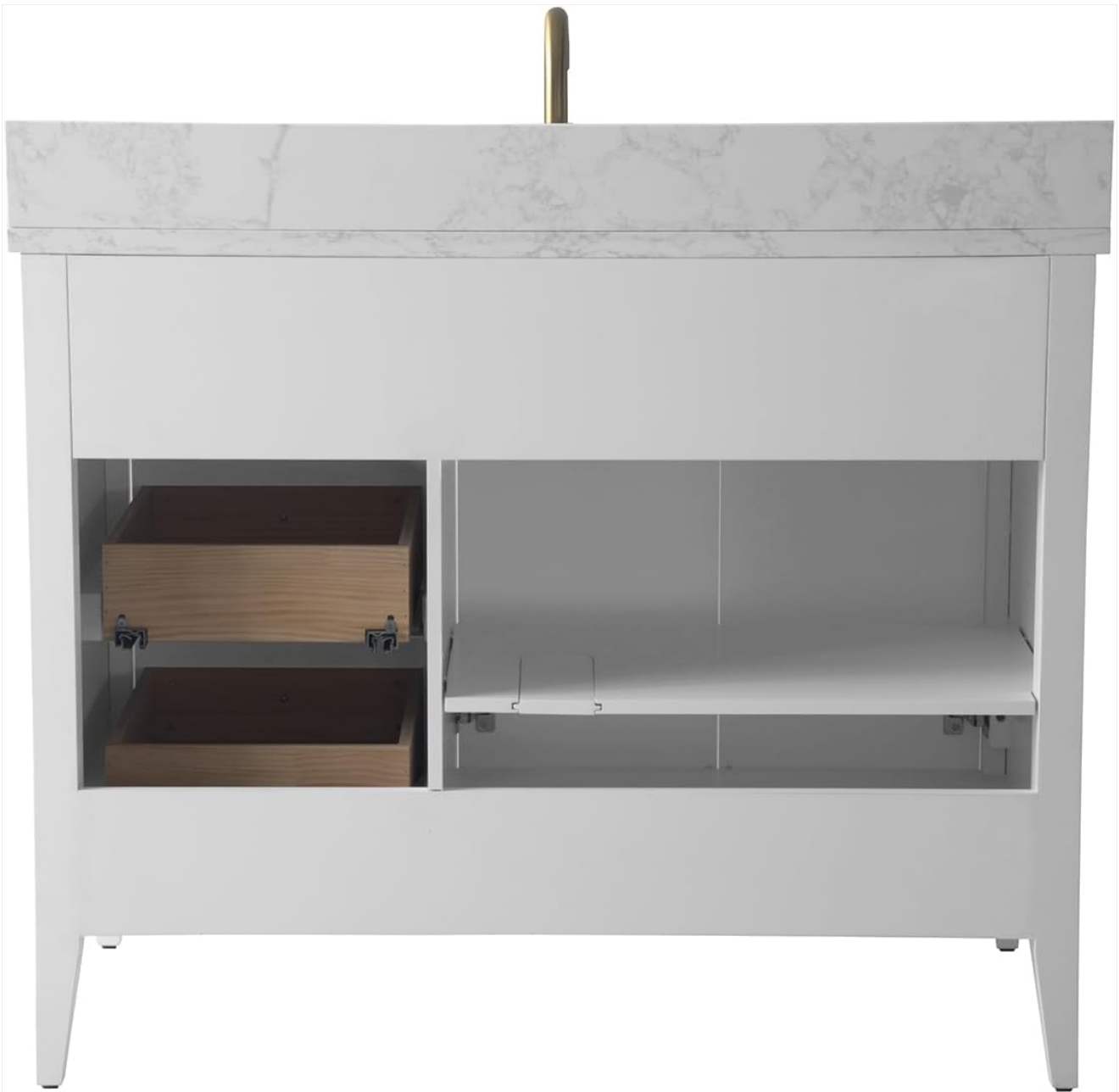
Image: Rear view of the vanity cabinet, showing plumbing access and internal structure.