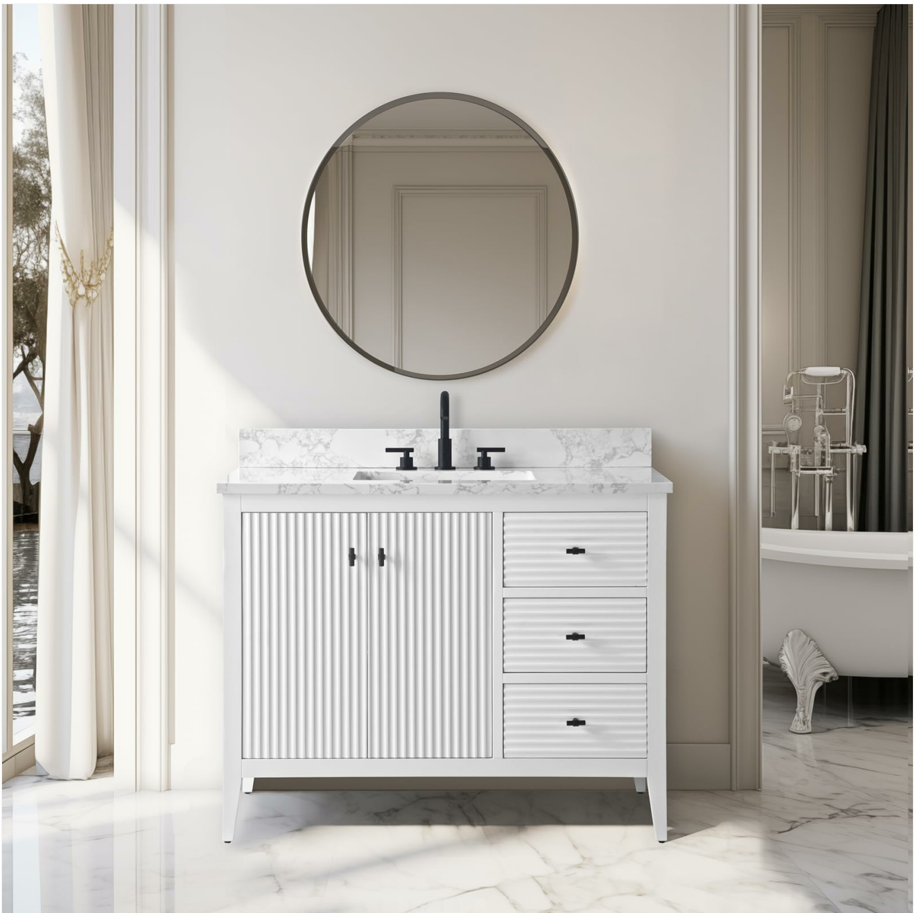
Image: Front view of the Vanity Art 42-inch Bathroom Vanity with white finish and matte black handles.