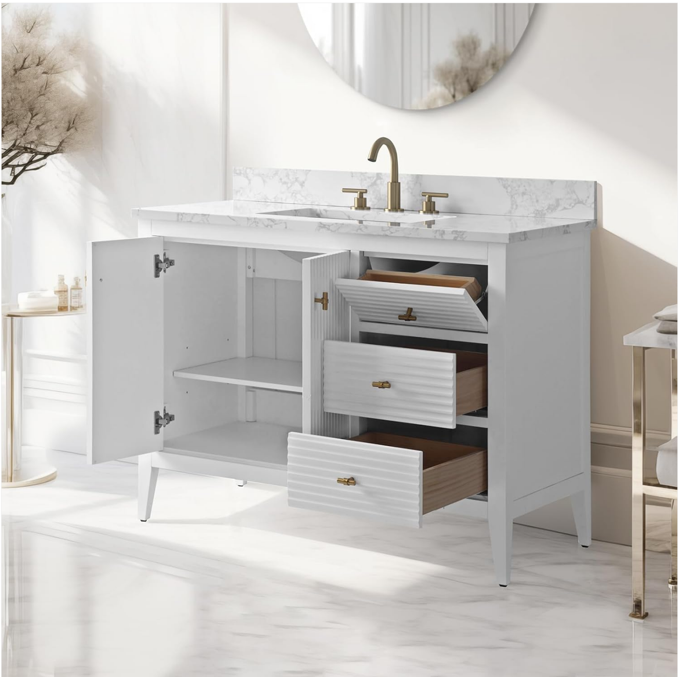
Image: The vanity with its soft-closing doors and drawers open, showcasing the internal storage and linear pattern.