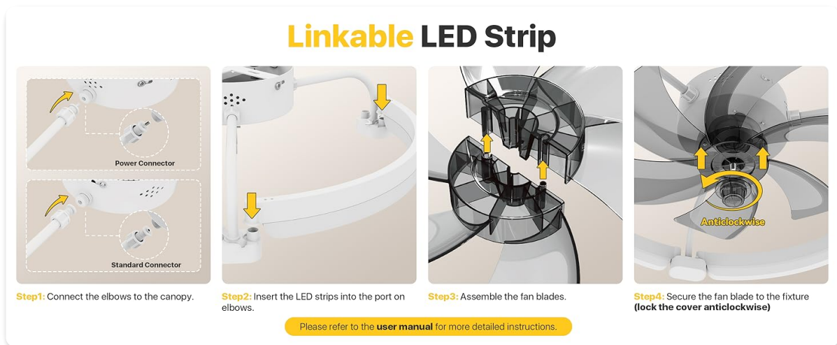
Image: A four-step visual guide demonstrating the assembly process: connecting elbows to the canopy, inserting LED strips, assembling fan blades, and securing the fan blade assembly.