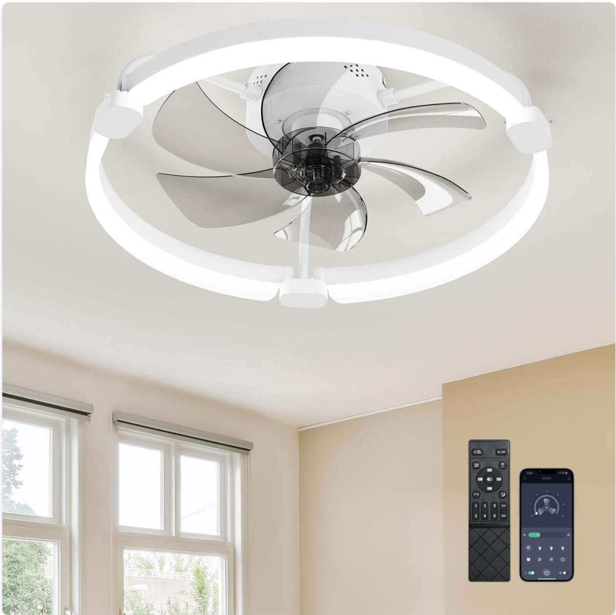
Image: The Ensenior 20-inch Low Profile Ceiling Fan, showcasing its modern design with integrated lighting and fan blades. A remote control and smartphone displaying the control app are also visible, indicating multiple control options.