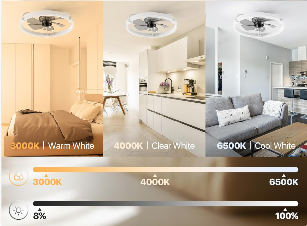
Image: Three different room settings demonstrating the 3CCT (Correlated Color Temperature) options: 3000K Warm White, 4000K Clear White, and 6500K Cool White, along with a brightness slider from 8% to 100%.