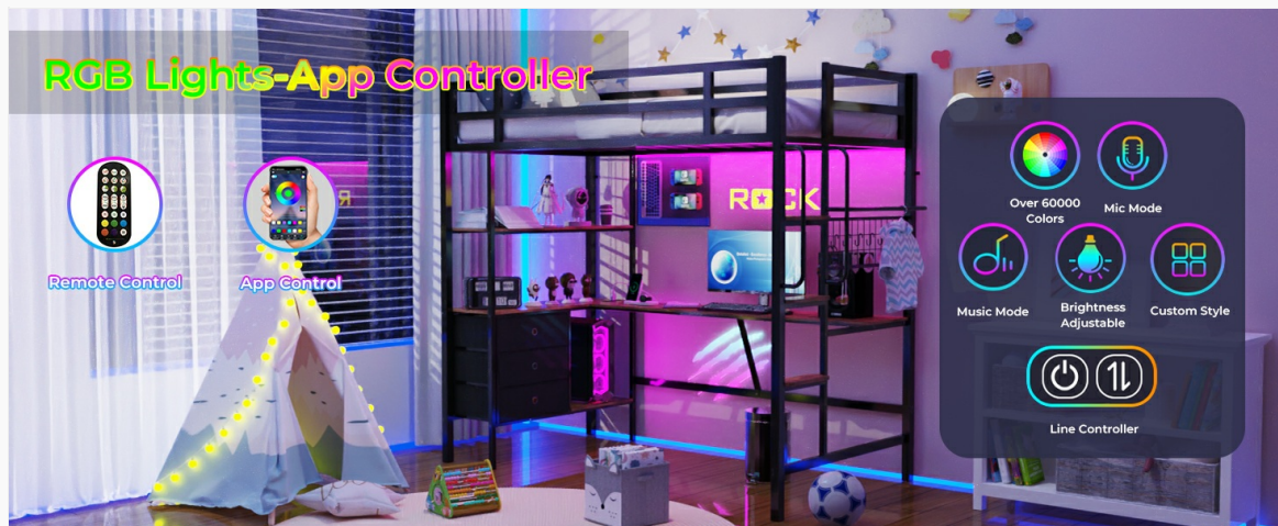
Figure 4.3: Illustration of the RGB LED lights and app control features.

The bed features RGB LED lights that can be controlled via an app, offering over 60,000 colors and 29 flashing modes. The LED lights also include a music sync function with a built-in sensitivity-adjustable microphone, allowing the light color to change with the rhythm of sound and music, enhancing the room's ambiance.