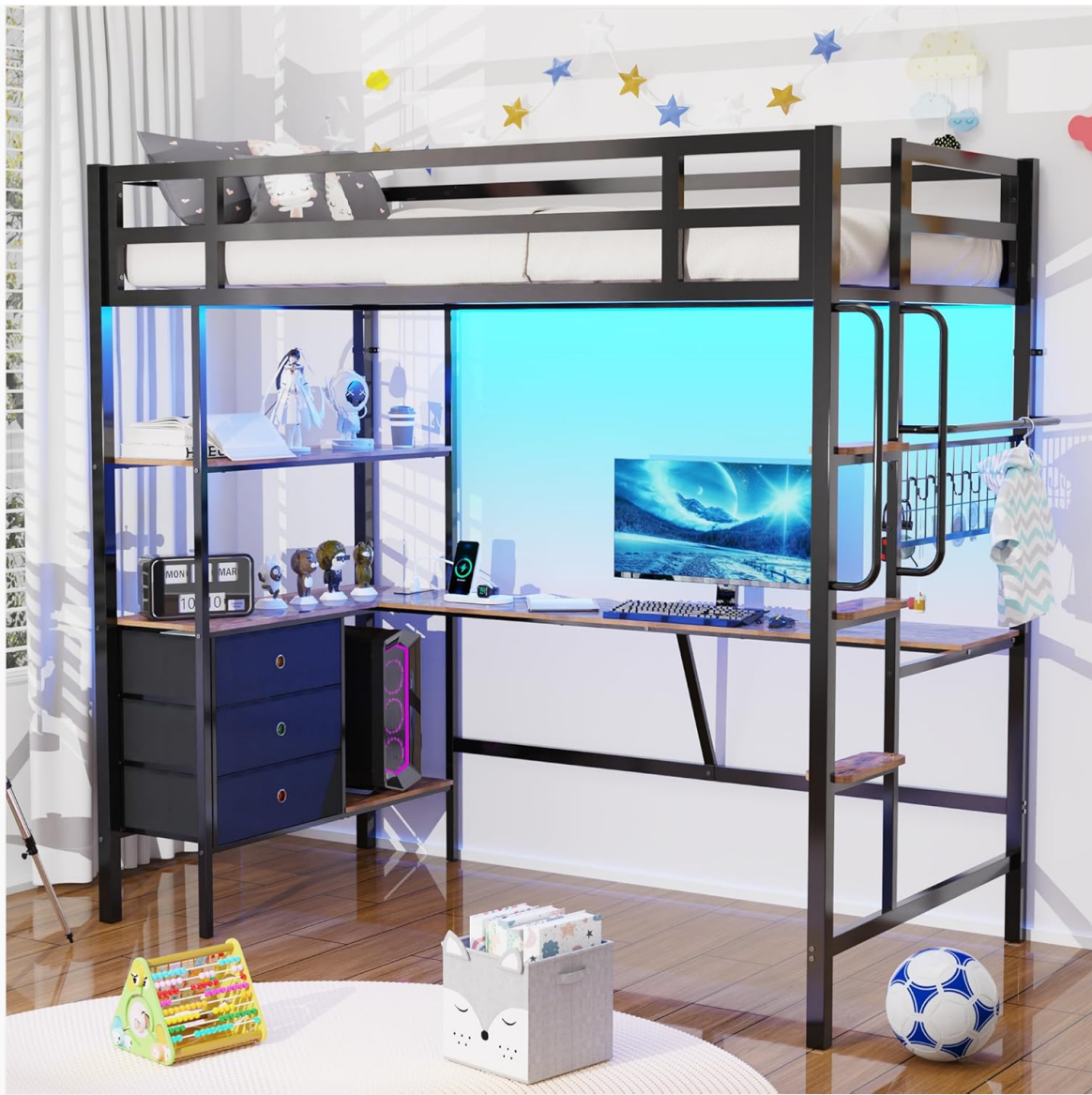
Figure 2.1: Overall view of the SANGMUCEN Twin Loft Bed.