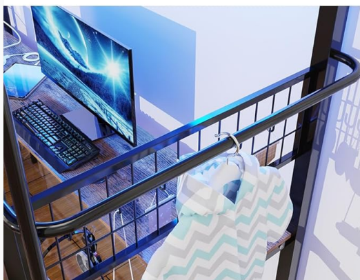
Figure 4.2: Detailed view of the storage shelves, fabric drawers, and hanging rail.