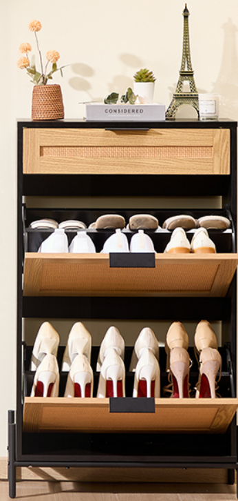
Image: A close-up illustrating the functionality of the flip-open drawers, the small top sliding drawer for miscellaneous items, and the additional storage space at the bottom.