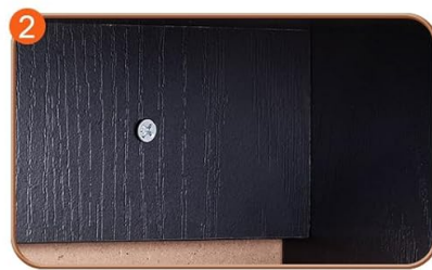
Image: Illustration of the anti-tipping device installation, showing how to secure the cabinet to a wall for stability and safety.