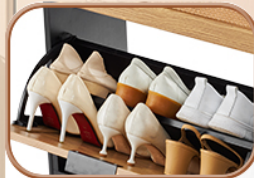
Double-Lid Drawer for Shoe Storage