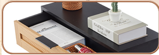
Small Drawer for Miscellaneous Storage