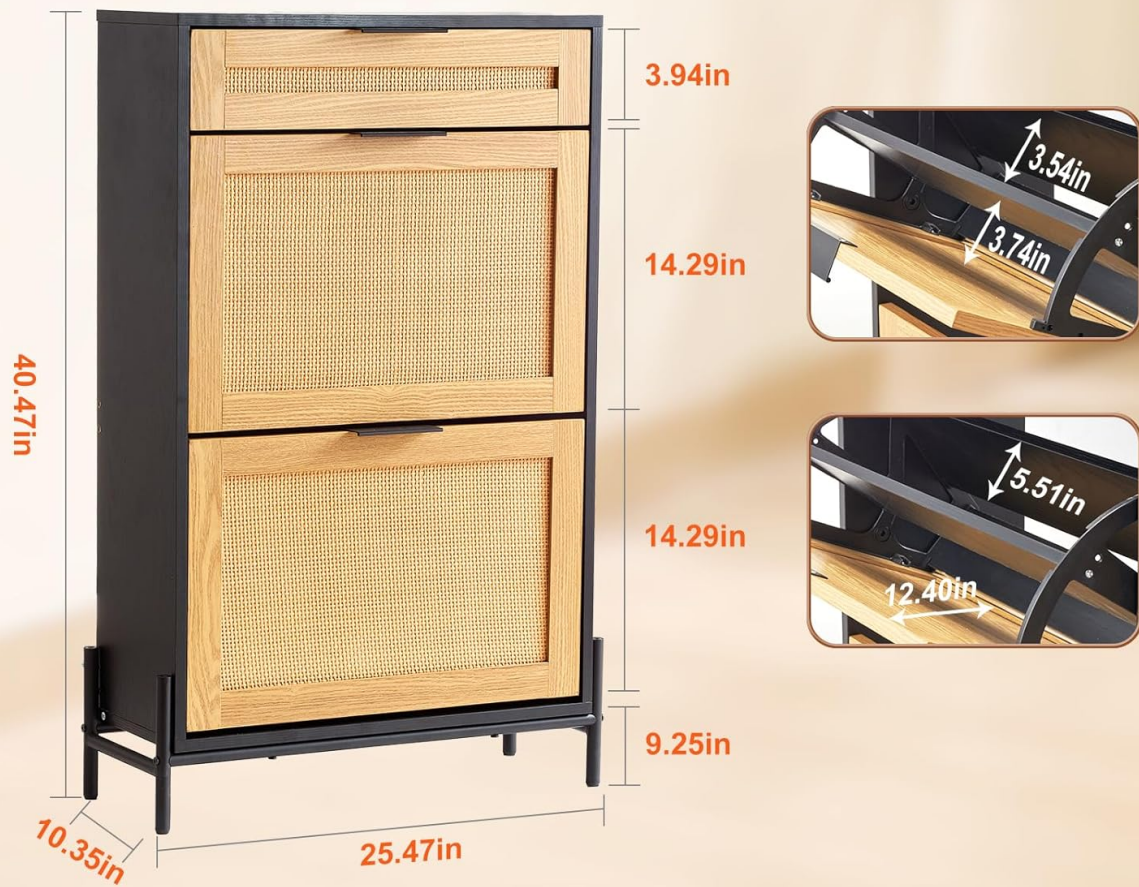
Image: Detailed product dimensions, including overall height, width, depth, and individual drawer measurements, useful for planning placement and assembly.