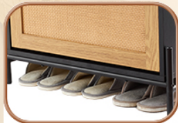
Bottom Additional Storage Space