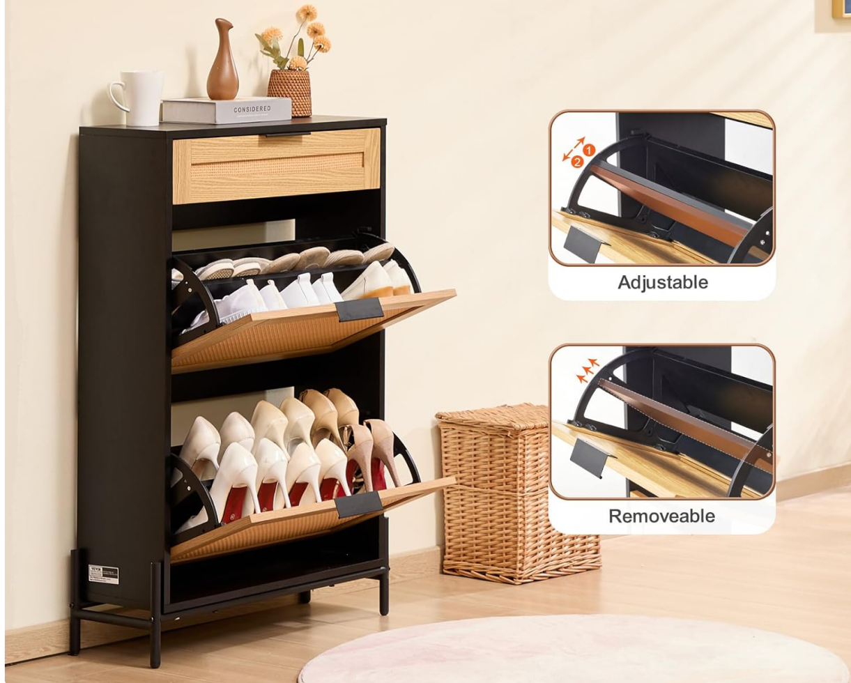
Image: Visual representation of how the internal panels can be adjusted or removed to fit different shoe types and sizes, enhancing storage versatility.